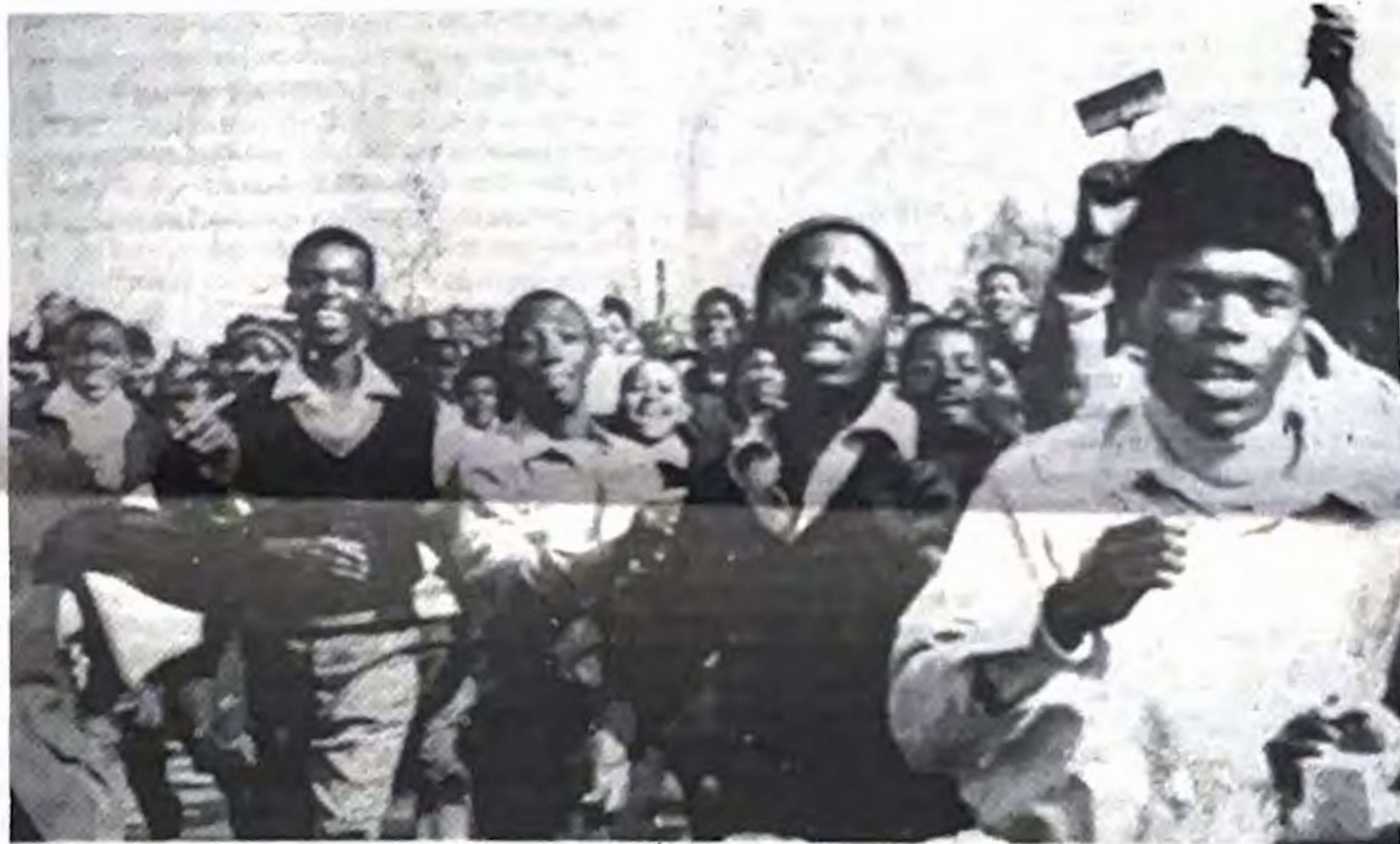
New language regulations imposed by the South African government were one abuse too many. Black students launched demonstrations in Soweto which grew into a nationwide storm of struggle.

Oppression breeds resistance, and the black people have resisted all this at every point. A quarter of a million black South Africans gathered at Sharpville