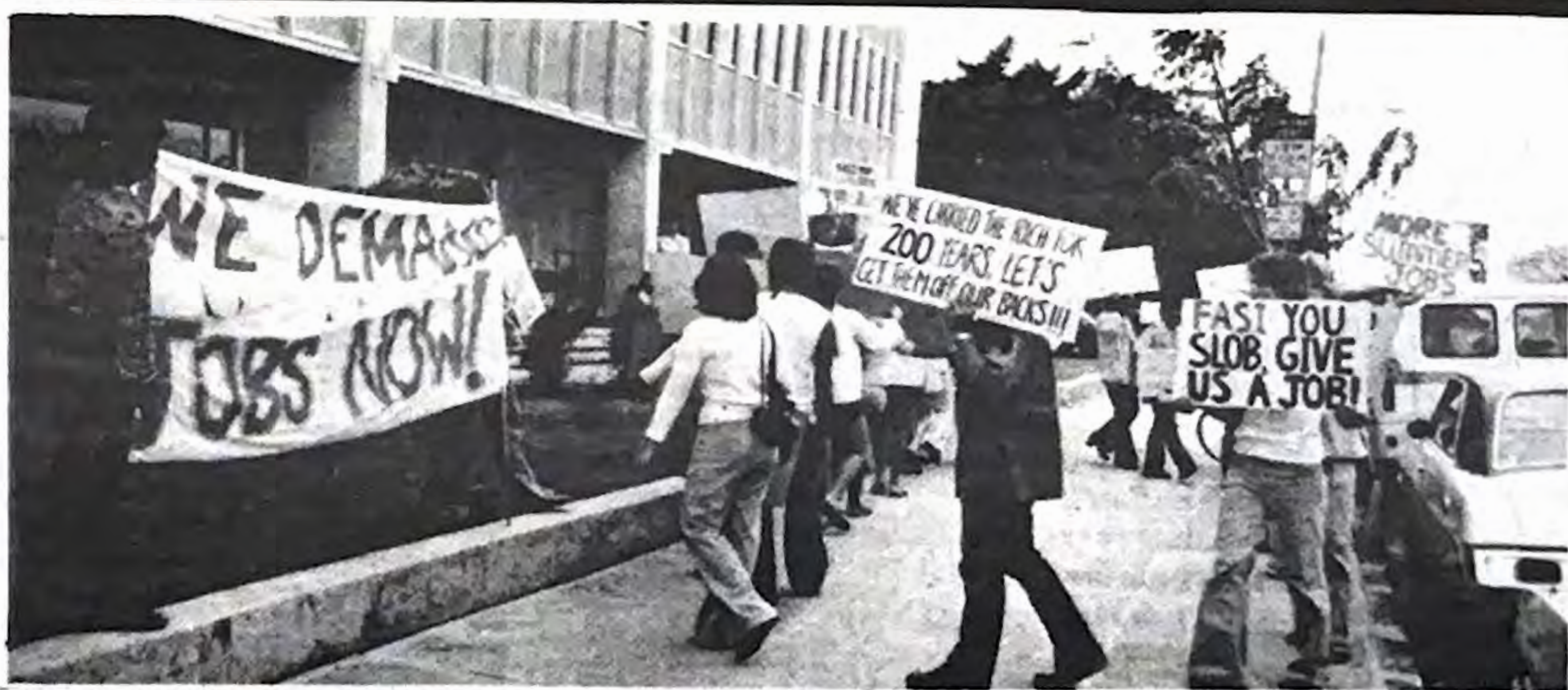
Hawaii, April 12, 1976—Youth United to Fight Back July 4th set up a lively picket line outside Honolulu's State Employment Office demanding summer jobs for youth.