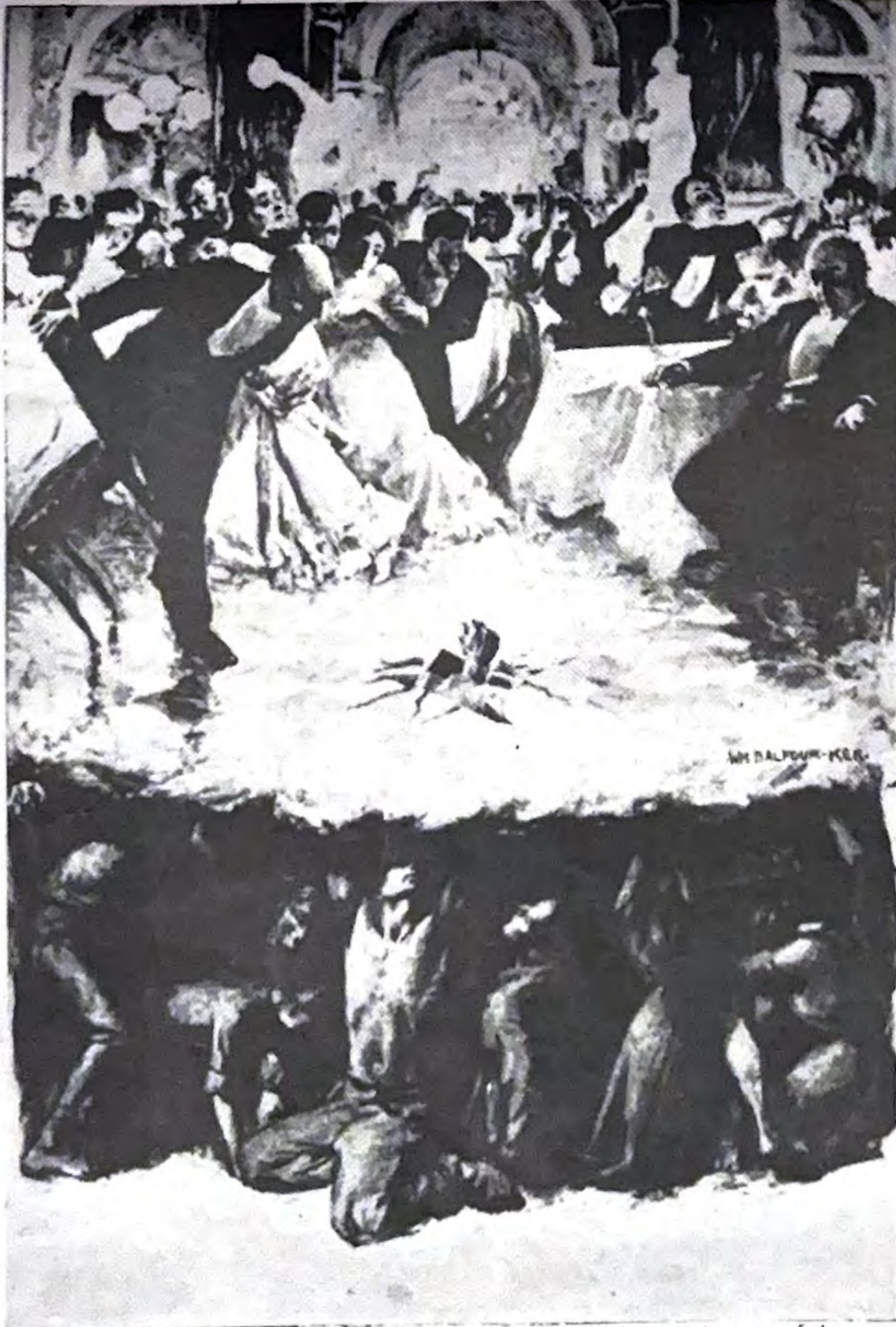
From the Depths was a popular illustration among workers at the turn of the century. It is full of the spirit of the working class rising up against its oppressors.