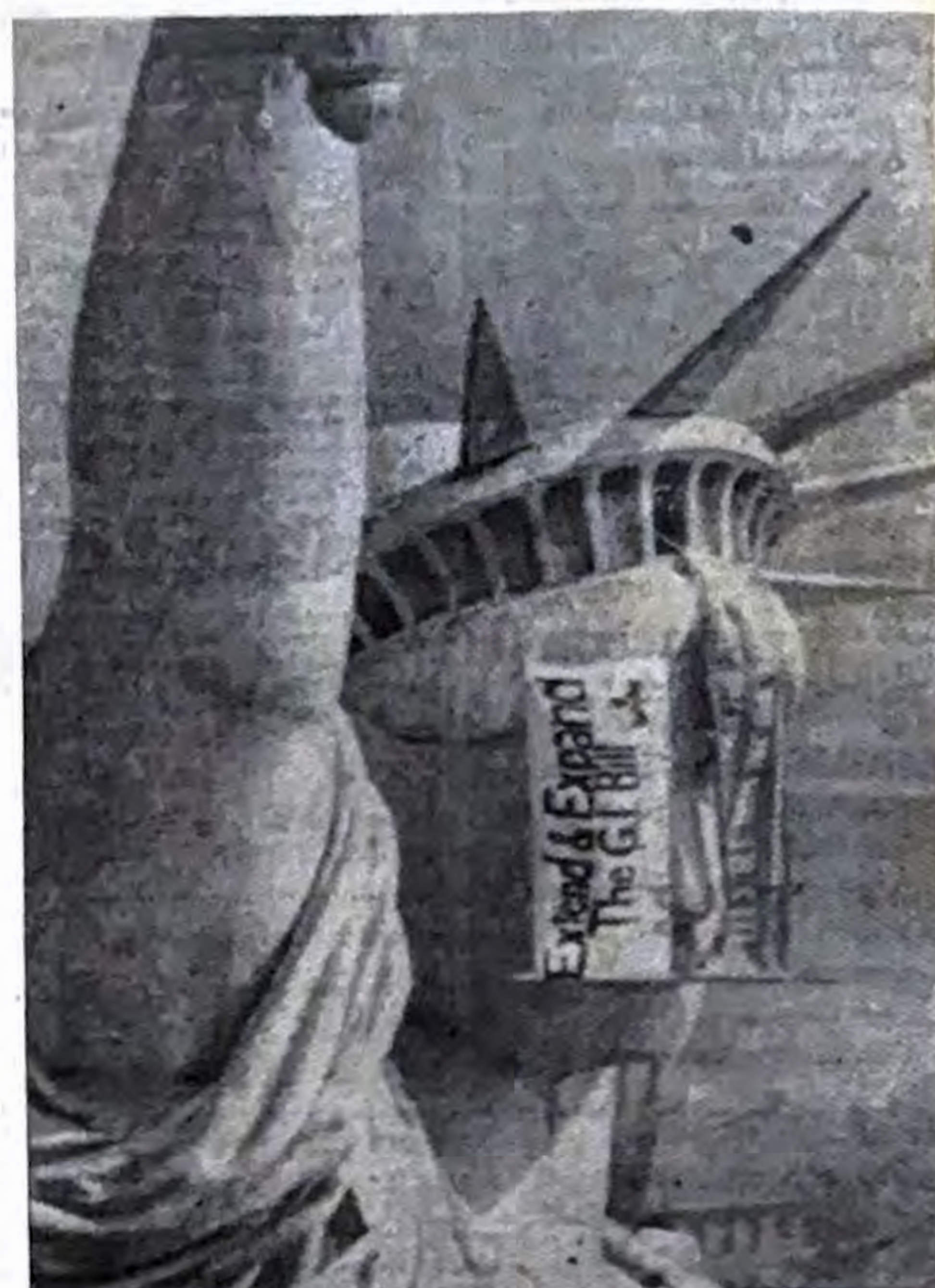
Banners of Vietnam Veterans Against the War hang from the crown of the Statue of Liberty.