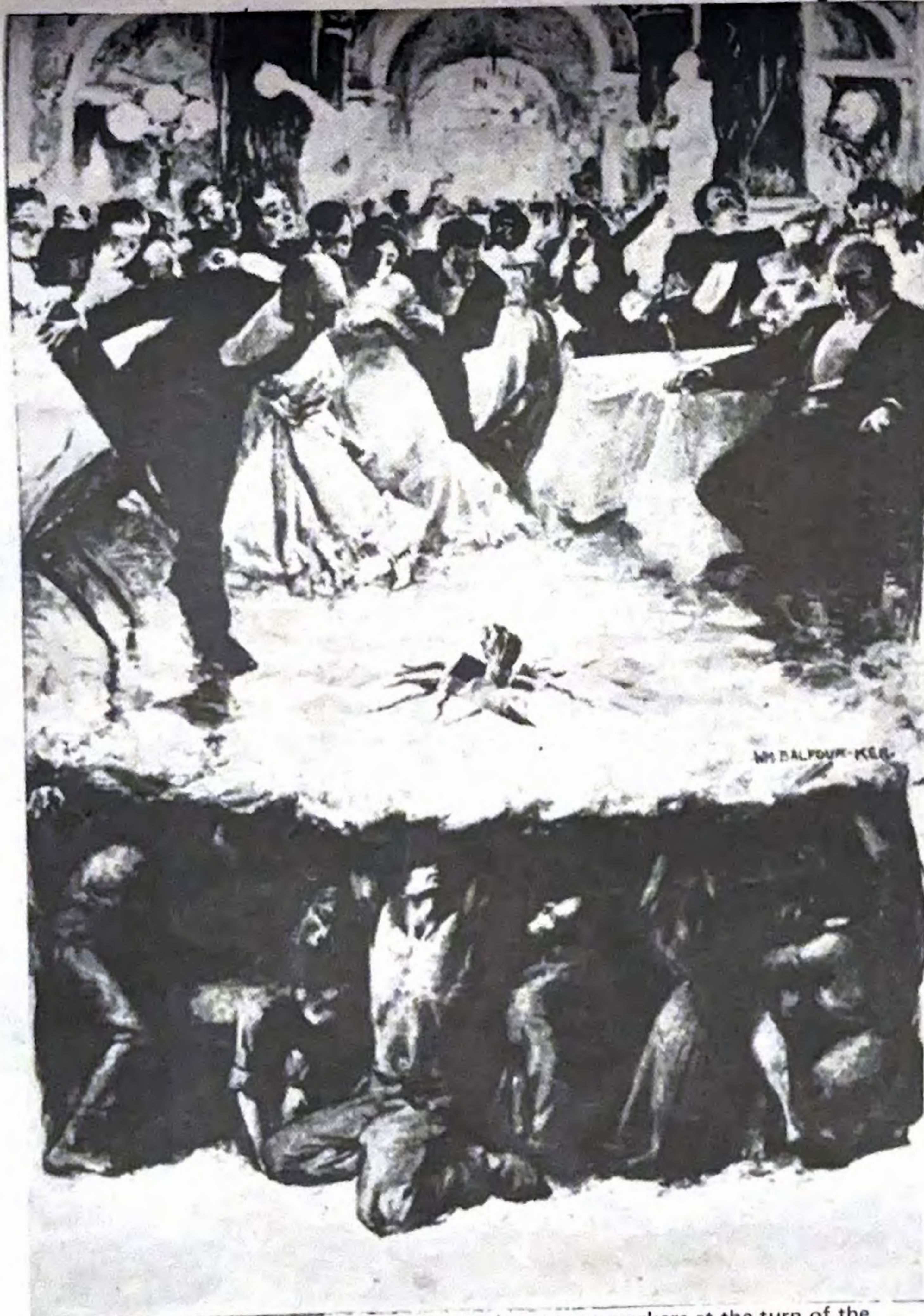
From the Depths was a popular illustration among workers at the turn of the century. It is full of the spirit of the working class rising up against its oppressors.