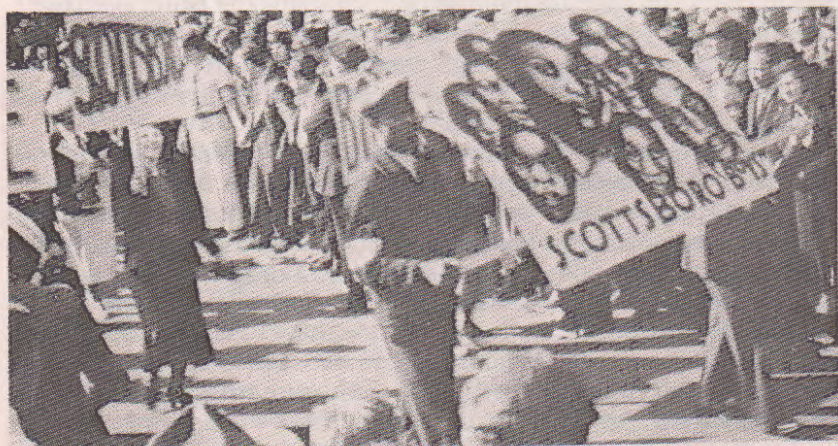
A "Free the Scottsboro Boys" contingent in the 1934 May Day parade of 50,000 in NYC. Across the country hundreds of thousands of workers actively fought to free these nine Black youth, putting the lie to the owners' propaganda that Blacks and whites can never unite.

The campaign continued to grow on a national scale. In the plants hundreds of thousands of workers eagerly took up the strug-