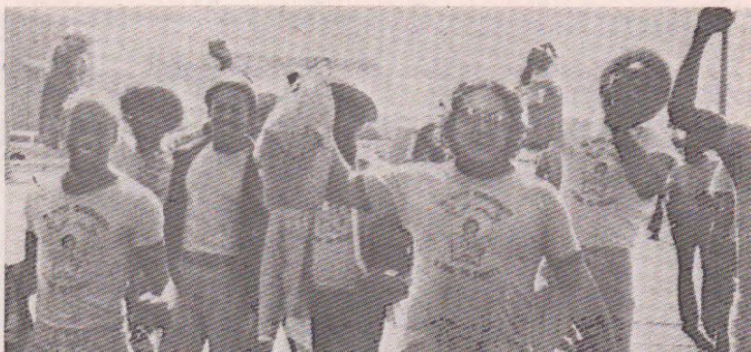
... But by organizing into a fighting force in plants and nationwide workers are beginning to break these chains. Above: Auto Workers United to Fight "T-Shirt Day" at Detroit's Ford Rouge plant during '76 contract battle.

plants, in cities and areas and nationally where workers can come together, discuss the attacks they face and the struggles being waged, decide on key battles to focus on—ones which concentrate and raise to a higher level the fight against thousands of similar abuses—and develop them into campaigns of the working class. In this way it enables workers to unite with the people in the widespread but scattered struggles around the country, focus and hone them into a sharp dagger which will draw the enemy's blood.