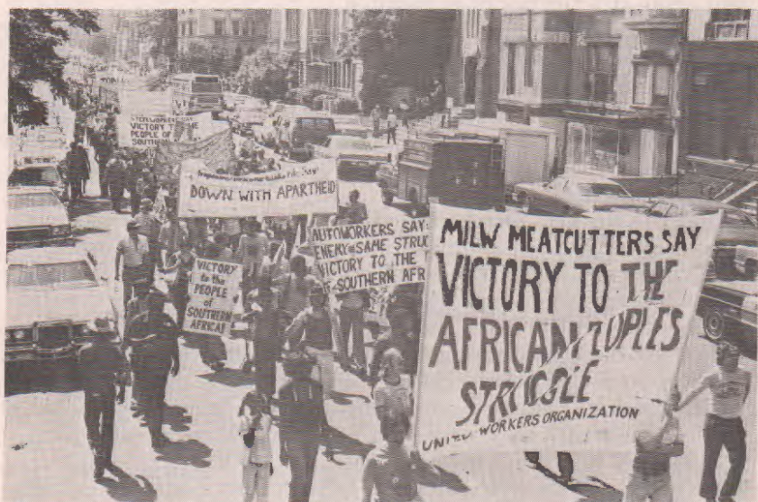
From battles in industries to battles throughout society workers have laid a solid foundation for the founding of a national workers organization. Upper: April, 1977 demonstration of steel workers in Pittsburgh against sellout contract. Lower: workers contingent in African Liberation Day march, Washington, D.C., May, 1977.