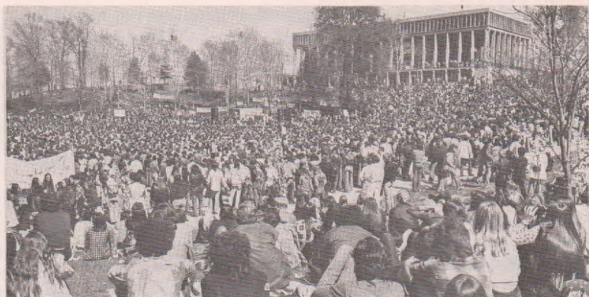
1974 memorial rally for 4 students killed in Kent State University anti-war demonstration. Had there been an organized working class force within it, the movement against the Vietnam war, which struck a powerful blow to the rulers, would have been even stronger.

laws of its profit system, the very measures the owners had to take to get out of the Great Depression—extending their robbery and exploitation around the world, spending huge sums to maintain their military to enforce and protect this plunder, etc.—have only laid the basis for the even bigger crisis they are now entering. Now they face wars of national liberation, huge government deficits, inflation and massive unemployment.