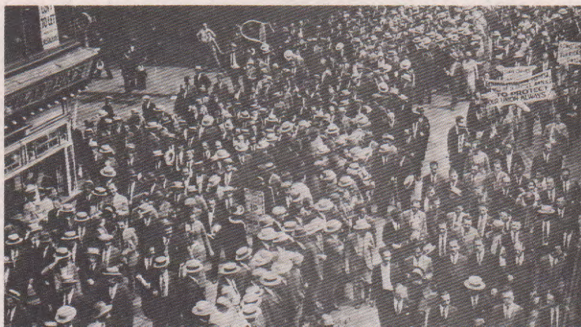
A picketing parade of Fur and Leather workers. The TUEL unleashed the initiative of the workers in this 1926 strike which successfully won the first 40 hour week in American industry.

unions" organized on an industrial basis in basic industries. It was built in response to the massive economic crisis that hit the country in 1929, and to the continuing treachery and refusal of the AFL leaders to build industrial unions. For instance, despite the massive attacks on the working class (as said before, wages were slashed 45% on the average), AFL President William Green and Co. made a written pledge to President Hoover not to strike for the duration of the crisis. In the face of the employers' offensive many unions were smashed or greatly weakened and AFL membership plummeted. The United Mine Workers, for instance, became practically nonexistent in major areas of the minefields during the early '30s.