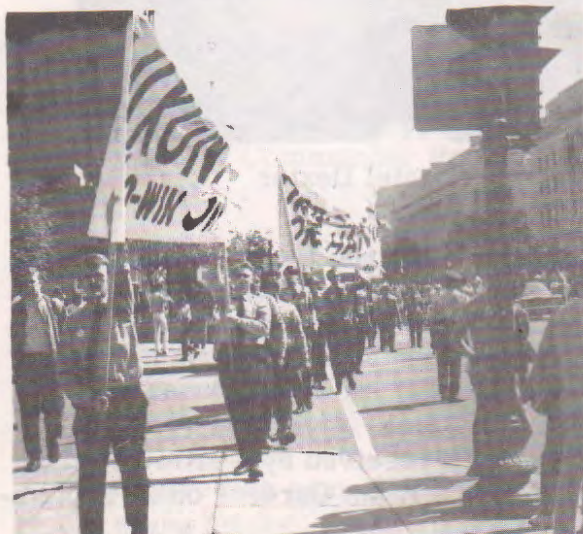
The ST on Pennsylvania Avenue ...