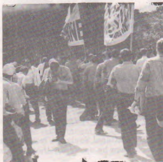
... and near the White House