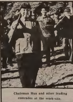
Chairman Hua and other leading comrades at the work-site.

and relaxation in the course of struggle and that the process of alliance involves struggles against reactionary things, splitist tendencies and erroneous ideas, one does not understand the law of spiral development. Chairman Mao pointed out in the period of the War of Resistance Against Japan: "TODAY OUR ANTI-JAPANESE NATIONAL UNITED FRONT POLICY IS NEITHER ALL ALLIANCE AND NO STRUGGLE NOR ALL STRUGGLE AND NO ALLIANCE, BUT COMBINES ALLIANCE AND STRUGGLE." (On Policy.) To lead any major class struggle and two-line struggle to victory, it is essential to have a good grip on this Marxist policy. The "unity-criticism-unity" formula conforms to the law of spiral development and is an important method for us to correctly resolve contradictions among the people. These contradictions and those between ourselves and the enemy are two different types of contradictions. The knowledge different persons among the people have is not always the same, but they can be united on the basis of Marxism-Leninism-Mao Tse Tung. Thought through criticism or struggle and through distinguishing right from wrong on