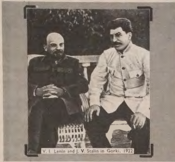
V. I. Lenin and J. V. Stalin in Gorki, 1922