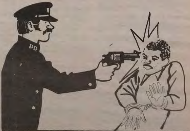
Killer cops are the tools of the capitalist ruling class. But they want to divert the people's struggle away from the real target