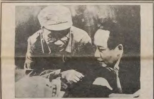
Mao Tse-tung & Chu Teh in Yanan period. "Chairman Mao pointed out: A Communist Party built on Marxist-Leninist revolutionary theory and in the Marxist-Leninist revolutionary style; an army under the leadership of such a Party; a united front of all revolutionary classes and all revolutionary groups under the leadership of such a Party—these are the three main weapons with which we can seize political power and consolidate it. It is precisely along this course that the Chinese revolution has advanced."