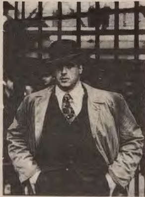
Sylvester Stallone plays Jimmy Hoffa in FIST

HARLAN COUNTY: Directed by Barbara Kopple BLUE COLLAR: Written and directed by Paul Schrader; starring Yaphet Kotto, Richard Pryor, and Harvey Keitel F.I.S.T.: Written by Joe Esterhas and Sylvester Stallone, starring Sylvester Stallone