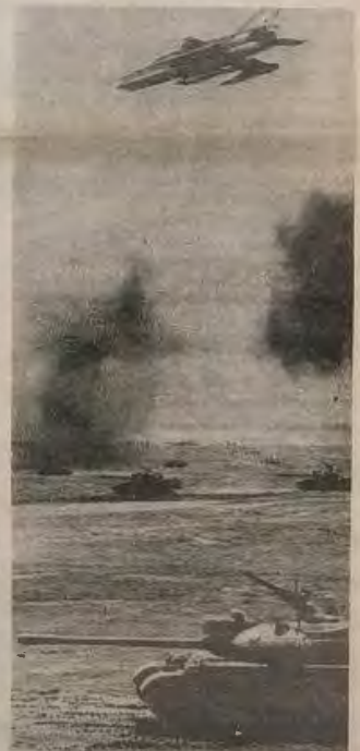
The superpowers are preparing for another world war, the people must make preparations & upset their timetable for launching the war.

All this talk about peace, but all we see actually happening is war preparation. These weapons are not made so they can talk about peace, let's be realistic. They are actively preparing for another world war. Hitler's Nazi government used the