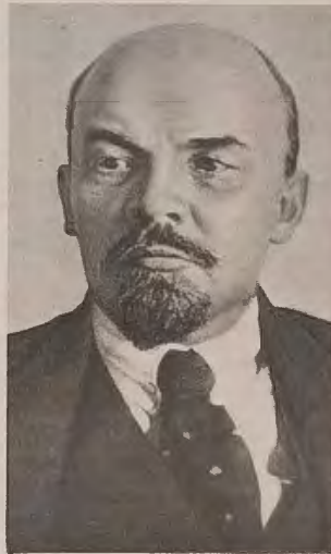
V.I. Lenin, founder of the Russian Communist Party (B), and leader of the October Revolution in 1917

People always were and always will be the foolish victims of deceit and self-deceit in politics until they learn to discover the INTERESTS of some class or other behind all moral, religious, political and social phrases, declarations and promises. The supporters of reforms and improvements will always be fooled by the defenders of the old order until they realize that every old institution, however barbarous and rotten it may appear to be, is maintained