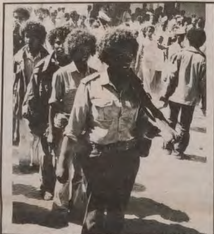
Eritrean forces are fighting heroically vs both Superpowers for their national liberation. Victory is Certain!

Though U.S. imperialism which represents