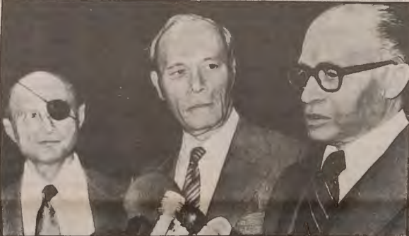
Israeli Zionism has exposed itself once again to the world as a bloodthirsty and expansionist watchdog of imperialism in the Middle East. Begin & Co. are the real terrorists.