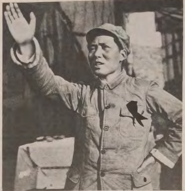
Mao Tsetung speaking in Yenan. "Comrade Mao Tsetung has attached great importance to building the Party ideologically since its early days." It was during the Yenan period that he wrote both "On Practice" and "On Contradiction". "In the early 40s, when the War of Resistance Against Japan was in the stage of stalemate, the Central Committee of the Party grasped the excellent opportunity to launch the rectification movement throughout the Party in order to raise its Marxist-Leninist level. Chairman Mao published a series of works on the rectification movement such as 'Reform Our Study,' 'Rectify the Party's Style of Work,' 'Oppose Stereotyped Party Writing' and 'Talks at the Yenan Forum on Literature and Art'..."