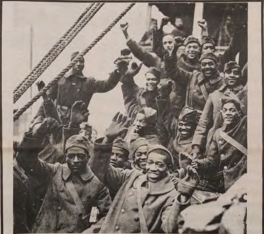
The emergence of the black sector of the working class after WWI as an increasingly independent force was signalled by their