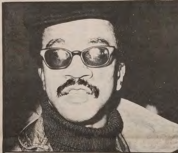
In the 60's the black liberation struggle occupied center stage of US domestic turmoil,

By the early 60's, the Afro-American struggle occupied the center stage of U.S. domestic turmoil. It had both a non-violent, bourgeois integrationist led aspect (King & Co.) as well as an anti-imperialist, revolutionary nationalist aspect which arose with and was articulated for by an internationalist black working class leader, Malcolm X. His rise to leadership and his consistently revolutionary nationalist and developing anti-imperialist positions not only overshadowed M.L. King and the non-violent scope of the "Civil Rights Movement", which was being supported and pushed