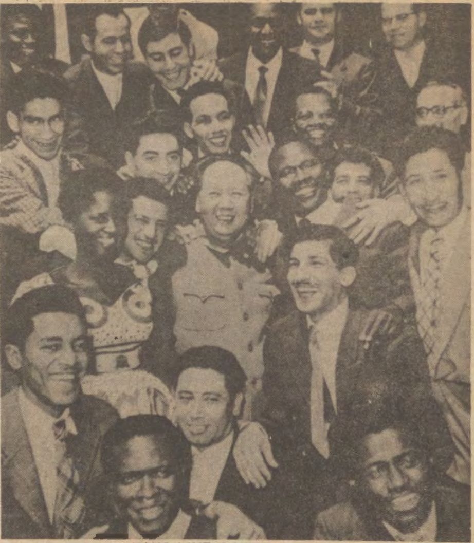
LONG LIVE CHAIRMAN MAO

some suggestions to increase distribution in your area. Also, we have been harassed by the U.S. Post Office - not receive ing mail, delays, mail never received from us to other people, etc. Please let us know when this happens to you. If you are a subscriber or distributor, please notify us immediately if your address changes because this will cause a delay in your receiving Unity & Struggle or you not receiving it at all. We do not discontinue sending papers without notification - no heware if you don't receive your paper.