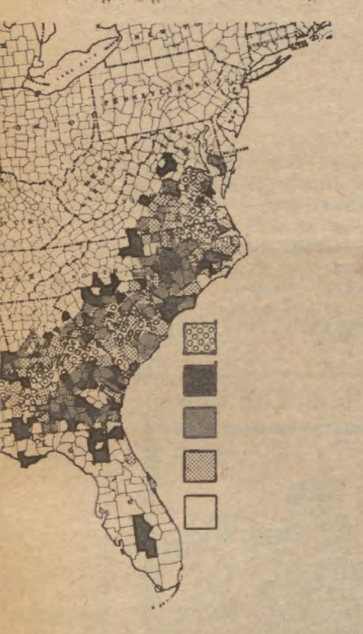
an oppressed nation, whose land base, and at the same time, as an oppressed te in which they are found.

milationist line crept back in until it was formalized in 1954 with the abandonment of the right to self determination of the Afro American Nation in the black belt south. This also explains why it was so easy for the CPUSA in the 50's to unite with the assimilationist wing of the black bourgeoisie and push the NAACP, etc, as "the true leaders of the negro li-beration movement". The revisionist statement which summed up this "new position of the CPUSA on the BNQ says, in part, "With respect to long range trends, the most important is the movement of the Negro people towards full equality on the basis of integration into all aspects of American life. This is sustained by material, objective factors, which are expressed primarily in the greatly expanded base for Negro-White working class solidarity and in the integrationist programs put forth by the Negro freedom movement itself. (Memorandum submitted to National Committee of CPUSA, 1954, by James S. Allen). This is the height of peaceful transition and gradualist thinking. It is pure bourgeois accommodationist thought. This is the same kind of thinking that characterizes some incorrect tendencies in the Marxist movement today, such as the October League which has the Black Liberation Movement as a struggle for integration' and erroneously supports the bourgeois integrationist position on busing, con-fusing bourgeois "forced busing"