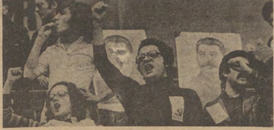
World imperialism will not recover! Inside the U.S. a staggering "official" unempioyment rate of 8 million leaves more and more people jobiess, foodless and homeless. Revolutionary struggle and socialist revolution are our only salvation, all talk of "recovery" is bogus!