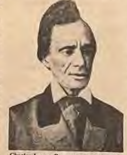
Charles Lenox Remond was a delegate the London Anti-Slavery Conference.

"Many of those who advocate eman cipation as a military necessity scent puzzled to know what is best to be done with the slave, if he is set at liberty Colonization in Africa, Hayri, Florida and South America are favorile theories with many well-informed persons. This is really interesting? No wonder Europe does not sympathize with you. You are the only people, claiming to be civilized, who take away the rights of those whose color differs from your own. If you find that you cannot rob the Negro of his labor and of himself, you will banish him! What a sublime idea! You are cer-tainly a great people! What is ylur plea? Why, that the slaveholders will not permit us to live among them as freemen. and that the air of Northern Latitudes is not good for us! Let me tell you my friends, the slaveholders are not the men we dread! (Hear, hear.) They do not desire to have us removed. The Northern pro-slavery men have done the free people of color ten-fold more injury