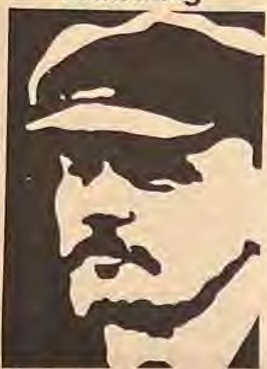
(Continued from page 7)

ticipation of the advance). Second it upholds the existence of Communists working within the working class movement, necessarily putting forth communist lines on all issues, as the next form of propaganda.