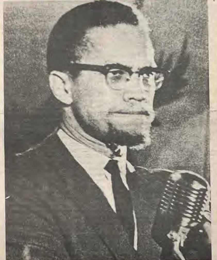
Long Live Malcolm X, study his life and his words on May 19th and remember that Malcolm X knew our struggle is an international struggle and he sounded the struggle of the 3rd World vs. imperialism. Oppose both superpowers on ALD!

It was at the 2nd Congress of the 2nd International in 1889 that May 1st was designated as International Workers (Continued on page 12)