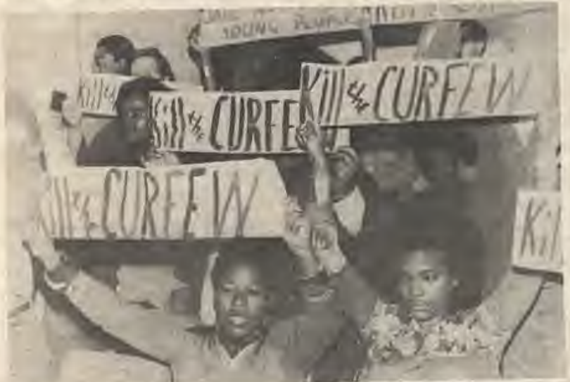
Across the USA people, like the ones shown here in Baltimore, Md, have been drawn into the struggle against monopoly capitalism, as the crisis in imperialism deepens, and the state steps up the police rule and brutal repression.