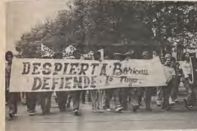
Countries want independence, nations want liberation, people want revolution!

This is our basis, for recommending withdrawal from the National Board and any other affiliation that we have with the PRSC.