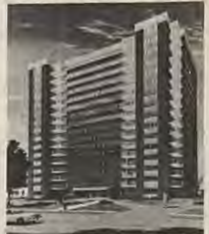
The latest scheme proposed by the New Jersey Housing Finance Agency is totally unacceptable to the people. And in no way can we bow to the racism and vicious attack on the people that master-minded this bogus plan, that they want us to rubberstamp.

We cannot accept the political straight-jacket put on this plan, that