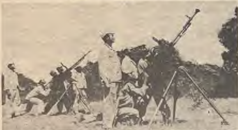
The dangerous Soviet Social Imperialism, having scored temporarily in Angola now has its nose wide open for further bites out of succulent Afrika, all the time with its slick cover story of "socialism." Zimbabwe seems the next place for it to peddle its poisonous wares. But though the principle contradiction in Zimbabwe is between the people and the colonialism of the racist Smith regime, the struggle is also a struggle against imperialism, and hegemonism. (Story on page 2)

ONE OF FOUR FUNDAMENTAL CONTRADICTIONS IN THE WORLD TODAY, OF CAPITALISM TURNED INTO IMPERIALISM, WHICH IMPERIALISM CARRIES TO "THEIR LAST BOUNDS, TO THE EXTREME LIMIT, BEYOND WHICH REVOLUTION BEGINS."