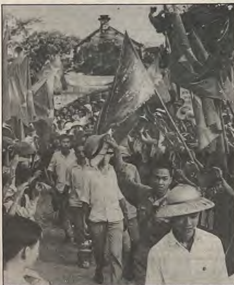
Members of the PRG and the general population celebrate the defeat of U.S. imperialism in Vietnam. Recently it was announced that Vietnam is again one country - reunified and Hanoi will be the capital for all of Vietnam.