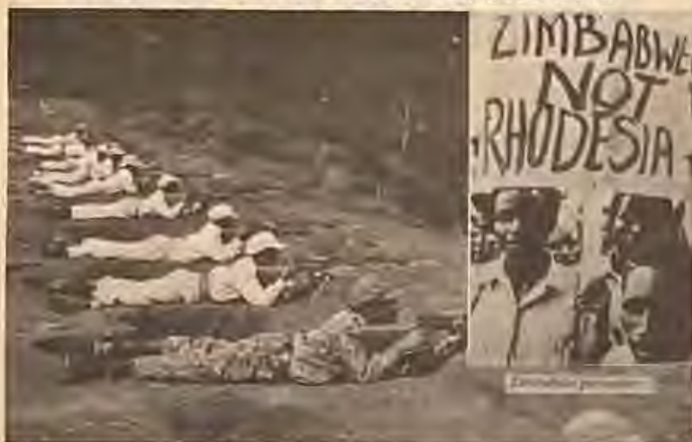
The police slayings reveal the weakness and desperation of the Smith regime. Fresh out of deceptive tricks, Smith has only armed suppression to fall back on; his days are numbered. Detente will fail as it has already (killing 13 is hardly detente) no matter what imperialists or their lackies might contend.

On June 2, 1975, 2,000 people gathered in front of a meeting hall in Highfield African Township, Zimbabwe (Rhodesia), where the Executive Committee of the African National Council working out a response to an Ian Smith ultimatum, debate intensified as to the real path for the liberation of Zimbabwe versus peaceful transition to neo-colonialism (advocated by Bishop Muzorewa and his ANC, ZAPU, and Frolizi). Inside the hall, functionaries of ZAPU, Frolizi and ANC pounced on a ZANU comrade. (The Zimbabwe African National Union is the liberation organization waging armed struggle against the racist, white-settler, minority government of Ian Smith, has demanded immediate majority rule for the people of Zimbabwe, and refuses to compromise. The Zimbabwe African People's Union is an organization financed by Russian social imperialism, has no fighting capability, and has agreed to peaceful negotiations with the Smith regime and African majority rule in 5 to 10).