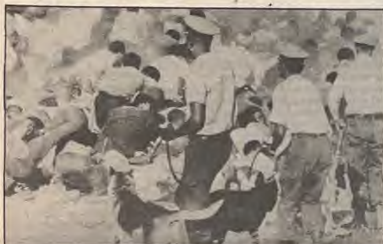
Scores of Afrikans were killed June 2 by "Rhodesian" police who opened fire into crowds outside a meeting of the ANC - the would be coalition pushing detente in Zimbabwe--after ANC and ZAPU tried to prevent supporters of ZANU from entering the ZANU meeting. The revolutionary liberation movement, makes it clear that only armed struggle will liberate Zimbabwe and the rest of Southern Afrika. (ANC has close ties with U.S. Imperialism and ZAPU with Soviet social imperialism. Superpower domination plagues the world's peoples).