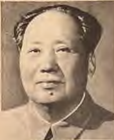
Mao Tse Tung

Chairman, Central Committee, People's Republic of China.