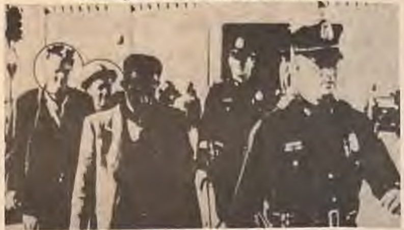
E. Howard Hunt! Watergate Trial 1973