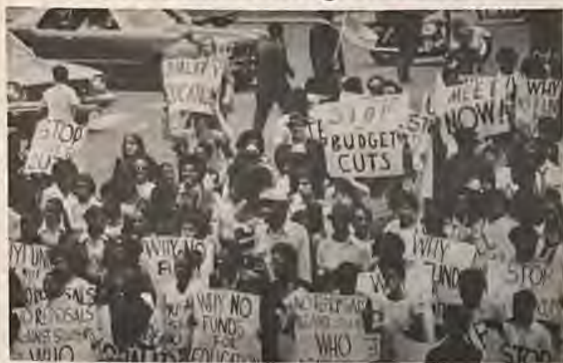
Mass demonstrations took place in Newark with students, parents, teachers and other Board of Education and municipal workers protesting the drastic budget cuts that are causing thousands of layoffs and cutback of art, home economics, music, library service and industrial arts from the schools. People are shouting: FIRE THE CAPITALISTS!

Newark school children are again the victims of the crisis in U.S. imperialism. That is since the U.S. has been put out of Cambodia and Vietnam and soon all of Southeast Asia, the super profits that were gained from super exploiting the peoples of these 3rd world countries is now lost. So the capitalist will super exploit the Black, Puerto Rican, Chicano, Asian and poor White workers. Newark which is more than 75% Black and Puerto Rican is a model of the places that will be dealt with the most severely.