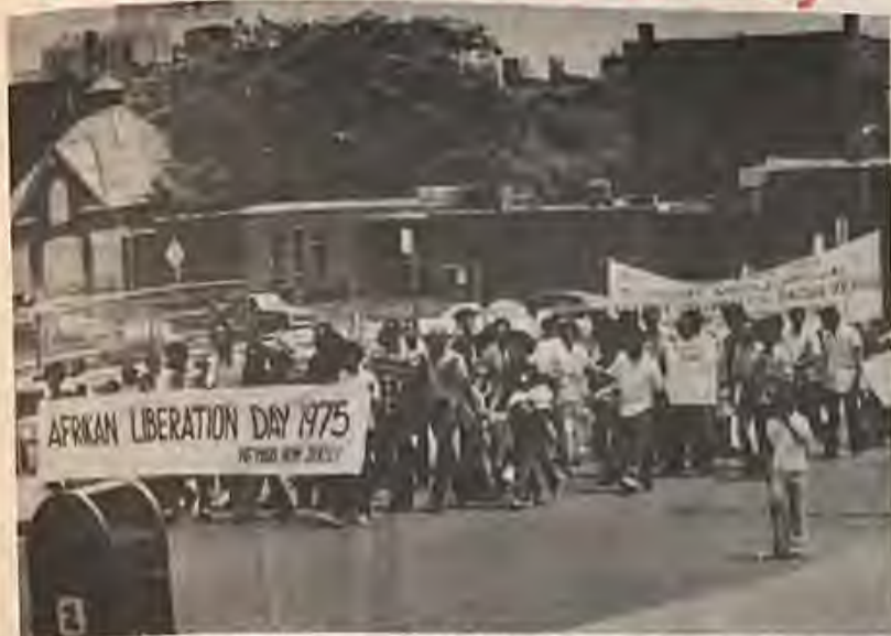
Saw a militant demonstration in support of the liberation struggle in Southern Afrika against Imperialism and also to link it with the struggle here in the U.S. against racism and capitalism.

The Afrikan Liberation Day march in Newark was revolutionary, and advanced the struggle against imperialism. Strong speakers from (1) Eritreans for Liberation in North America (ELFNA); (2) Pan-Afrikan Congress of Azania (PAC); (3) Puerto Rican Socialist Party (PSP); (4) February First Movement (FFM); (5) Black Panther Party (BPP); (6) Congress of Afrikan People (CAP) supported the Southern Afrikan Liberation struggles, armed struggle in liberating Southern Afrika and exposed "detente" as collaboration with the South Afrikan butchers (Smith and Vorster). The colonialists are talking about detente because they are losing. Neo-colonialism was sited as the chief enemy of the people because it is the rule of imperialism thru native agents.