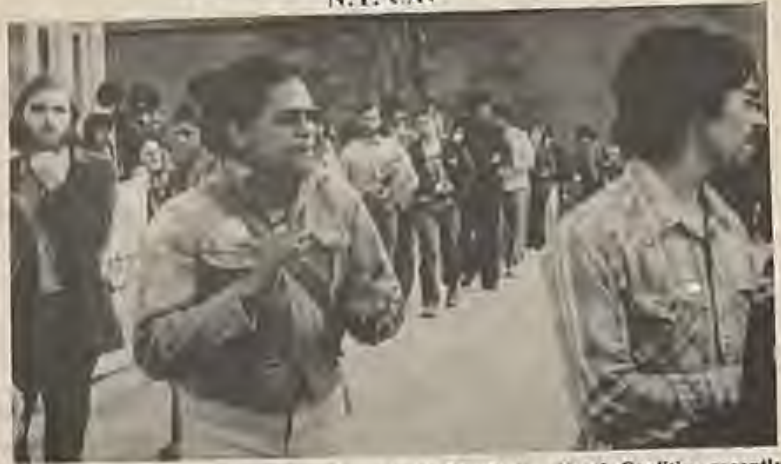
Workers and students aligned together into the Manhattan North Coalition recently and held mass demonstrations and fought racist goon squads hired by the building contractor at the site of a new City College dormitory in New York City. The main issue that led up to the confrontations and fighting was the lack of minority workers on this job site in the heart of the Harlem community despite affirmative action hiring agreements made earlier for minority workers.

The economic crisis has effected all segments of society, from the super rich billionaires like Rockefeller, Hughes, Mellon, Kennedy etc. to the suffering masses whose work and exploitation keep the bloodsuckers never quite satisfied. While the ruling class gets richer, we suffer cutbacks in social services, hospital care, jobs, welfare and education. City College of New York is no exception. Greeting the returning students from a summer vacation was the stark reality of SEEK (Search for Elevation, Education & Knowledge) Funds cutbacks, the threat of losing free tuition, cutback in Ethnic Studies & particularly layoff of those teachers who showed the relationship between oppressed nationalities and this exploitive capitalist system - the increasing of the student teacher ration, and cuts in financial aide. The students took up the struggle almost immediately by forming coalition organizations such as Committee for SEEK and Financial Aide and Ad Hoc Committee Against the Budget Cuts which united many students around common issues who were formerly divided.