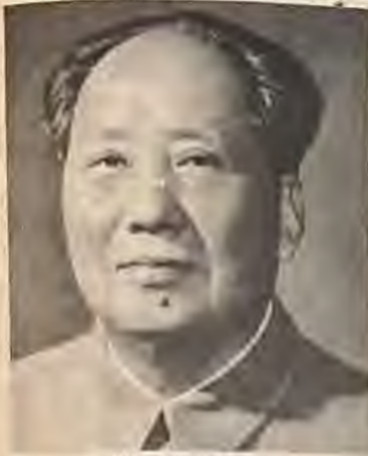
Mao Tse Tung

Chairman, Central Committee, People's Republic of China, part 3