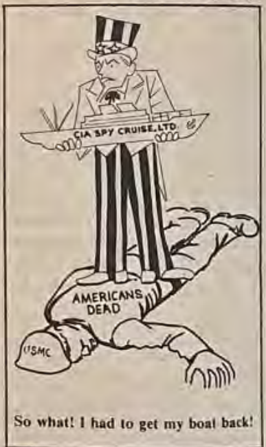
So what! I had to get my boat back!