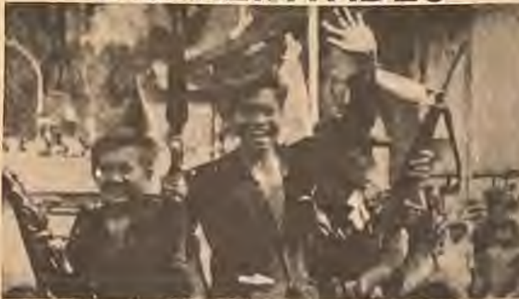
"Khmer Rouge" liberation forces wave to Cambodian masses welcoming their entry into Phnom Penh after liberating it from U.S. neo colonial puppet regime on Lon Nol.