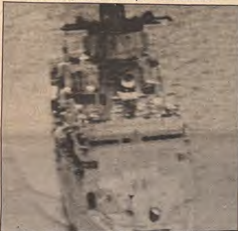
Cambodia - The act of piracy in the China Sea, complete with massive invasions, bombed oil fields, CIA set up ships that just happen to be accidently 8 miles off the Cambodian Islands, should open peoples eyes still further to the absolute, impotence and bankruptcy of imperialism. (Furthermore the U.S. casualty count is much higher than yet released!)

CIA "Freighter" Is Set Up For Provocation