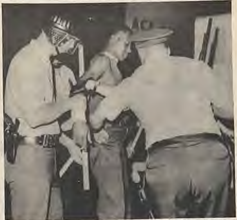
We must show that these attacks upon our community are not limited merely to us, but to oppressed people around the world. That the same statistical incidence of oppression and high crime rate can be cited in any community oppressed by the system of profit for a few and poverty for the many anywhere in the world.

Discussions of crime during this meeting are positive only to the extent that we are able to identify key programs and issues with which to mobilize the masses of our people especially those issues that already concern them, but we must provide a method for them understanding these issues more clearly and directly, and also seeing these issues linked to the overall struggle. That is, when we move around prison abuse and organizing, or police brutality, or lack of justice in the courts, or around issues relating to the rise of crime in the minority communities, we must invariably link these struggles directly to the struggle the masses must wage against the oppressive system of capitalism. Also we must show that these attacks upon our community are not limited merely to us, but to oppressed people around the world. That the same statistical incidence of op-