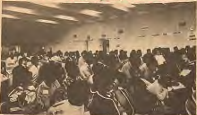
On May 3 Black women from across the country met in Detroit for the first National Assembly meeting of the Black Womens United Front, an anti racist, anti capitalist, anti imperialist united front to struggle against all forms of oppression and exploitation and especially take up the struggle against the triple oppression Black women face; race, sex and class, as part of the Black liberation movement, and the struggle for socialism.