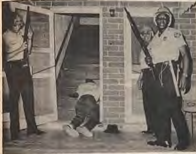
The crisis continues and always worsens and as it worsens, repression & police brutality will increase. All over this country killer cops shoot down black youth and the youth of other oppressed nationalities.

spread inflation and unemployment. And as this shaky condition of the economic system continues to exist, the resulting unemployment and high prices must cause blacks and other oppressed people to come under heavier and heavier oppression and despair, and for the crime rate to continue to go up, and the government forced to go further and further to the right in order to deal with a nationwide disaffection of the masses with a system that will no longer be able to hide its exploitative character. Hence the need not only for campaigns like Stop Killer Cops, but also the creation of an antifascist united front to broaden the area of struggle and increase the struggle forces around the issue of opposing the Democrat and Republican shift even further to the right not only by the resignation of Kennedy but these bourgeois parties need to support the attempted reconsolidation of the U.S. economy which might mean anything