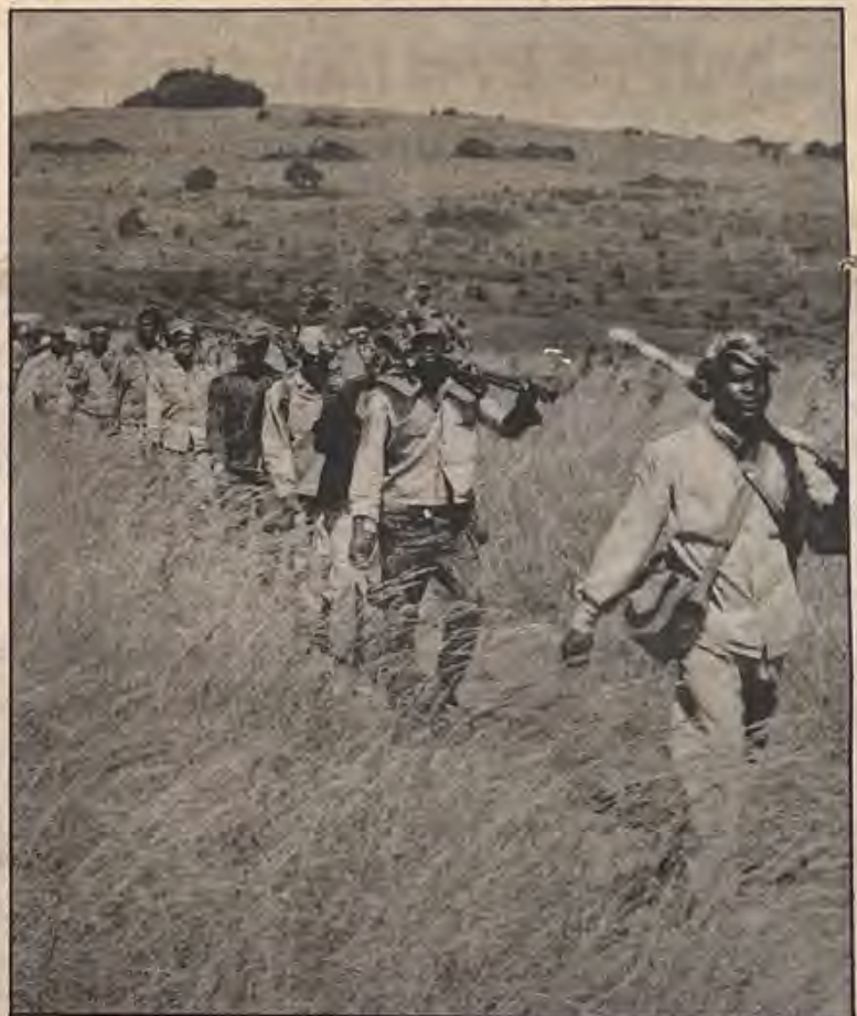
Zimbabwe liberation fighters on patrol against attacks by racist white minority regime of Ian Smith in Zimbabwe (Rhodesia). Armed struggle is the only way Zimbabwe and the rest of Southern Afrika will be liberated. Collaboration and sell out stance of some Afrikan "leaders" will be exposed as being opposed to the people and in direct support of colonialism, neo colonialism, exploitation and racial oppression of Afrikans in Azania (South Afrika), Namibia, and Zimbabwe.

Congress to take up arms. The ANC, is the only "liberation movement" in Southern Afrika that is pushing collaboration with apartheid, and illegal regimes. It seems unrealistic to suggest they take up arms when they are the exponents of "sit down right now & lets talk." The Dar Resolution simultaneous to the contradictory phrases in its pages, refutes, and puts down the countries