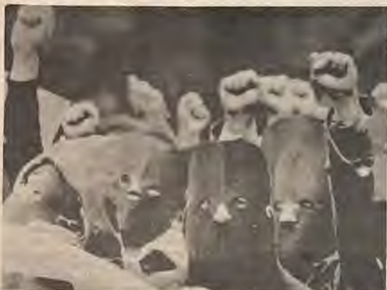
Recently mass demonstrations have been held where the Shah of Iran has showed up to visit various heads of state. In May, the Shah visited the U.S. after murdering 9 political prisoners in Iran (part of an anti "terrorist, marxist and communist" repression). Pictured above in Rome, Iranian students held a mass demonstration against the Shah's murders, fascism, exploitation and Iran's official puppet status with U.S. and world imperialism. Black masks were worn to avoid identification by the SAVAK - the Iranian secret police.