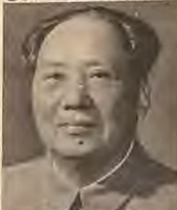
Mao Tse Tung Chairman, Central Committee, People's Republic of China Part 4

Marx, in the era of laissez-faire capitalism, could not concretely know certain laws peculiar to the era of imperialism beforehand, because imperialism, the last stage of capitalism, had not yet emerged and the relevant practice was lacking; only Lenin and Stalin could undertake this task. Leaving aside their genius, the reason why Marx, Engels, Lenin and Stalin could work out their theories was mainly that they personally took part in the practice of the class struggle and the scientific experimentation of their time; lacking this condition, no genius could have succeeded. The saying, "without stepping outside his gate the scholar knows all the wide world's affairs", was mere empty talk in past times when technology was undeveloped. Even though this saying can be valid in the present age of developed technology, the people with real personal knowledge are those engaged in practice the wide world over. And it is only when these people have come to "know" through their practice and when their knowledge has reached him through writing and technical media that the "scholar" can indirectly "know all the wide world's affairs". If you want to know a certain thing or a certain class of things directly, you must personally participate in the practical struggle to change reality, to change that thing or class of things, for only thus can you come into contact with them as phenomena; only through