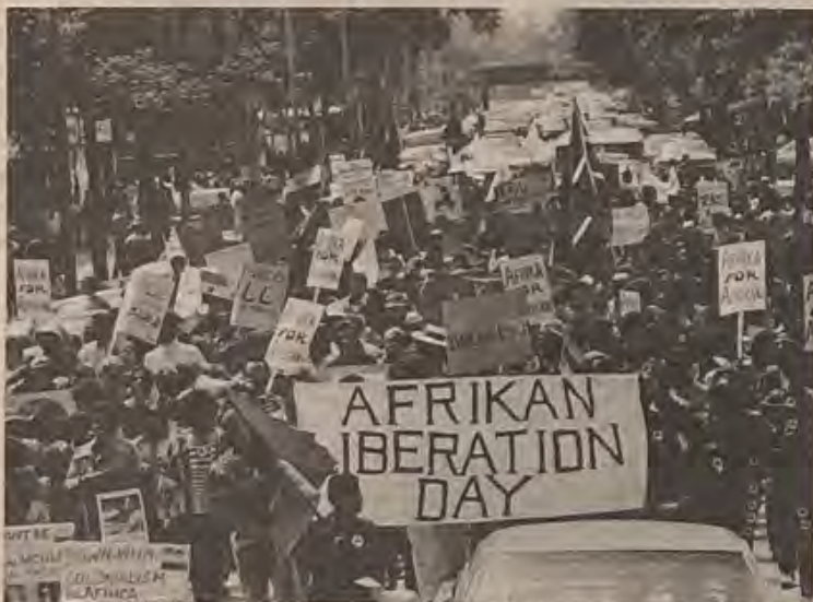
This year's ALD demonstrations will be held in ALSC local cities on May 24th, emphasis will be on the liberation struggle in Southern Afrika and its relationship to the Black liberation struggle in the U.S. and the crisis Black people face here. Solidarity with the Viet Nam and Cambodian victories and the struggle against U.S. backed Zionist imperialism in the Middle East will also be part of the ALD themes, focusing on the general crisis of imperialism internationally!

The Afrikan Liberation Support Committee is an anti-racist, anti-imperialist Black united front, which grew out of the Black Liberation Movement; the struggle of Black people in the United States for self-determination over their lives, for