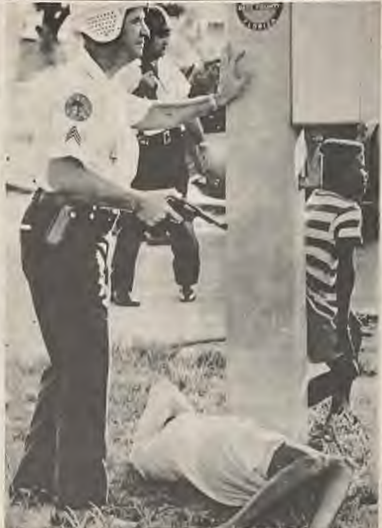
Prison and Police abuse are part of the creation of national communities of victims to maintain and increase the profits of super millionaires and whether we are struggling to stop killer cops or otherwise struggle against police brutality what finally needs to be exposed is the State, e.g. the fact that the government and its hit squad of cops represent the interests of a very narrow segment of the population, i.e. billionaire capitalists.

many people can be educated to the essential function of the police as a mercenary force for the ruling class, and not as representatives of the whole society. The Newark situation was another testimony to the fact that skin color in and of itself is not revolutionary, since in the face of Puerto Rican reaction to police brutalizing a cuchifrito vendor, and a police horse kicking a little girl in the head, black Mayor Kenneth Gibson's answer was to issue a directive banning all street demonstrations, in fact to ban people coming together in groups of more than three! Of course this early warning fascism in black face was defied by the masses both Puerto Rican, black and even some whites who went ahead and held rallies and demonstrations anyway. But how much easier for the government to move to fascism behind black faces supported by middle class negro intellectuals who will theorize for us that somehow it is a positive thing to be exploited by blacks, or that a Mobutu the murderer of Lumumba is