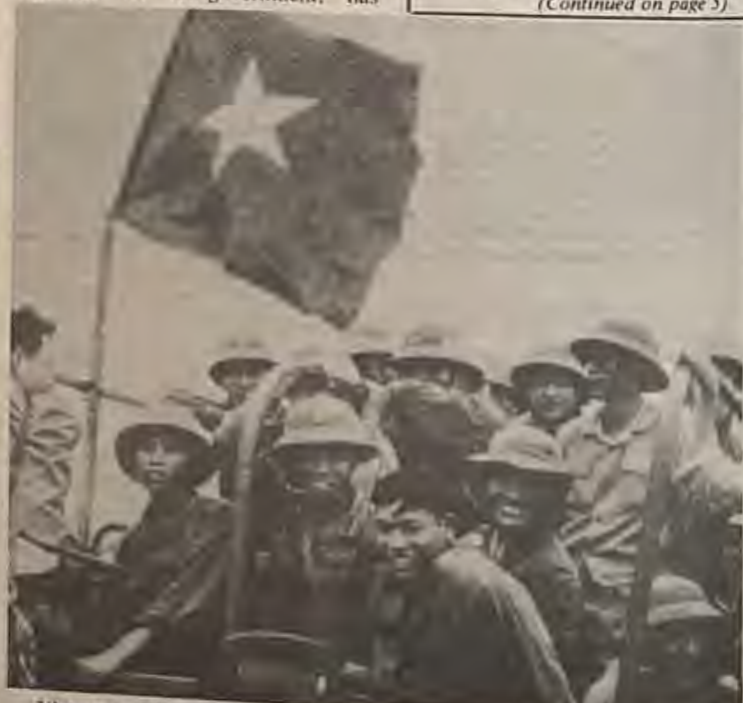
Victorious Vietnamese liberation fighters entering Ho Chi Minh City (Saigon) after the surrender of the puppet South Vietnamese government. Nguyen Van Thieu, left behind.