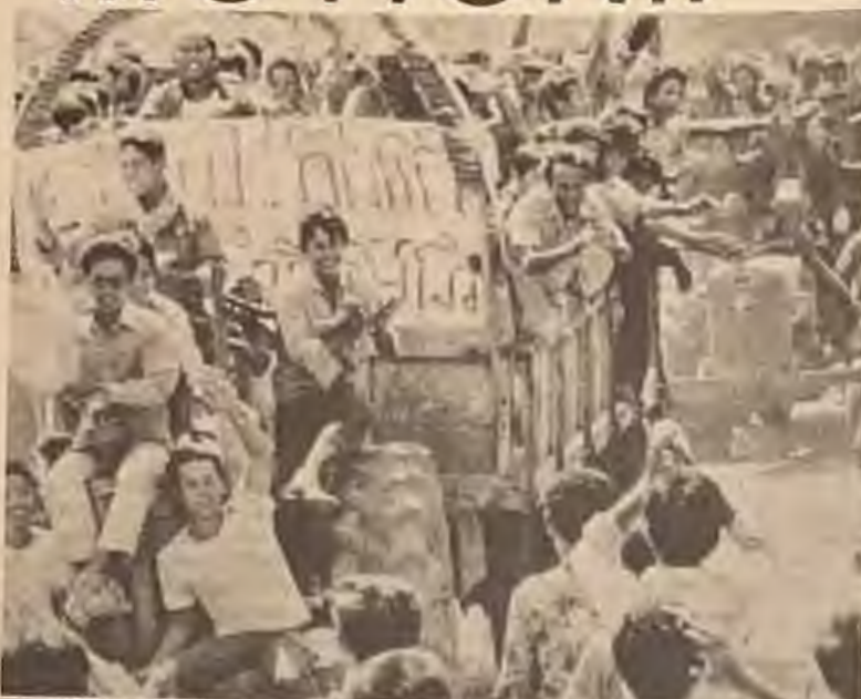
Cambodian people give revolutionary greetings to "Khmer Rouge" armed forces after the smashing of the Lon Nol fascist puppet government. Another tragedy for U.S. imperialism and its lackies! Look out for imperialism to resist even more viciously in South Afrika and the Middle East where it will certainly be buried!