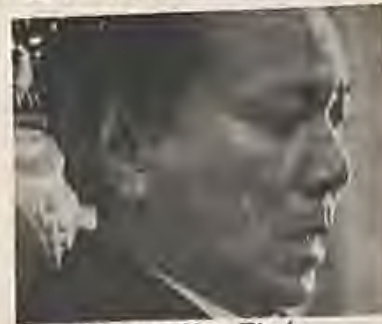
Nguyen Van Thieu

Where are these two butchers and lackies of U.S. imperialism hiding out these days? Lon Nol former U.S. puppet head of Cambodia is the guest of the U.S. at a reported $100,000 home in Honolulu. He is also waiting for a check from his Irving Trust Company of New York $1 million bank account to help pay his bills.