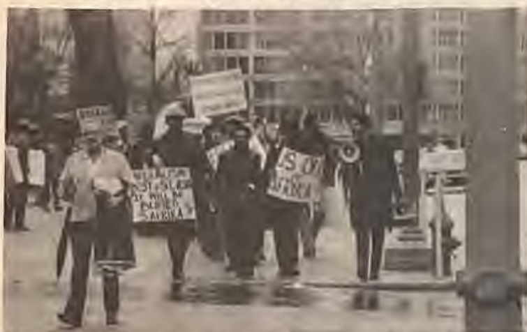
Militant comrades from the CAP including its Chairman, Amiri Baraka, leading the demonstration in support of ZANU in front of the White House, demanding the release of ZANU leadership arrested by Pres. Kaunda in Lusaka last month and also they demonstrated in support of armed struggle to free Zimbabwe from U.S. and British backed imperialism in Southern Afrika. (Zimbabwe, Namibia, South Afrika)