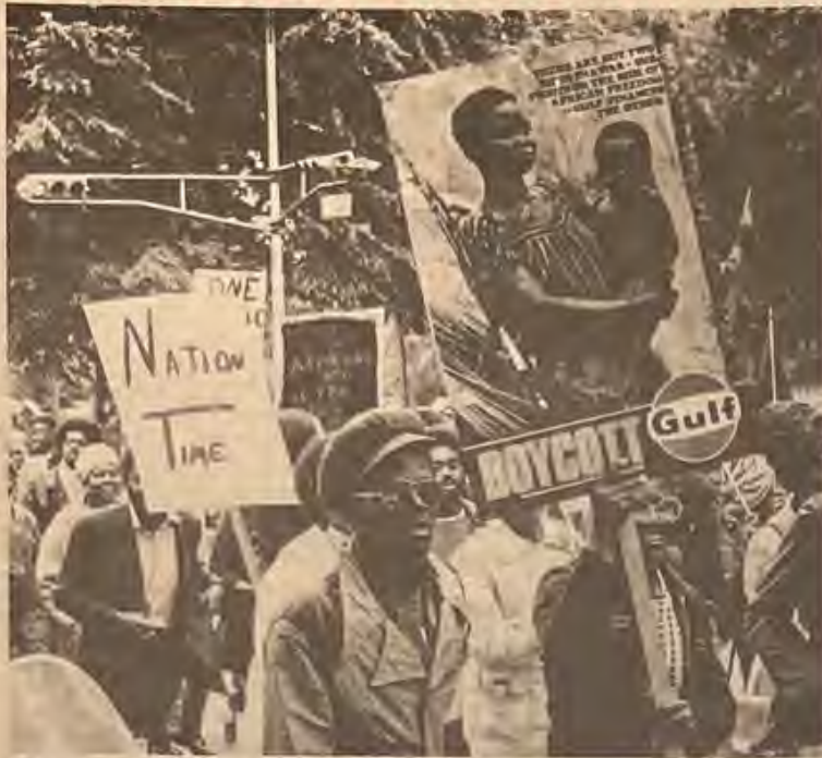
Liberation of the Black Nation here in the U.S., liberation of Southern Afrika and our special economic, political and cultural relationship to Afrika and the struggle for socialism must be stressed at ALD this year.

ALD 75 should see massive militant demonstrations throughout the U.S., the West Indies and Afrika in support of armed struggle to free Southern Afrika, opposition to sell out detente attempts and exposure of the collaboration of Afrikan leaders with imperialism's attempt to set up neo colonial puppet regimes like the ones just smashed in Viet Nam and Cambodia.