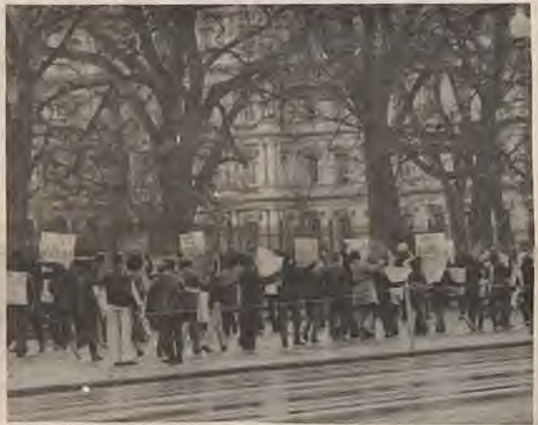
April 19th, in Wash. D.C. hundreds of demonstrators protested in front of the White House during the time President Kenneth Kaunda of Zambia was meeting with Ford and Kissinger presumably about the contribution of U.S. imperialism to bankrupt detente attempts in S. Afrika and the collaboration of certain Afrikan leaders advocating that ZANU and Zimbabwe people seek "peaceful" road to their liberation which will never happen! Kaunda has even gone as far as locking up the military and political leadership of ZANU to try to force them into a sell out detente position.