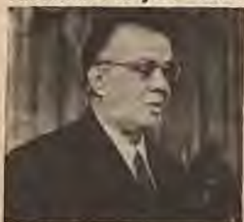
Enver Hoxha, First Secretary of the Central Committee of the Albanian Party of Labor. The PLA has consistently taken a correct line against the superpowers and Soviet social imperialism.