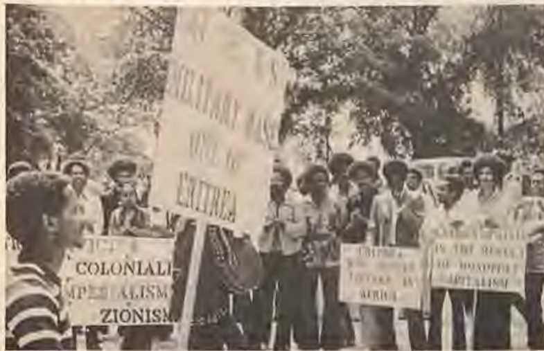
Eritrean students demonstration in Washington, D.C. at ALD 1974.