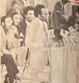
Black Elected Officials talked about giving the democratic party "one last chance" at the 1972 Gary Convention. They used the names of DuBois & Paul Robeson to inspire the masses with visions of Independent Black Political Movement. But 1976 will see them wedded again to the party of racists & capitalists.