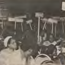
NBA delegates from all over the country took part in heated 2 line struggle at the February meeting of the Assembly between bourgeois nationalism (the Black part of the capitalist-racist team) and revolutionary nationalism which seeks to build an independent Black Liberation Movement that can make alliances with all progressive peoples.

nation in the united States. Within that front there are a great many different views, ideologies and tendencies, organizations all with the right to relative independence as autonomous entities, with autonomous ideologies, but also they each have some relative unity, within the front, and this is what allows us to be united around certain key issues which we agree upon. Certainly it is absurd to think that independent organizations have to take the same positions in their organizations as the front takes collectively. Otherwise that would mean that the democratic party would take the same stands as the