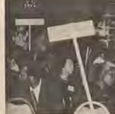
April 26 in Washington D.C. reactionaries representing the democratic party will attempt to force Secretary General of National Black Assembly Amiri Baraka out of this position to make certain Black Democrats can use the Assembly to lead Black people to Scoop Jackson in '76.

In the last year there have been these same two line struggles waged inside The African Liberation Support Committee, Congress of African People, which in both cases saw the resignations of quite a few people who could only accept a nationalist analysis of our struggle, but could not see the anti-imperialist, nor do they see the proletarian internationalist, revolutionary socialist, aspect of our struggle. More recently this struggle has seemed to emerge inside the Black Scholar magazine, as Nathan Hare resigned, unleashing a stream of ambiguous generalities about a "black marxist takeover" at Black Scholar, when actually he was talking about people he'd been working on in the magazine since for a number of years. And in all of these cases the reactionary position was quickly taken up by the "black" press most of whom have