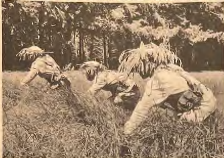
No negotiations or "peaceful transition" will bring liberation to the people of Zimbabwe only armed struggle, ZANU will avenge the murder of Herbert Chitepo by smashing Ian Smith's settler colony regime in Rhodesia.