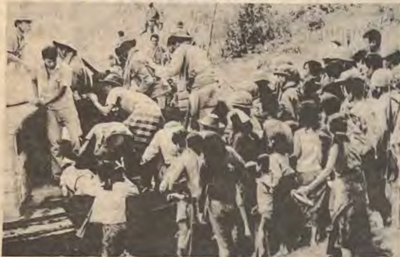
Cambodia—Puppet troops fleeing Liberation forces. Kissinger, Ford and company are trying frantically to give away a few more millions of the U.S. peoples tax money to keep fascist stooge Lon Nol, in power. But it won't work! U.S. imperialism around the world is doomed!

After 5 years of fierce armed struggle, the People's Armed Forces of National Liberation of Cambodia (P.A.F.N.L.C.) are about to recapture the capital city Phnom Penh from the lackies of U.S. imperialism and restore national independence to the Cambodian people. Lon Nol, will soon be punished by the Cambodian liberation forces for his wholesale sell out to U.S.