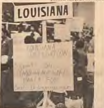
Louisiana Delegation sign still needs implementing. Black Democrats & Republicans will never do it! '76 is key year to build popular front to oppose not only both factions of the bourgeois party but the entire intermediate lack sector, i.e., labor union without leadership & fake communist, i.e. revisionists.