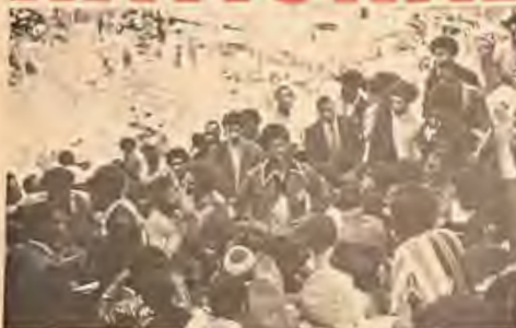
The Oppressed Black Nation came together in 1972 to demand "Unity without Uniformity", i.e., a broad popular front to fight against our National Oppression. Now black elected officials react in a pretense to be Nationalists opposing the united front concept with complete subservience to the Democratic Party.

(RBA from page 1) Politics is taking shape. Historically this always means a threat to the democratic rights of black people. What strategy will the NBA advance to lead black people out of this crisis? Will the NBA be bold enough to lead the black masses thru this political crisis on the struggle for power?