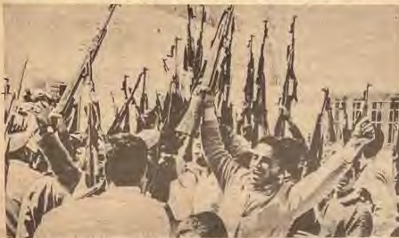
The world crisis of imperialism will cause the U.S. to make war somewhere very soon. The Middle East is a good bet, to try to control absolutely the oil, thereby controlling Europe and Japan, and also, to overcome the cyclical crisis of capitalism which causes depression. But the peoples of the Middle East, especially the Palestinians, will finally defeat U.S. imperialism again.

As the "peace negotiations" in the Middle East failed, it becomes increasingly evident to the world's people that the talk of "detente" by the U.S. imperialists and the Soviet social imperialists is utterly bankrupt. No amount of jet set negotiations by Henry "let's make a deal" Kissinger, no amount of Soviet attempts to bully the Arabs into "peace" by threatening their source of arms, no amount of imperialist tricks will stop the irresistible demand of the Palestinians for the liberation of their territory from Zionist occupation. All attempts to gloss over this central issue will never resolve the crisis in the Middle East. The Palestine Question, the burning question of the national liberation of Palestine, is the heart of the struggle in the Middle East, but the imperialists raise other issues to confuse the world