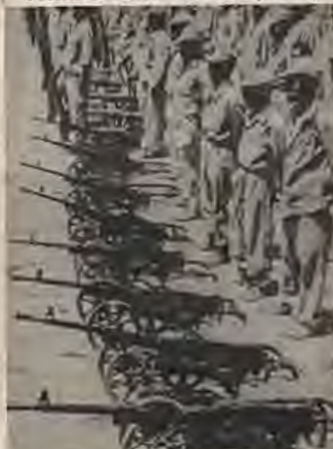
A U.S. attack on the people of Palestine will shatter U.S. imperialism and its lackies. They are both doomed.

people don't have money to buy the goods, causing huge inventory stagnation and resulting in industrial production declines and massive layoffs.