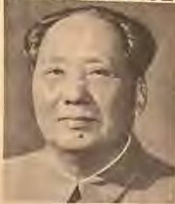
Mao Tse Tung

Chairman, Central Committee, People's Republic of China