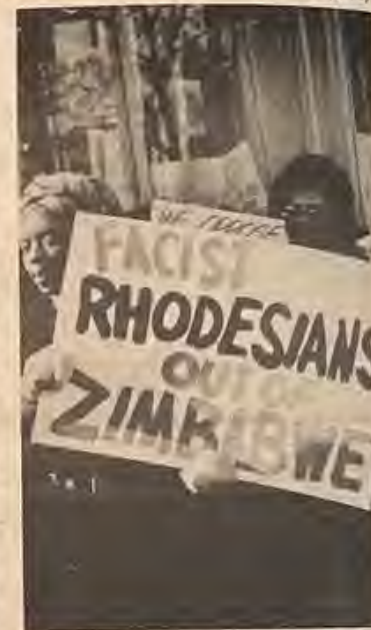
Revolutionaries around the world must support Zimbabwe Liberation Movement and call for an end to U.S. and British support for the illegal fascist colonialism of Rhodesian white supremacists.