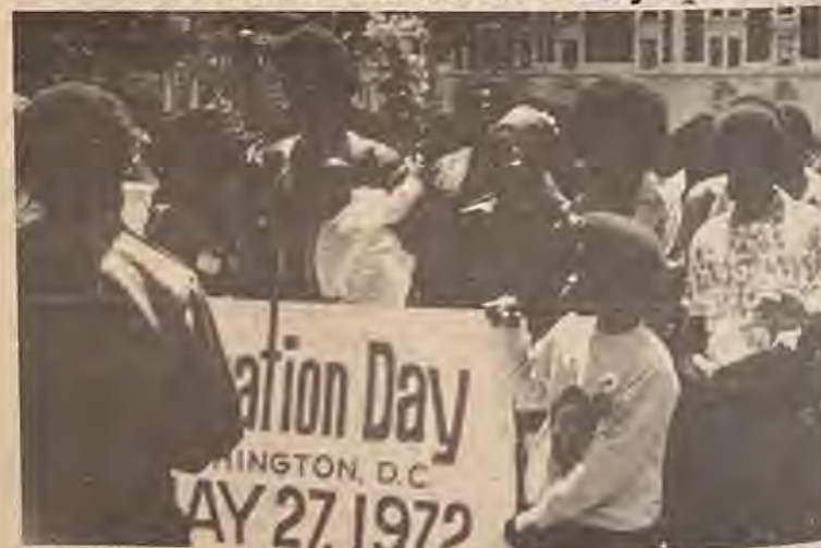
Afrikan Liberation Day 1975 will be held Saturday, May 24, 1975, all over the United States as local demonstrations. Since first demonstrations in 1972 Portuguese colonialism has been squashed!