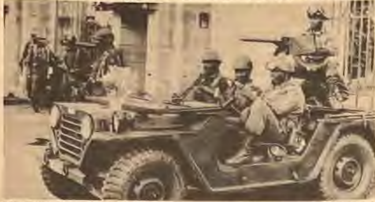
The military junta in Ethiopia is a petit bourgeois murder ring to build capitalism in Ethiopia and the rule of U.S. imperialism. They are no socialists!

Eritrea is a small country on the north east of Ethiopia. The Eritrean people are fighting an armed struggle against U.S. imperialism, the bourgeois military regime of Ethiopia and Israeli Zionism.