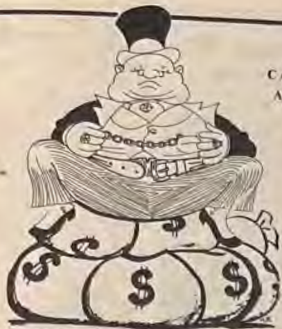
CAPITALIST AUSTERITY PROGRAM