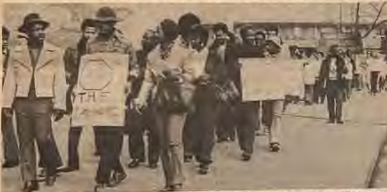
Dynamic Worker's Solidarity Day demonstration in Pittsburgh indicates effectiveness of National CAP anti-depression political education. CAP line for Worker's Solidarity Day was STOP THE LAYOFFS! FIRE THE CAPITALISTS! THE WORKERS CAN RUN IT!

February 22, 1975 marked demonstrations in 17 cities across the nation with people rallying to protest the severe hardships caused by the rotten capitalist system. The Congress of Afrikan People advanced the slogan "Stop The Layoffs! Fire The Capitalists! The Workers Can Run It!" which speaks to the enormous rate of layoffs that plague the working masses and capsulizes the essential truth about monopoly capitalism, that it must be smashed so the workers can liberate themselves from this seemingly endless cycle of pauperization at the hands of the capitalists. Pittsburgh was one of those cities that held a successful workers Solidarity Day demonstration and rally February 22. Over 200 demonstrators marched with signs and chanted outside the headquarters of the U.S. Steel Corporation. The march drew a lot of attention and the signs being carried spoke to the main slogans.