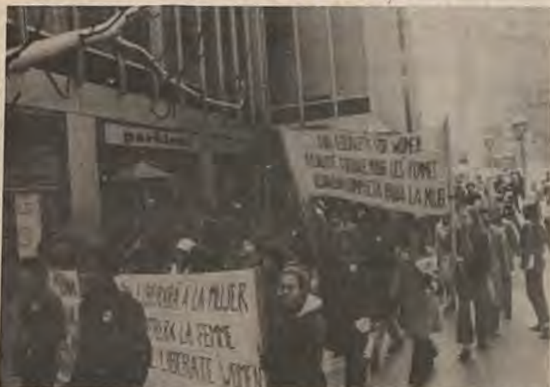
The Anti-Imperialist Coalition march to the U.N. on International Women's Day took clearly revolutionary position in contrast to the purely reformist line of the CP stacked Union Square march.

Women's struggles must be related directly to the exploitative system of imperialism and monopoly capitalism! To do less is to confuse the people and collaborate with our enemies!