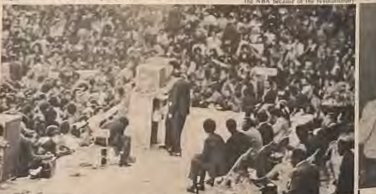
Bourgeois Nationalism (Talking Black but trying to get in the system) will expose itself more and more as the crisis of imperialism worsens. Many who called for independent political movement in 1972, were in McGovern's test pocket by the democratic convention. In 1976, they will be pushing Scoop Jackson or worse!