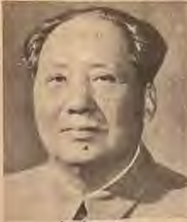
Mao Tse Tung