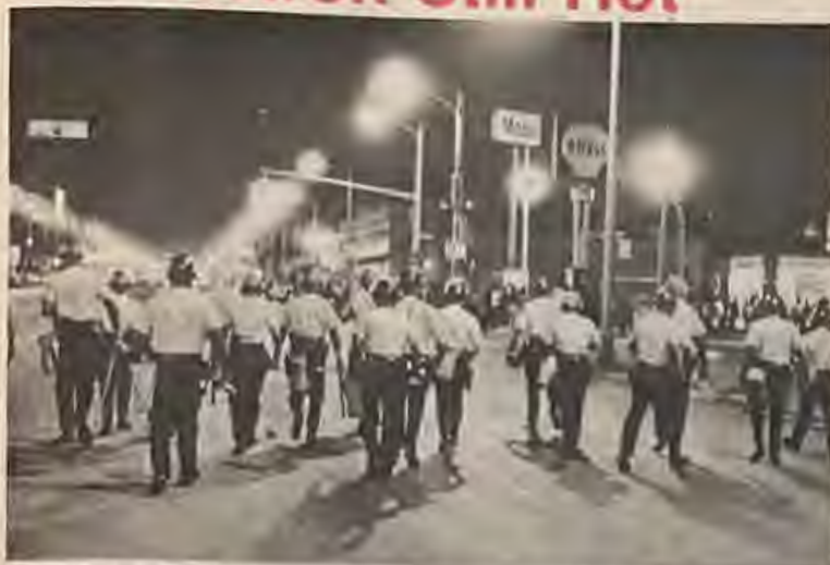
Despite the repression and brutality of the police and attempts to cool out the masses by shuffling lackies of the ruling class like Detroit Mayor Coleman Young, the masses are still hot over the murder of Obie Wynn and will continue to organize and struggle against racism and fascist repression until both along with the entire system of exploitation and oppression - capitalism - is smashed and replaced by socialism. The hit men for the ruling class, special bands of armed men, the police, are shown above rampaging through the Black community.