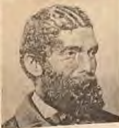
John S. Rock—Black physician & lawyer, a part of the "free" Black middle class in the North, who advocated Blacks acquiring the means of production & developing a black capitalist economic base. But the so-called "free" Blacks were also held outside & on the very bottom of the system of capitalism—by national oppression as well as economic exploitation. But such Black capitalist aspirations were one ideology sounded at the many meetings & Black conventions which took place during the period of 1830-1860.

"Article 5—The Committee on Business Relations, shall establish an office, in which they shall keep a registry of colored mechanics, artisans and business men throughout the Union. They shall keep a registry of all persons willing to employ colored men in business, to teach colored boys mechanical trades, liberal and scientific