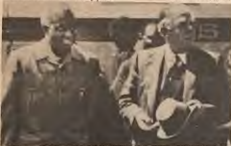
Pres. Kaunda of Zambia with Prime Minister Vorster of racist "South Afrika" strange bedfellows, especially since Kaunda claims he stands for Afrikan Liberation! The two were in Zimbabwe trying futilely to push for Afrikan "Detente," which is when Imperialism says "You niggers be cool while we exploit you". Detente put forth the illusion that liberation can be negotiated. But negotiations should be based on people's war which goes on negotiations or not. Armed struggle brings Liberation, all else brings Neo Colonialism.

alhenderson PHOTOGRAPHY (201) 373-0200 701 Clinton Avenue, Newark, New Jersey