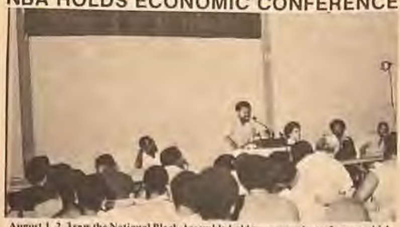
August 1, 2, 3 saw the National Black Assembly hold an economic conference which theme was "The Current Depression and the Survival of Black People": What is to be done? Hundreds of Black people from across the country held serious workshops and forum discussion on the causes and effect of the current depression in the Black community and what can be done to struggle against this mass poverty and exploitation which allows the rich to get richer and the poor to get poorer, but the only way to solve this problem is socialist revolution. The Political Education Workshop

ECONOMIC CRISIS: NBA HOLDS ECONOMIC CONFERENCE