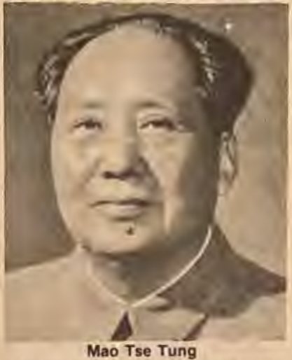
Chairman, Central Committee, People's Republic of China. Part 9 July 1937

It often happens, however, that thinking lags behind reality; this is because man's cognition is limited by numerous social conditions. We are opposed to die-hards in the revolutionary ranks whose thinking fails to advance with changing objective circumstances and has manifested itself historically as Right opportunism. These people fail to see that the struggle of opposites has already pushed the objective process forward while their knowledge has stopped at the old stage. This is characteristic of the thinking of all diehards. Their thinking is divorced from social practice, and they cannot march ahead to guide the chariot of society; they simply trail behind, grumbling that it goes too fast and trying to drag it back or turn it in the opposite direction.