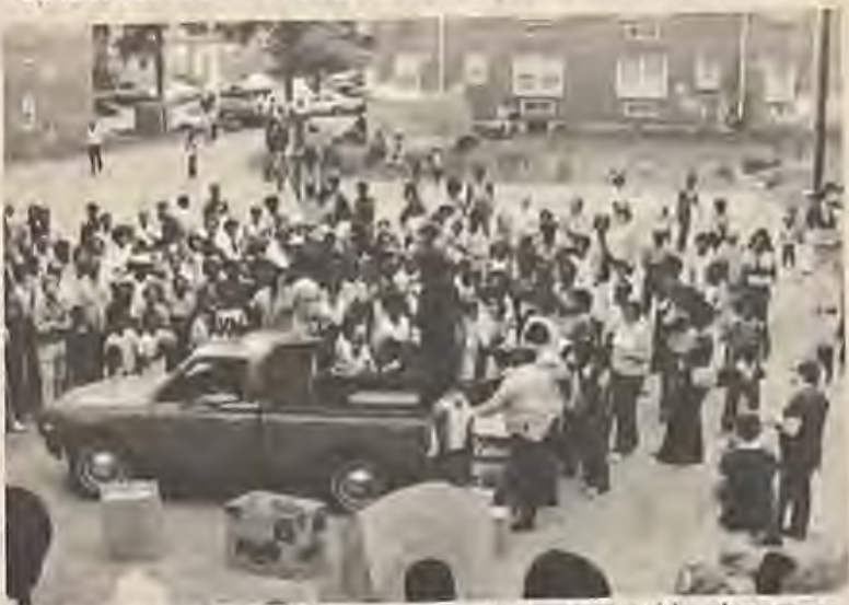
Black people in Baltimore, Md. are struggling like in all other cities where we are boxed into substandard housing against poor housing, high rents to profit hungry mostly absentee "landlords" and against day to day competition with rats, roaches, no heat, hot water and crumbling buildings which continue to make landlords rich off our misery and exploitation.

To live in the U.S. is to live in a society uncertain of its future. More and more people are exposed to the real nature of capitalist society and more people concretely realize their democratic rights are being stripped away. The tenants of Uplands Apartments in Baltimore, Uplands Apartments in Baltimore, Maryland have joined the ranks of the increasing number of the masses of people educated by bad experience in that a decent life in the U.S.A. under capitalism is a sham and a hoax played always with the same few winners (Rocky, DuPont, Henry Ford, etc.).