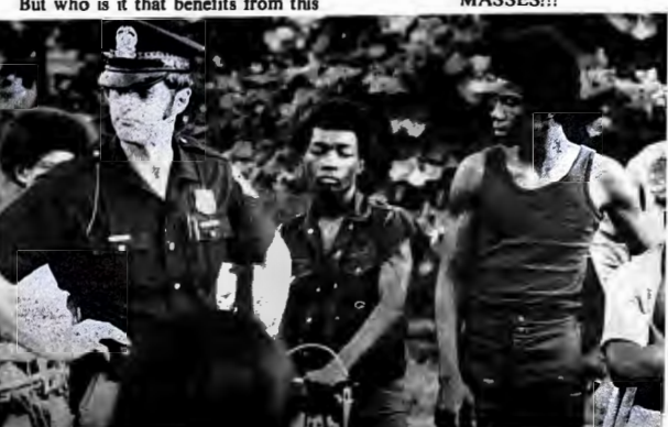
This South Bend, Indiana Policeman, though opposed to the liberation of oppressed people, is the tool of imperialist rule, because his violence is used to maintain control for the corrupt runners of this society.