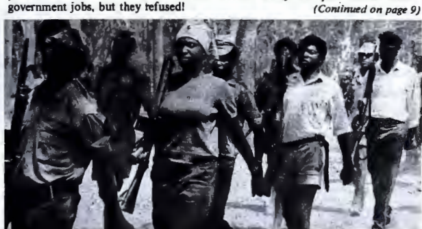
Not only are Afrikans struggling against colonialism in Angola, Mozambique, Guinea Bis-sau, Azania, Namibia and Zimbabwe, but struggles are being waged against Neo-colonialism in Chad, Ethiopia, Zaire and the Cameroon

Chad is military, political and economic subordinate of France, who it military, uses in times of crisis, such as using the army to put down minor