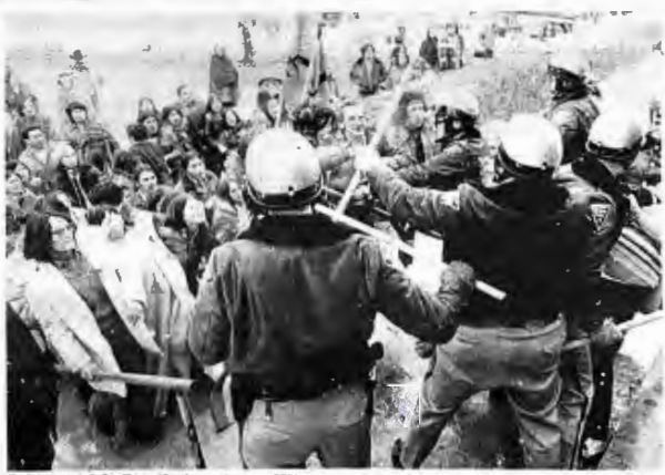
Police attack Indians during seizure of Wounded Knee, South Dakota last year. Now the Indians are being tried and convicted for justly struggling for their rights under treaties with the U.S. government.

2. Repeal of the Indian Reorganization Act of 1934, a major weapon in robbing Indians of their treaty-guaranteed reservation lands, and a means of setting up white-controlled puppet governments. On Pine