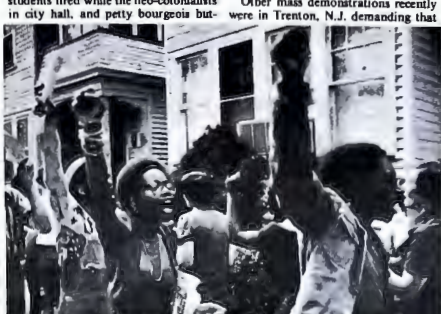
Neighborhood Youth Corps students demand that they be rehired with full back