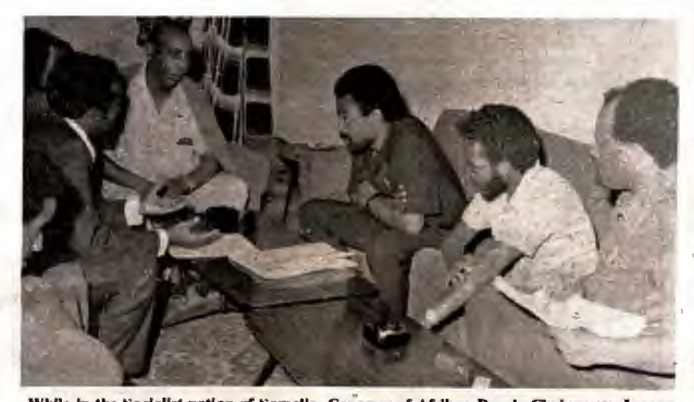
While in the Socialist nation of Somalia, Congress of Afrikan People Chairperson Imamu Baraka met with the revolutionary President of Somalia, Jalie Siyad Barre, shown at table's

Immediately after the exciting accomplishments of the Afrikan Women's conference which was sponsored by the Social Organization work council of the Congress of Afrikan People, in early July, a CAP delegation consisting of Imamu Amiri Baraka, Chairman of the Congress, Bibi Amina Baraka, Minister of the Social Organization work coun-cil, and Jeledi Majadi, Chairman of the NewArk cadre's department of Politics, visited the Democratic Republic of Somalia, as the result of an invitation from Somalia's Minister of Culture, Jalle (Comrade) Mohammed Adan.