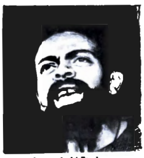
Inners Amiri Buraka

Imperialist domination implies all forms of domination by the Imperialist powers over the oppressed people, including cultural domination. It was Lenin who described "the unbridled imperialism" of the 20th century this way, "what we europeans the imperialist oppressors of the majority of the people of the world with our habitual, despicable European chauvinism, call colonial wars are national wars. One of the main features of imperialism is that it accelerates the development of capitalism in the most backward countries, and thereby widens and intensifies the struggle against national oppression. To deny all possibility of national wars is wrong in theory, obviously mistaken historically and in practice is tantamount to European chauvinism."