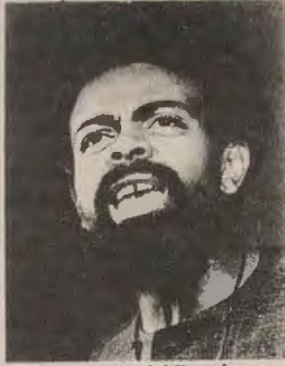
Imam Amiri Baraka

Apparently, for the white "left", Revolutionary Nationalism, and Pan-Afrikanism, have proved to be formidable enemies. Why this is, is perhaps not obvious to people who haven't thought about it before, but, for those of us a long time in the movement for National Liberation, it is very obvious. The white "left", like most whites, are addicted to the domination of colored peoples. White supremacy is an international sickness, and it shows itself whether the particular white folks pushing it call themselves "Left" or Right wing, or Democrats or Republicans.