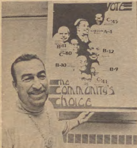
(Adam Clayton Powell in Newark, 1970, Supporting the Gibson Team)

Black people of Harlem, and the world lost a great Black man. A Black man who was a leader of Black people and struggled throughout his entire life to defend our dignity and to obtain our rights as citizens.