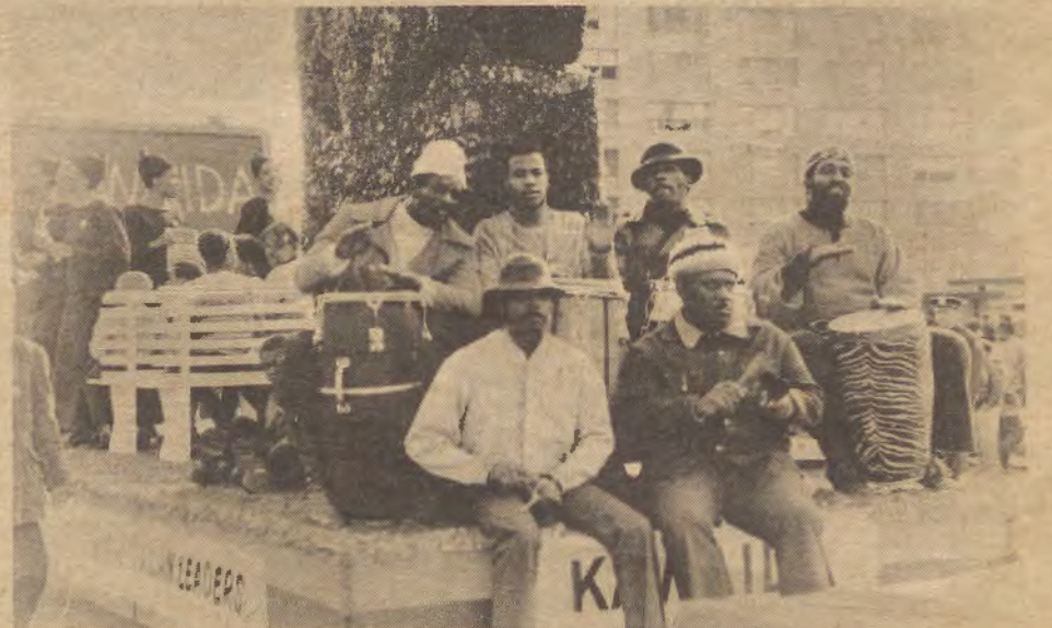
(Committee For Unified NewArk float of African Free School during Crispus Attuck's Parade on Sunday, April 9th)

well as funds for health care and parent activities.