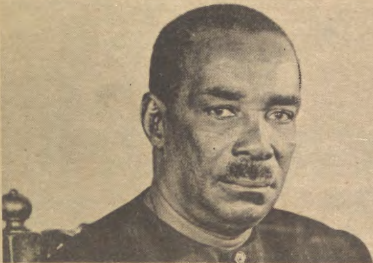
Sheikh Abeid A. Karume