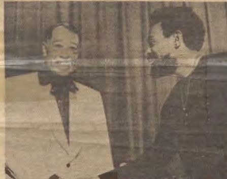
Duke Ellington (on his birthday) greeted by Imamu Baraka at NAACP Cultural Center.