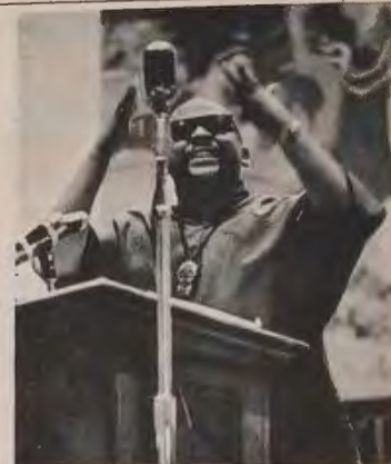
MAULANA RON KARENGA — Founder-Chairman of "US" Black Nationalist Cultural Organization. Firing words of wisdom at the hundreds of Black faces that attended this light of Blackness. "We are the last revolutionaries in America. If we fail to leave a legacy of revolution for our children we have failed our mission and should be dismissed as unimportant." Teach Maulana.