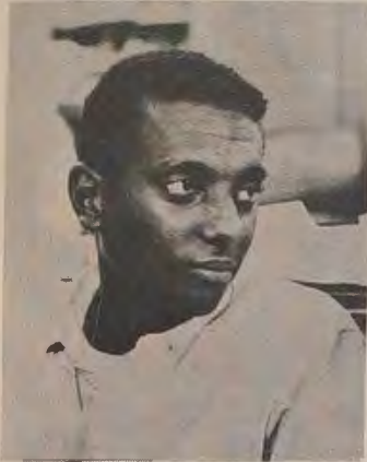
Stokeley Carmichael To give policy statement