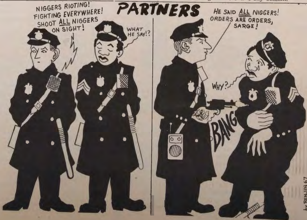
by BENJIN 67