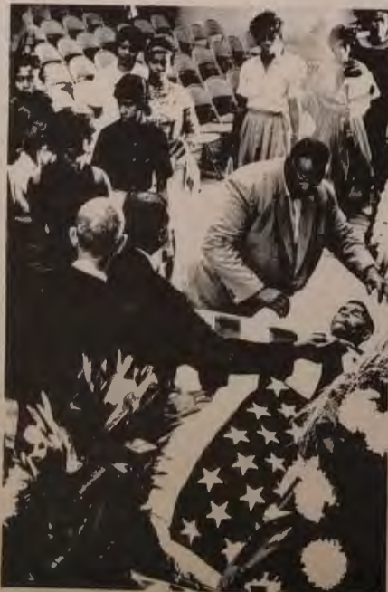
Medgar Evers Funeral

Doctor King said, "He had a dream". He told you like that was. That it was, yes certainly, a dream. A dream of freedom, for all men. But men will be free only in a world governed by a species that need all men free, only by breed of man who is indeed brother of all the world. Our dead