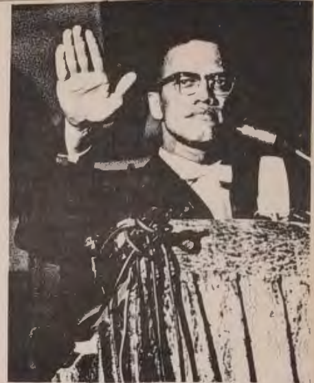
Saint Malik (Malcolm X)

bear upon the essential question of the powerlessness of Black People in America. He would have led a voter registration voter education drive in Newark, for the purpose of achieving power for Black People, that is Black Power.