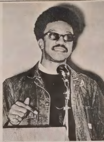
Brother H. Rap Brown