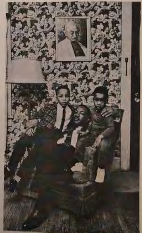
Reverend King with sons

But they have killed our bodies before, but they have never stopped us from movin' on up. They never will, even by taking our gentle priests of love & reason . . . in fact, all they will do is show us that perhaps love and reason is not what these monsters need. Yes, come to think about it, that is exactly what they have shown us. (And they have shown us innumerable times before.) Let us not forget this time.