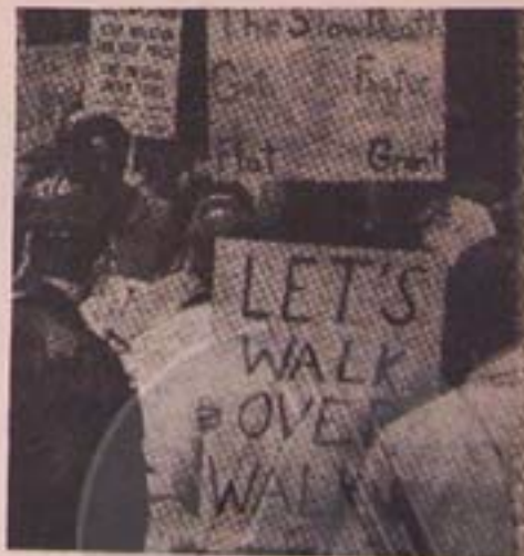
Irate Chicago welfare recipients picketing state offices in protest against the "flat grant" system.