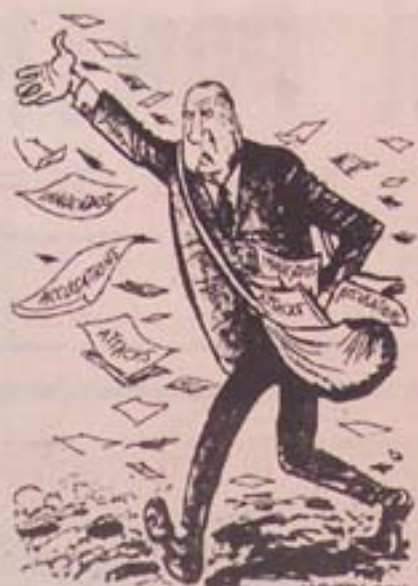
© McClintock - Ed "Oh, the things you see spread around - innuendos, accusations, attacks!"

The American people must not allow this gang of conspirators to continue drawing the country deeper and deeper into degradation, shame and dishonor. If we fail to act to stop them, in effect, we become their co-conspirators.