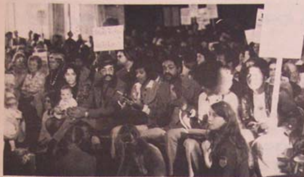
ELAINE BROWN and BOBBY SEALE joined over 500 concerned parents, teachers, community people and school children at the Oakland School Board Meeting last week.