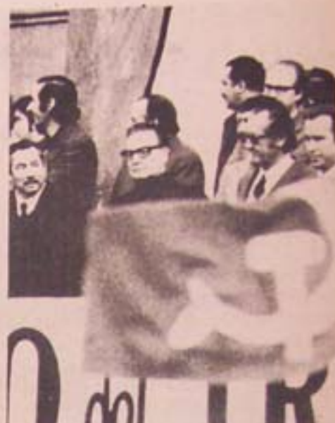
SALVADOR ALLENDE and members of his cabinet on Sept. 4, third anniversary of his election as President of Chile.

Another aspect of the military repression is the campaign against foreigners. The military junta blames foreigners for having implanted Marxism in the minds of Chileans, thereby ignoring the 50 year history of Chilean Socialist and Communist parties. Many Latin American political exiles had sought refuge in Chile.