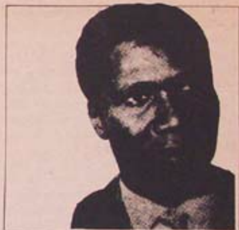
President AHMED SEKOU TOURE of Guinea.

The Guinean president then analyzed the actions of imperialism in Africa, Latin America and Asia, stating that in the course of the two world wars imperialism "managed to encircle almost all our planet in