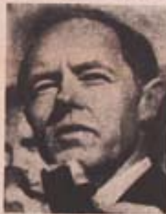
E. HOWARD HUNT, accused Watergate conspirator

Overland, 17 miles from Midway Airport, between James O'Connell and Hurley Schools and Holy Cross Hospital, just beyond Meigsdale Park, Flight 553 stopped dead in the air, shattering in her death throes, 4000 a second.