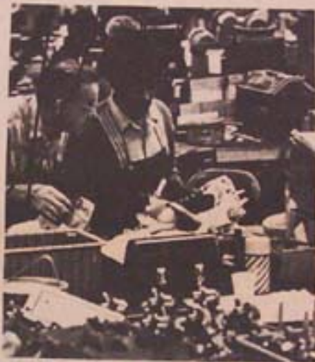
The racial discrimination decision against Detroit Edison could mean an advance in the plight of Black people denied work.