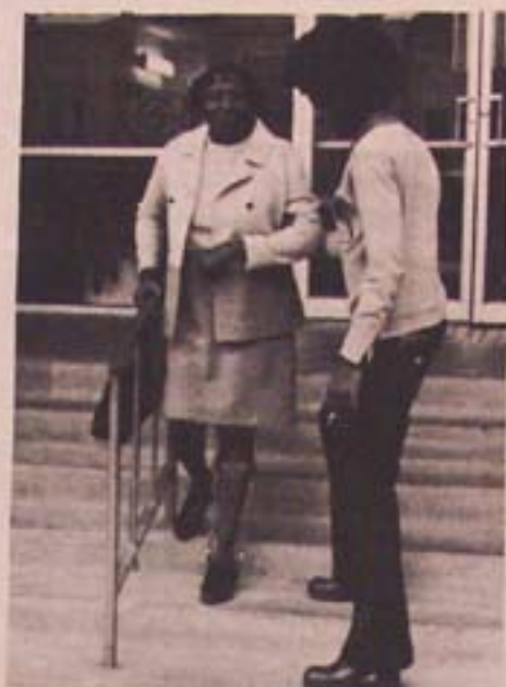
Senior citizen being escorted from an Oakland bank by the Senior Citizen S.A.F.E. Program. Where are Reagan's programs?

The lawsuit charges that in addition to planning illegal monetary cutbacks that the state is entering into