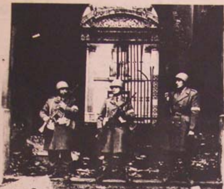
Fascist soldiers guarding the ruins of Moneda Palace in Chile after it was bombed by the right-wing military.