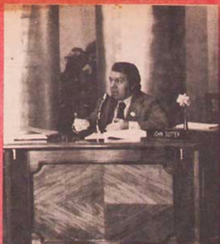
SEE ARTICLE PAGE 3