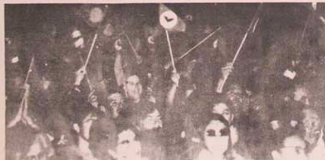
Praising the $1.6 million given to the United Farm Workers Union by the AFL-CIO, Cesar Chavez told the 5,000 farmworkers that attended a recent rally, "Now, we will be able to have a real strike for the first time!"

It makes no difference to the U.S. that the unmined coal beds on the Cheyenne reservation belong to the Cheyenne people, who have every right to re-negotiate exploitative contracts which were previously okayed by the corrupt Bureau of Indian Affairs.