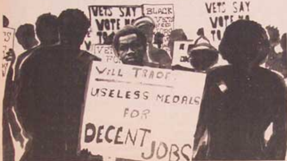
Recently released statistics regarding the employment of Black veterans form a harsh and stinging critique of U.S. society.

tribute to worsening and undermining the job-getting potential of Black G.I.'s.