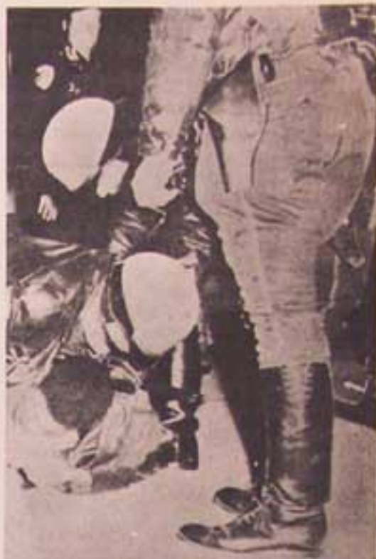
The draft community control of police ordinance calls for the formation of Citizen's District Police Boards in order to set strict and just policies and procedures.