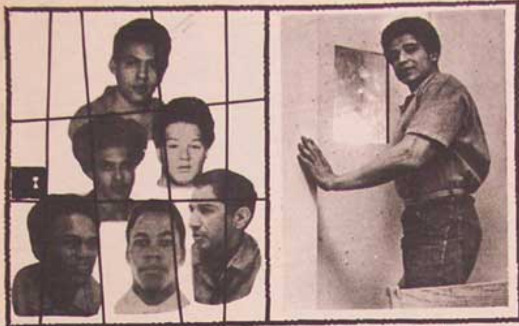
The SAN QUENTIN SIX and GEORGE JACKSON (right).