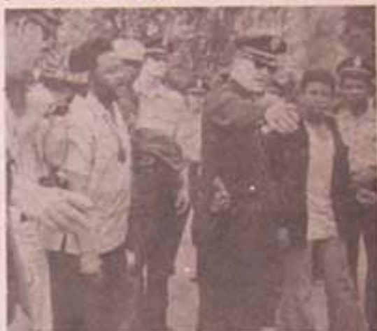
Atlanta police arrest pickets at Rich's Department Store; as usual, they are called upon to keep the Black community in control.