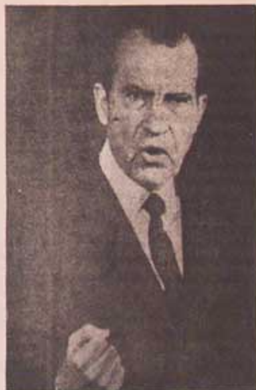
Concerned citizens around the country are demanding the impeachment of RICHARD NIXON.

THE BLACK PANTHER hopes to provide our readers with a report of the results of the convention in the near future.