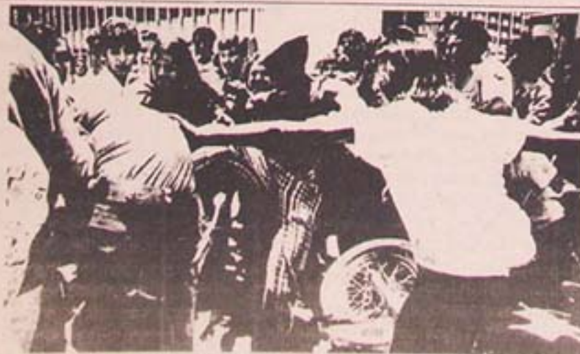
Dallas community demonstrating against police murder of non-White youths. See story on page 4.

(New York) - The U.S. government withheld millions of dollars of foreign aid to Ecuador in 1971 and 1972 at the request of the International Telephone and Telegraph Corp., according to the August 14th issue of Business Week magazine. Pressure was exerted on the U.S. government to secure a more favorable settlement for ITT's expropriated properties in Ecuador.