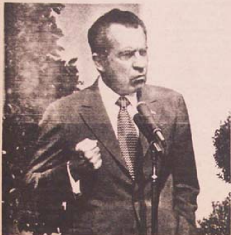
The Watergate hearings have shown that NIXON and his colleagues are not representatives of the people, but corrupt criminals turning America into the most repressive society in the history of the world.

After 37 days of hotly-contested televised hearings, after listening to the testimony of 33 witnesses, whose stories and revelations ranged from incredible to credible to outright lies, the Senate Select Committee on Presidential Campaign Activities has now taken time out to catch its breath. Recess will last until September 10th, and if Watergate, Part II, is as successful as Watergate, Part I, the next recess called may be for only one purpose -- the impeachment of the President of the United States, Richard M. Nixon.