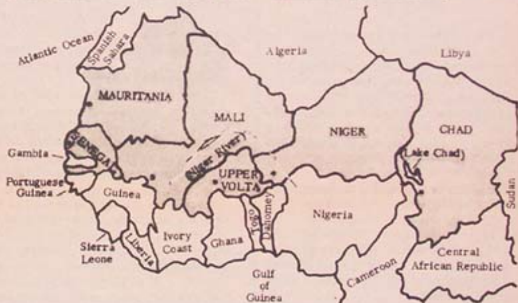
Six West African countries (shaded) are victimized by the famine caused by five years of drought. Areas of northern Nigeria are also affected by the drought.

With such provisions the state governments hope to avert any immediate