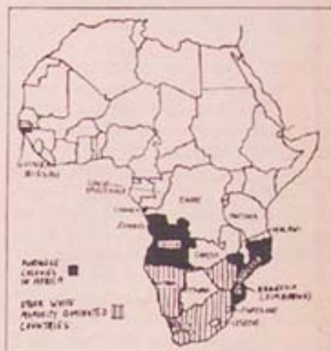
Portuguese-dominated areas are in black.

In the interview the governor spoke out against repression of the population and said that a solution will only be possible on a political basis. He will be replaced by a general who