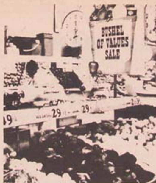
Food cooperatives are an answer to the present high cost of food.