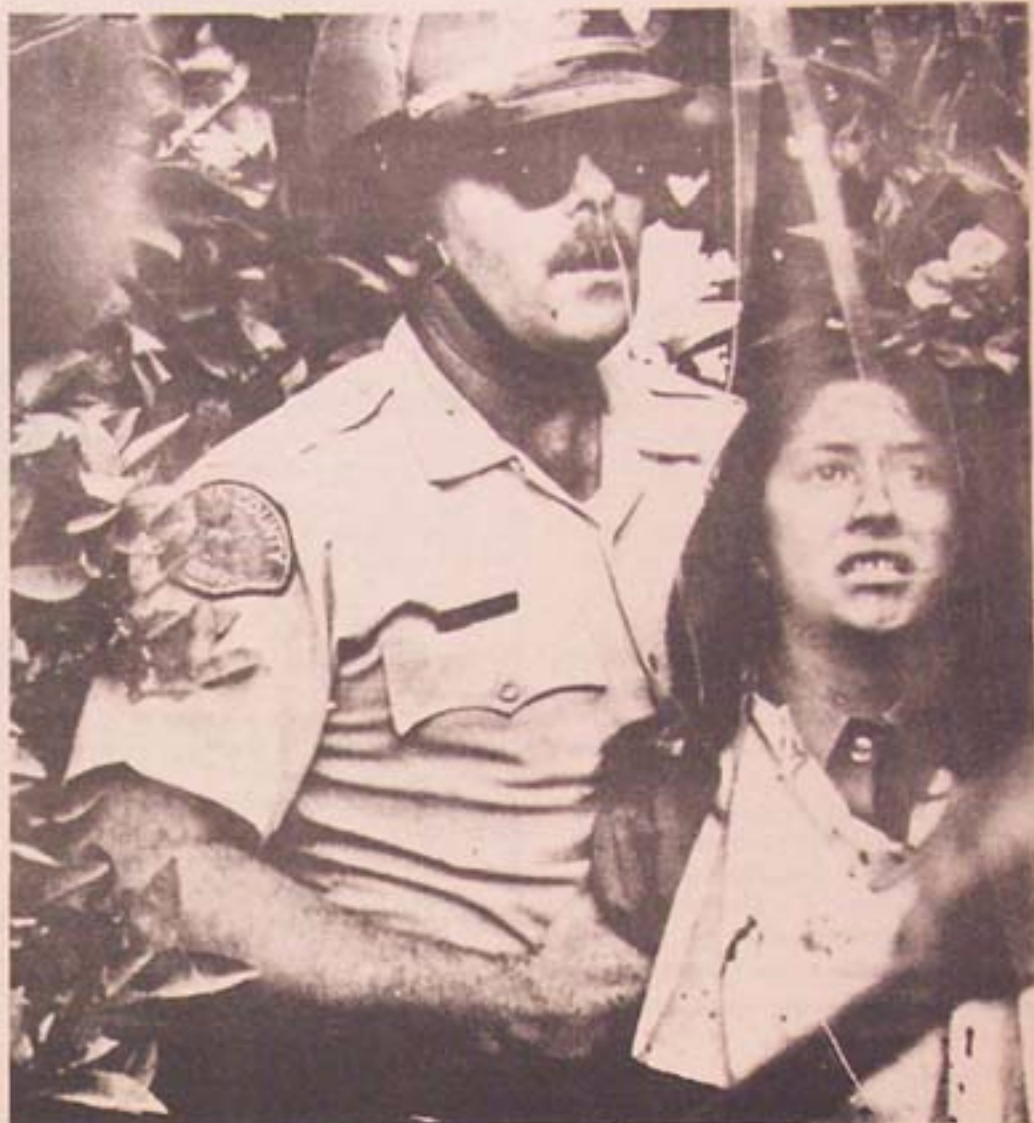
While in the fields, striking Mexican-American farmworkers are constantly harassed and arrested by police, who are conspiring with the racist Teamster Union to destroy the UFW.

Since Rizzo has become mayor, he has had more opportunity to show his sick, "strong-arm" mentality. Speaking before the Fraternal Order of Police recently, Rizzo called for the re-establishment of the death penalty and publically advocated lynching. "Let's bring the electric chair back", he said. "Anyway they want to do it. Even with a piece of rope...I could care less if it's a deterrent--take that mad dog's life..."