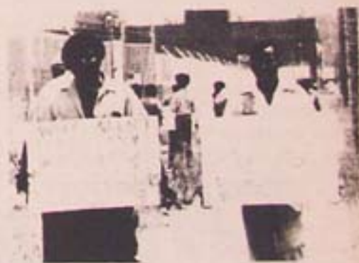
Picketers at Skill Center Project.