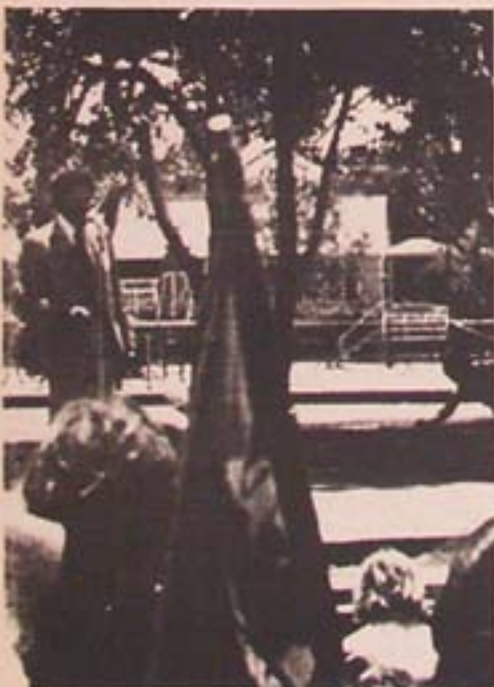
BOBBY SEALE speaks at a rally in Richmond, California in support of the farmworkers.

Prior to these most recent events, 2,000 farmworkers, displaying an enthusiasm and dedication that sparkled even as reports from the rest of California grew increasingly bleak and grim, took to the picket lines here in Delano on Monday, July 30th, as the grape strike returned to the place of its birth. It was in the fer-