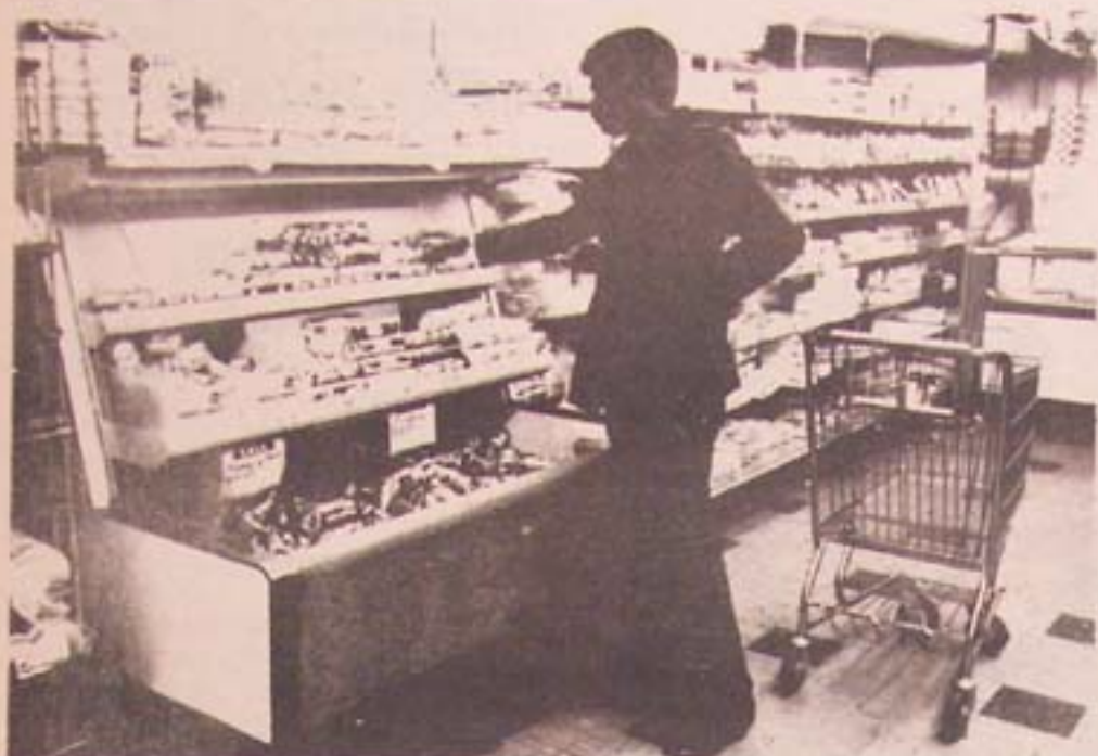
High food prices are responsible for the small number of shoppers.