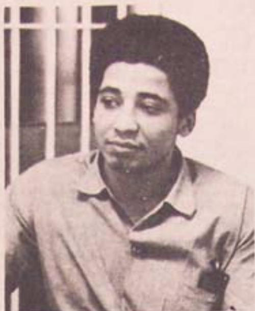
GEORGE JACKSON gave his life for the people.

"Born to a premature death, a menial, subsistence - wage worker, odd-job man, the cleaner, the caught,