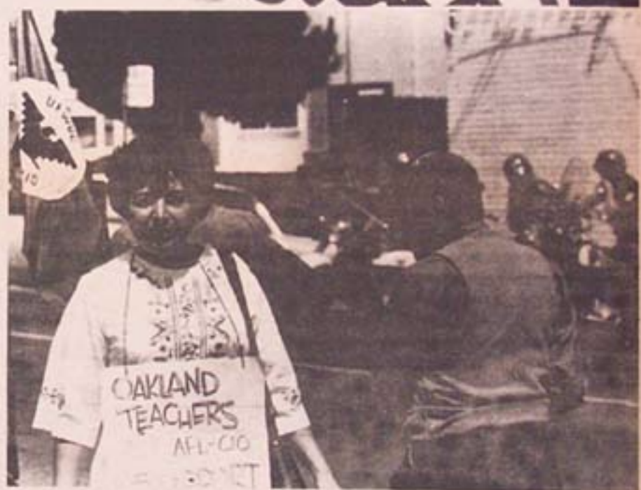
On Saturday, July 28th, throughout the city of Oakland demonstrations took place in support of the FarmWorkers Union. Over 200 demonstrators, chanting, marching, picket signs raised high, brought the "Boycott Safeway" message to even more local Safeway stores. (Above, Safeway store at Fruitvale Ave. and Foothill Blvd. in East Oakland.)