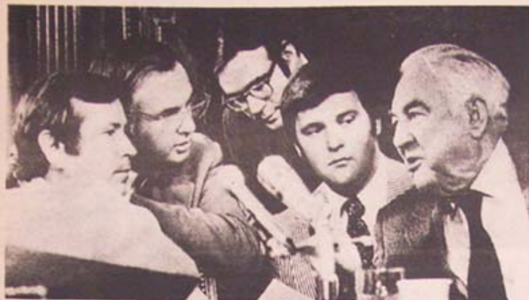
Watergate committee chairman Sam J. Ervin, Jr. (far right) confers with (l. to r.) Vice-chairman Tennessee Senator Howard H. Baker, Jr., Connecticut Senator Lowell P. Weicker, Jr., both Republicans, as Ervin aides look on.