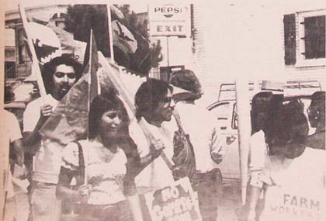
It must have appeared to Safeway officials that a "conspiracy" was underway -- indeed, it was a conspiracy of the poor.

THE BLACK PANTHER urges all our readers to buy only U.F.W. picked table grapes!