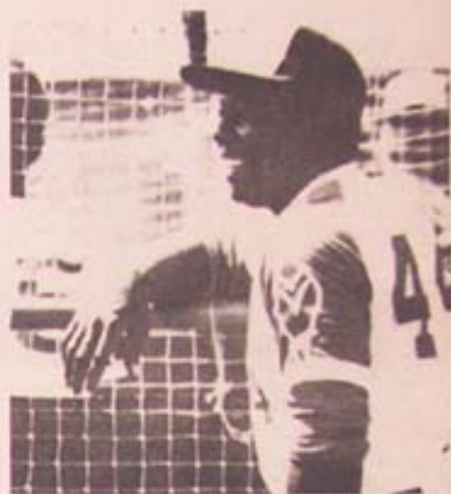
The Black Panther Party extends our congratulations to HENRY AARON for home run No. 700.

see Henry Aaron break the home run record, a sizeable, vocal and potentially dangerous racist minority doesn't. Included in the ranks of those who don't want a Black man to break "the Babe's" record is, strangely, the present commissioner of baseball, Bowie Kuhn. When some of the pitchers in the National League jokingly mentioned that it would be profitable to them if they threw the pitch that Henry Aaron hit for No. 715, Bowie Kuhn went out of his way to threaten fines and suspensions for any pitcher who "grooves" a pitch to Aaron. When he hit No. 700, Henry Aaron received thousands of messages of congratulations, noticeably absent was the congratulations of Bowie Kuhn.