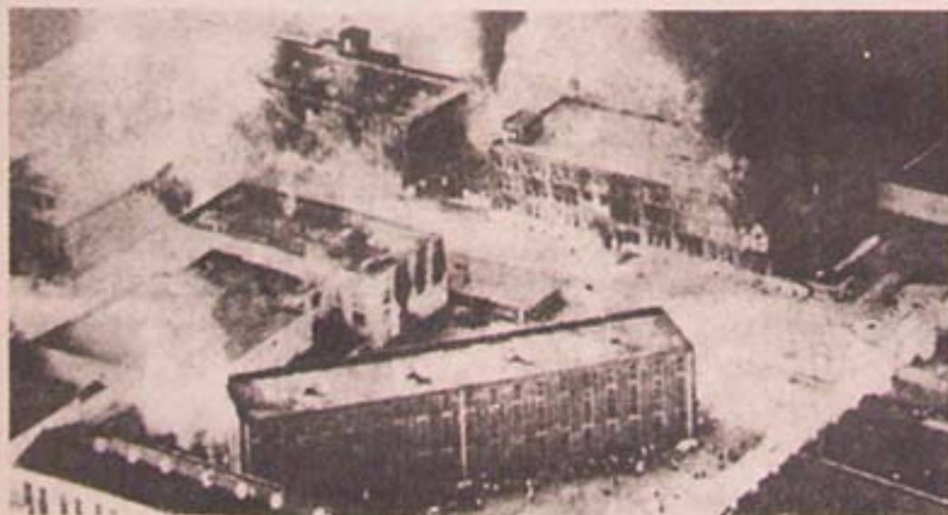
Infuriated by their inhuman treatment, prisoners at McAlester Prison (above) set fire to twelve prison buildings.