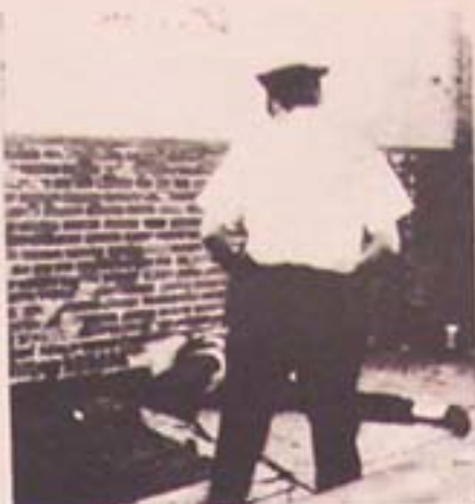
History has recorded numerous instances of Blacks being murdered by police.