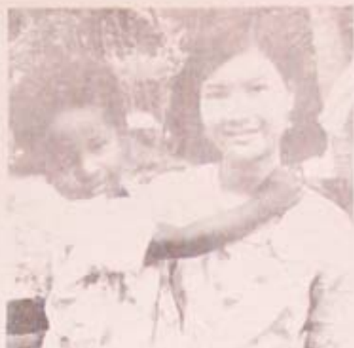
700 Black Vietnamese orphans have experienced the tragedies of war.

Today, in South Vietnam, there are over 700 Black Vietnamese children in orphanages. For most of these beautiful children, only the fate of social ostracism and isolation awaits. A number of Black adoption agencies will be attending a conference this month in an attempt to confront this sensitive problem and recruit pro-