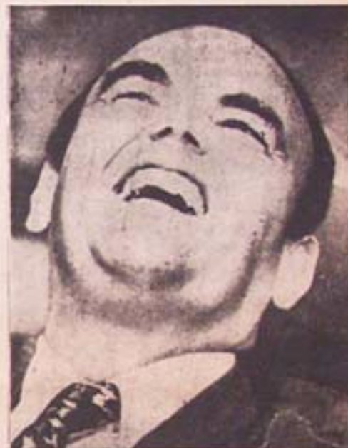
JOHN D. EHRLICHMAN displays confidence and arrogance before the investigating committee as he calls burglary legal and Nixon above the law.

lace had a close call. He nosed out ex-Governor Albert Brewer by a narrow 51.5 per cent of the vote.