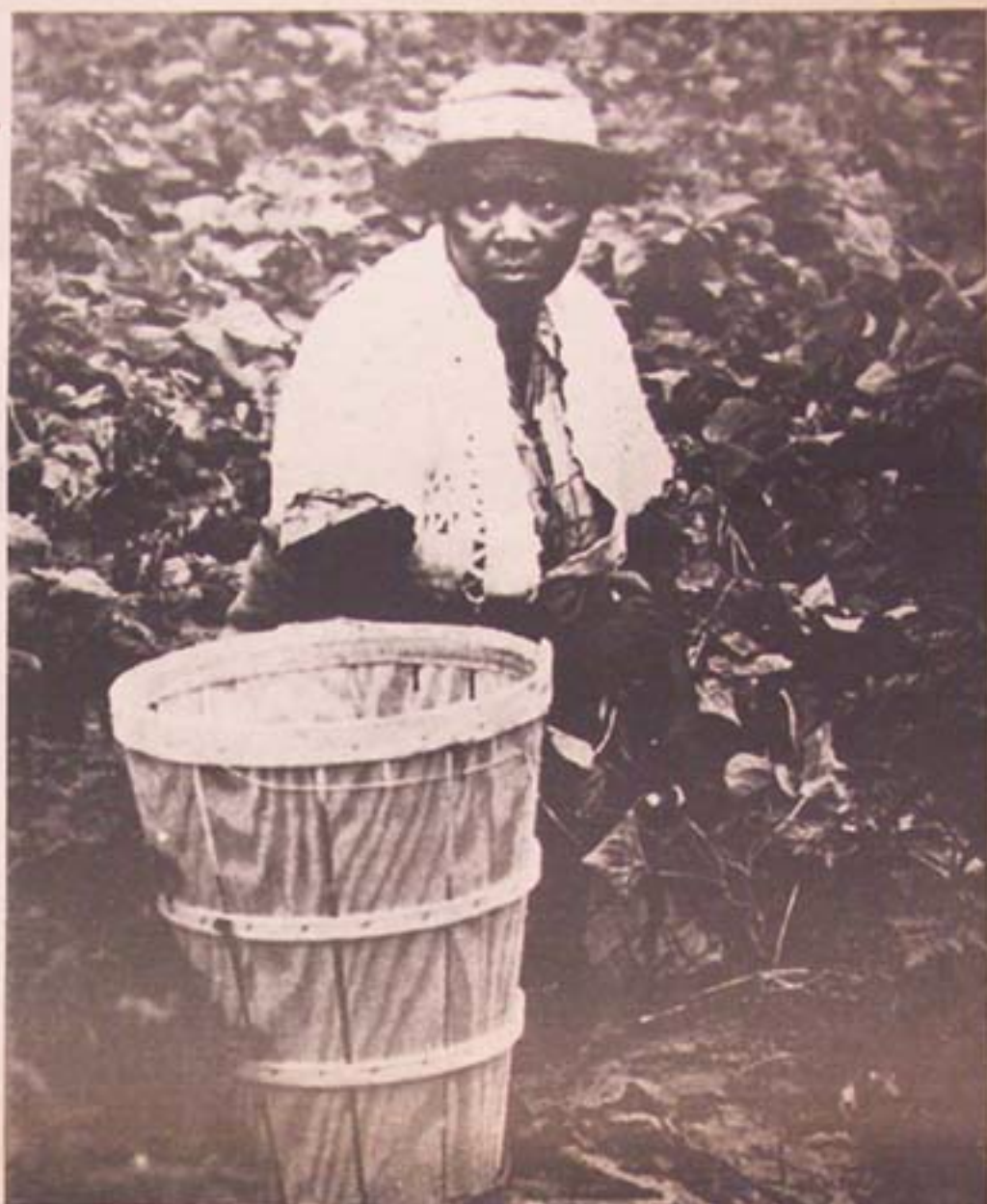
Welfare recipients would be forced to labor for sub-minimum wages in California's proposed Self-Support Program.

This method of programming will eventually lead to human re-cycling, as in the direction of the federal Work Incentive Program (WIN). This forces all employable welfare recipients to work on jobs with explicitly marginal, sub-minimum wages, but the recipients' bargaining position in the process has no bearing on wage increase. This means they'll have no support