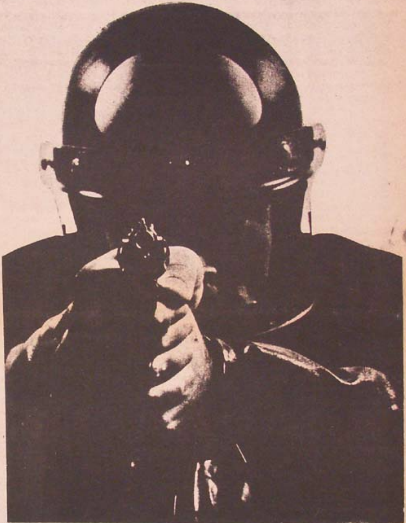
The death penalty must be abolished in the streets.

Now the police departments are given enormous sums of money to carry out their genocidal programs. The state of Georgia will receive $10.3