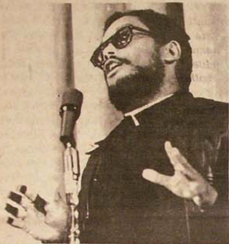
The only difference between Jesus and the Black Panther Party is that Jesus fed 5,000 and the Black Panther Party feeds 10,000.