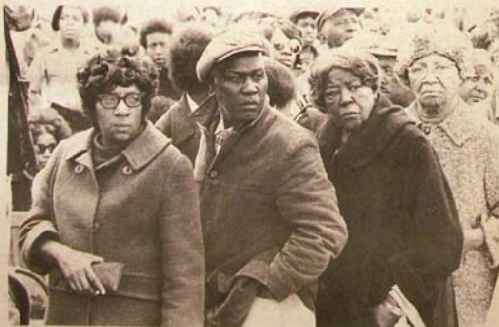
"Too many time they've tricked us, and lied to us, like they lied to my mama back in the '30's."

"What I'm talking about is a people's human revolution. That revolution will not be like the revolution in Russia in 1917, nor will it be exactly like the revolution in China, on the day of victory in 1949. It will not even be like the revolution in Cuba; but it will be like the revolution here. Those were underdeveloped countries. Those people were starving, and those people built and worked and built and worked all over China. They're feeding