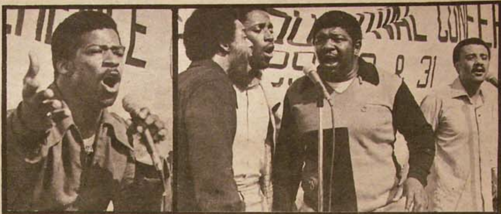
The PERSUASIONS sing for the People: "...As long as I've got shoes to put on my feet/ and food for my children to eat/ EVERYTHING'S GOING TO BE ALL RIGHT..."

It was a unity at the Black Community Survival Conference that could be seen in real terms, and felt in the songs, sung without instruments, of the Persuasions, with the culture of oppressed people being stomped and clapped-out, taking a new and revolutionary turn, as they sang, "... As long as I've got shoes to put on my feet/and food for my children to eat/EVERYTHING'S GOING TO BE ALL RIGHT..."