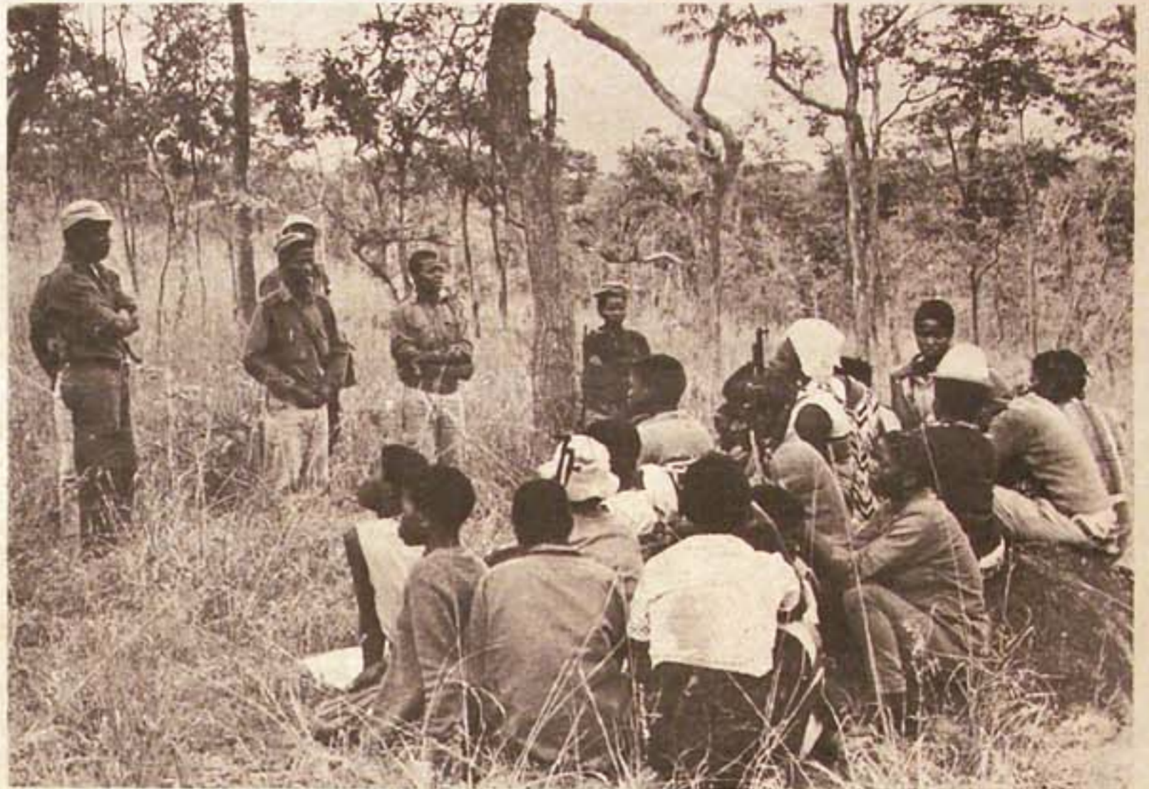
FRELIMO meets with a village women's detachment. Each village is prepared to defend itself against Portuguese invasion.

Women are, in a traditional sense, never allowed into conversations, discussions, meetings and roles of major significance. In some instances, they