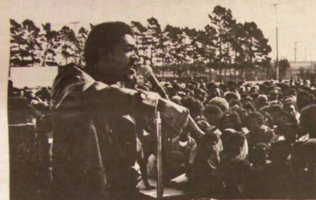
"We're not moving to implement survival programs because we're reformists, and we're not saying that the survival programs are revolutionary... But, the survival programs are tools and institutions by which we unify our people."

all 800 million people. But, right here in America, from the Congressional reports, there are still 20 million people hungry, here in the most wealthy country in the world.