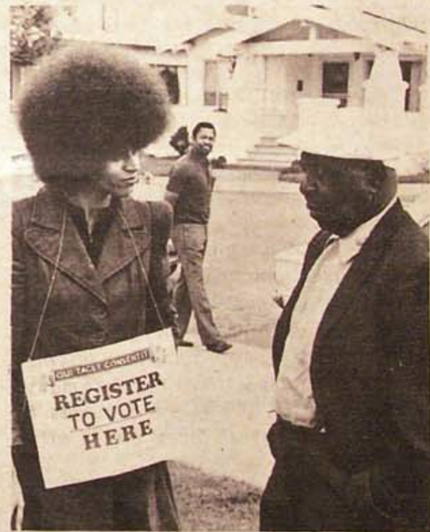
Not only did the sixteen thousand come, but 11,120 registered to vote.

"The fact that we have had the hardest time for over 400 years; it blows the Man's mind to see that we are still here. We are still here. And we've been beaten, we've been put in jail, we've been drugged, but we still survived. I think the Black woman has really carried the burden of this nation on her shoulders for over 400 years. One thing the Black woman has done, she has produced children, for both Black men and white men. And all of a sudden, now that we don't produce white babies anymore, now they tell us that we're having too many... A lot of people feel that the welfare rolls are all