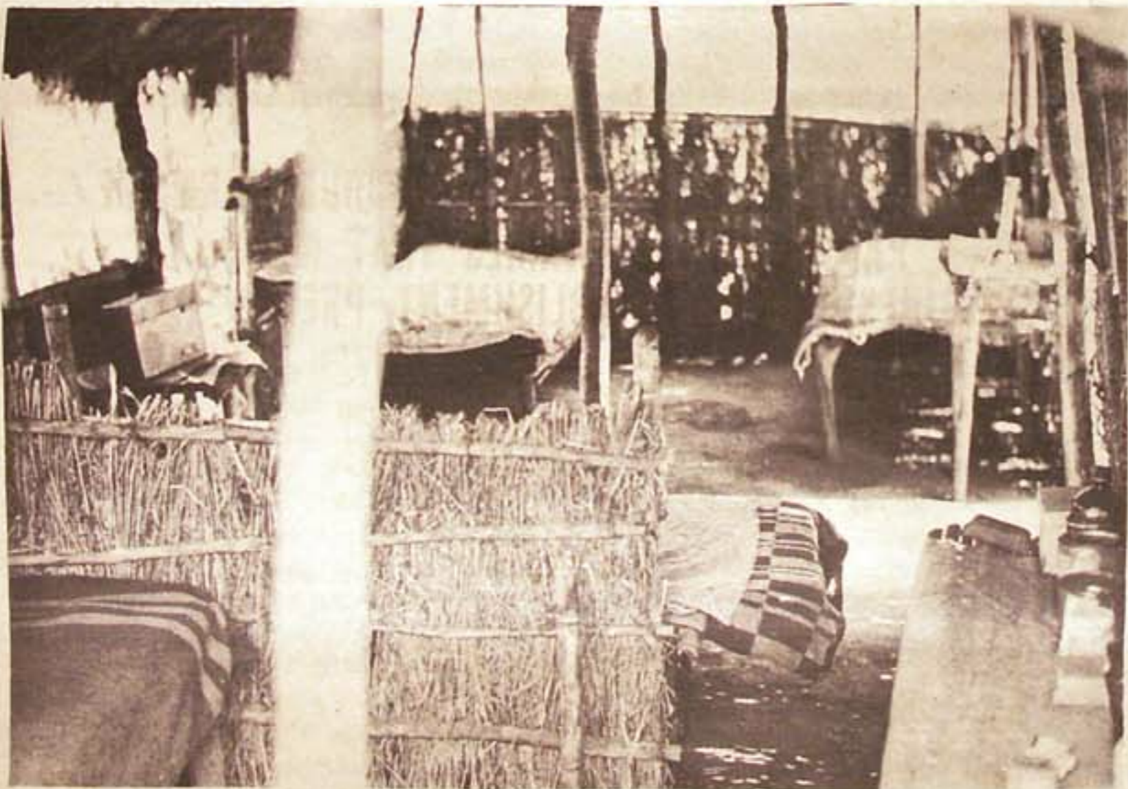
FRELIMO places a priority on the establishment of hospitals in the liberated areas. The level of sterility and cleanliness in the hospitals is remarkable, considering the lack of running hot and cold water and flushing toilets.