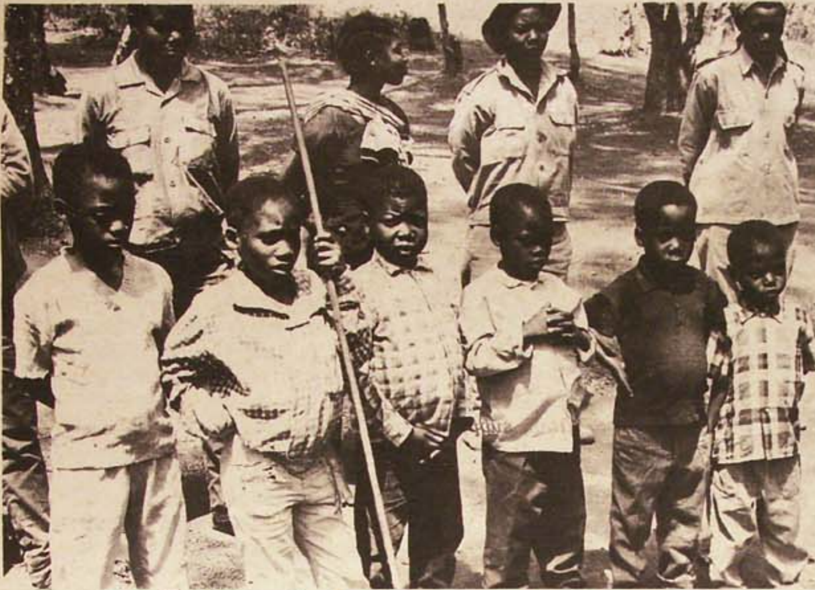
In a FRELIMO orphanage, the warmest possible atmosphere is created for the children, some of whose parents have been killed in the war; others' families are away fighting.