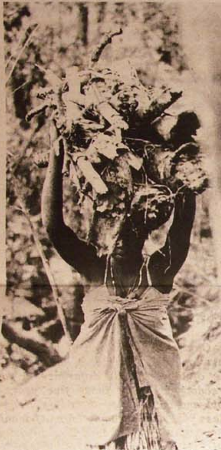
Village women do a lot of work - in the fields, drawing water, cooking and gathering wood.

Many have frowned upon admitting these realities among our people, probably because we did not want to accept them. Nevertheless, they must be faced up to because they are true. The real work FRELIMO is doing is not just the fighting, but the nation building that goes on once the Portuguese are thrown out.