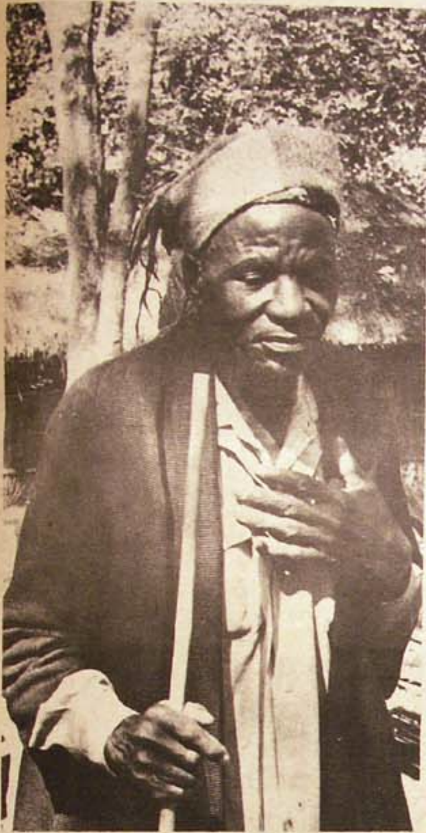
MPANDA, 72 years old, is very aware of the necessity for the struggle against the Portuguese.