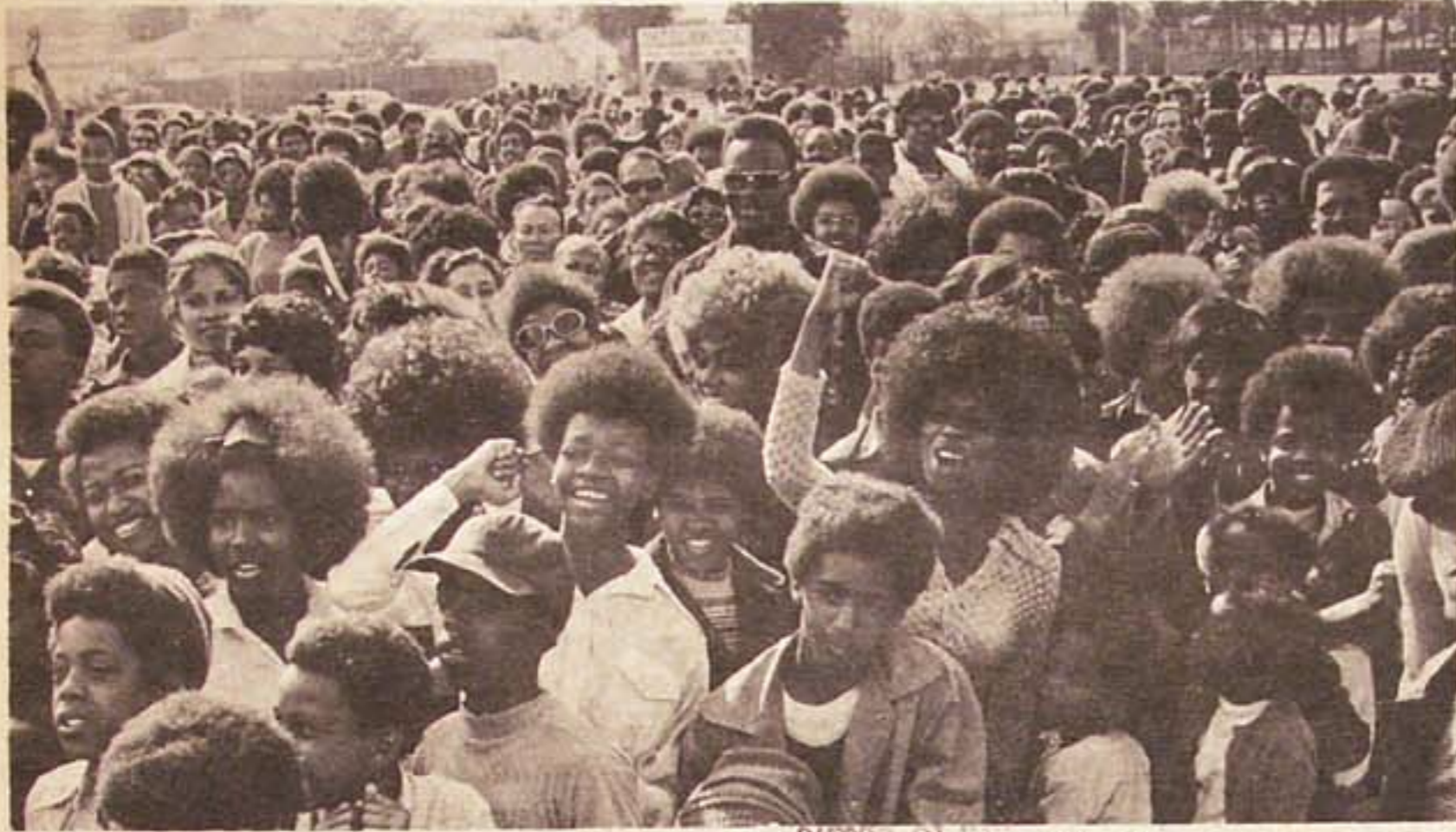
Nearly 16,000 people came to unite for survival at the largest mass gathering of Black people since the time of Martin Luther King...