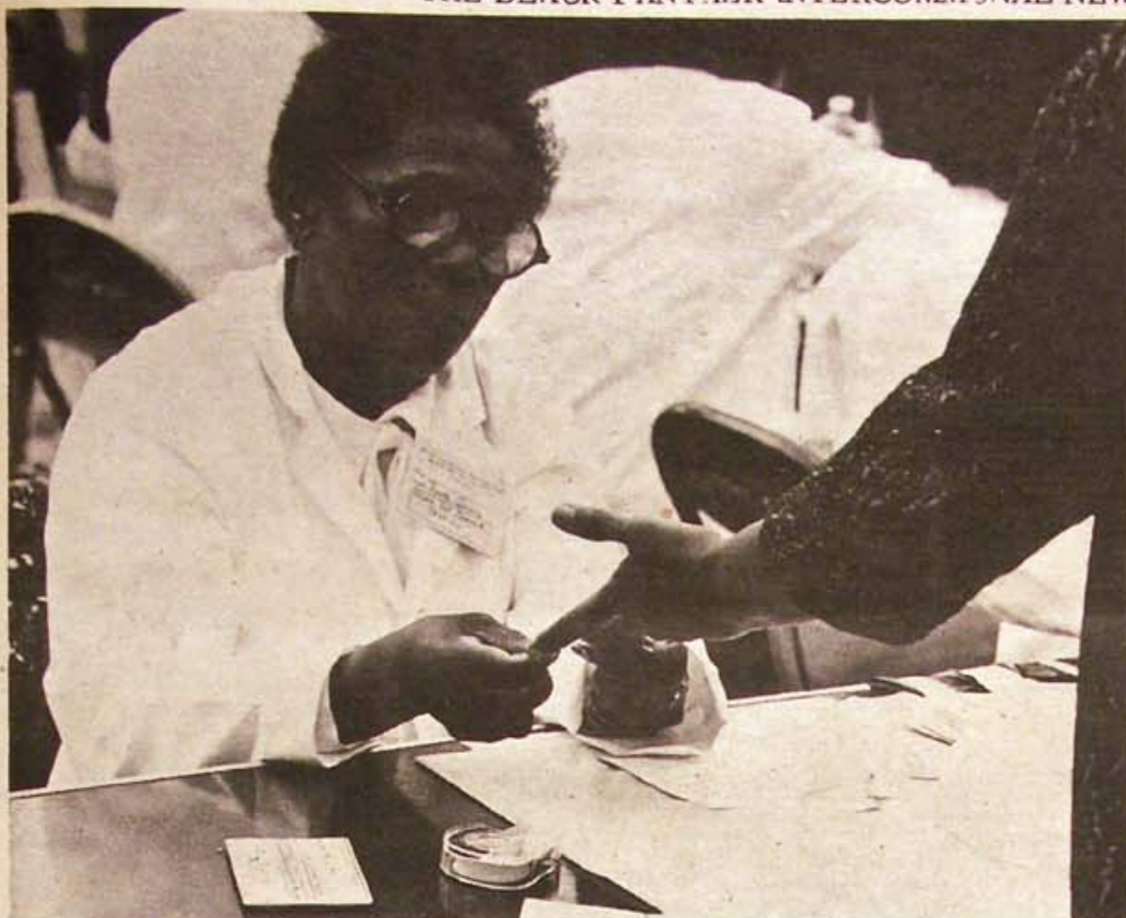
13,282 people received Free Sickle Cell Anemia tests at the Black Community Survival Conference.