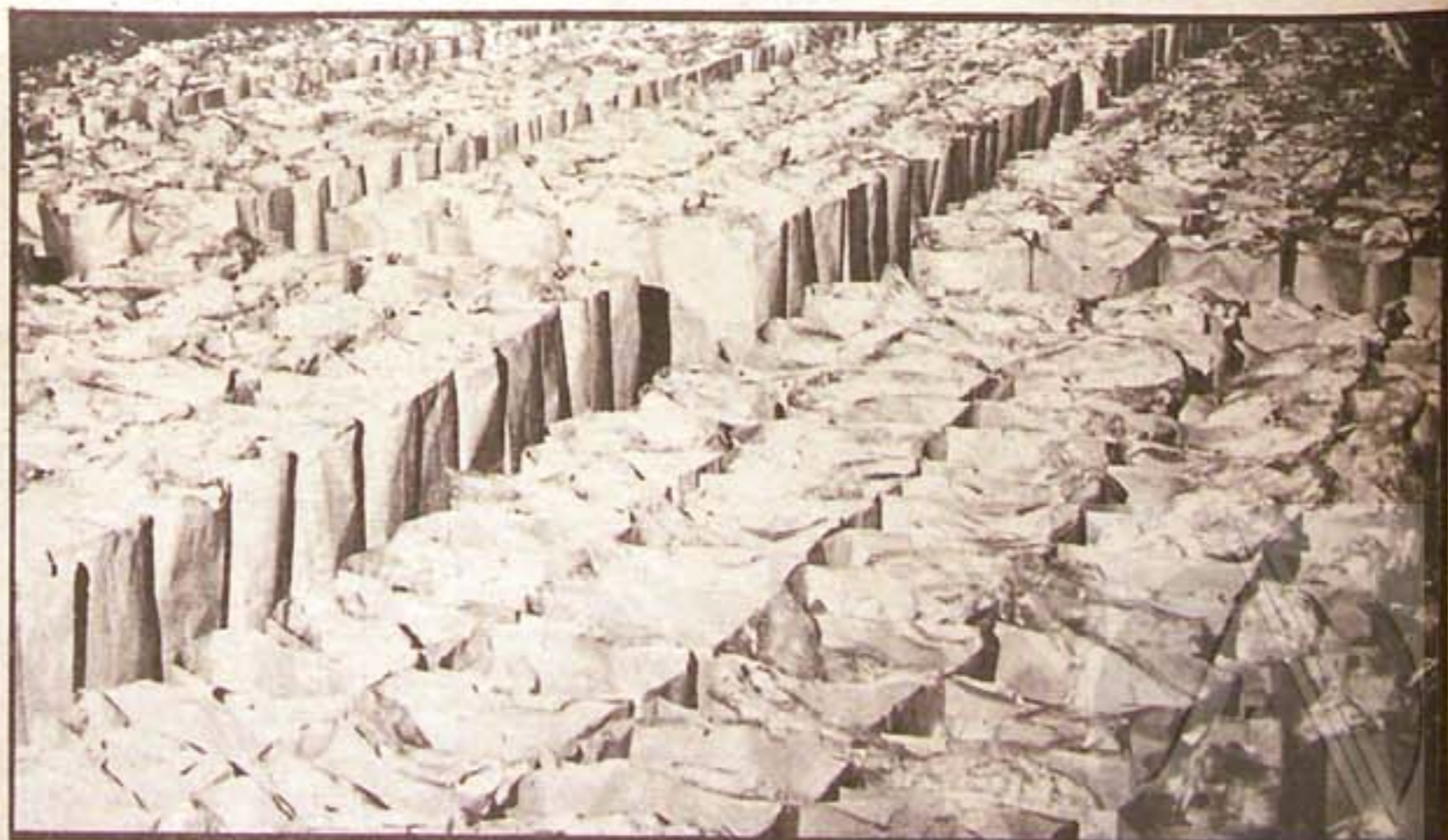
10,000 Free, full bags of groceries were given away at the Black Community Survival Conference.

A: I thought that was a good beginning, politically, to get together around common Blackness. It was difficult to resolve all the problems, because of the many viewpoints of many people from many states. Whereas I think this is a much more non-controversial but original and basic way of going about Black survival.