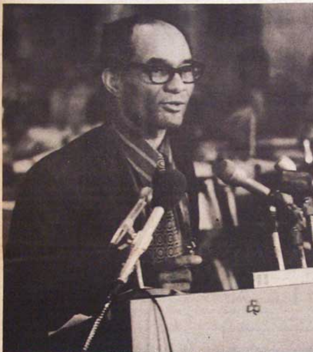
WISCONSIN ASSEMBLYMAN LLOYD BARBEE IS NOT AFRAID TO EXPOSE THE SUPREME COURT.

Fortunately, this step backward in the civil rights movement may not affect actions by the Wisconsin Department of Revenue to revoke the tax exempt status of private clubs in this state which also discriminate against the Black man. Revenue Department officials indicate they will continue their investigation into these clubs, an investigation which has already led to the revocation of tax exemptions for 17 Elks Clubs and one Moose Club.