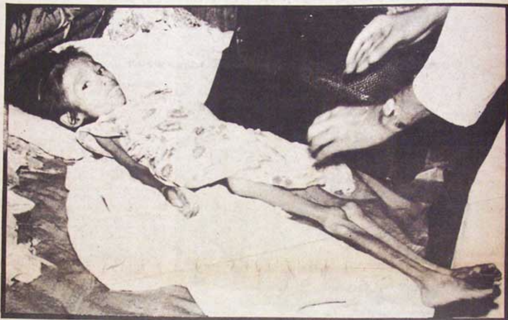
Brazil is a very rich country... why isn't this reflected in the people's lives? Because Brazil's riches are owned by Union Carbide, Bethlehem Steel and Rockefeller.