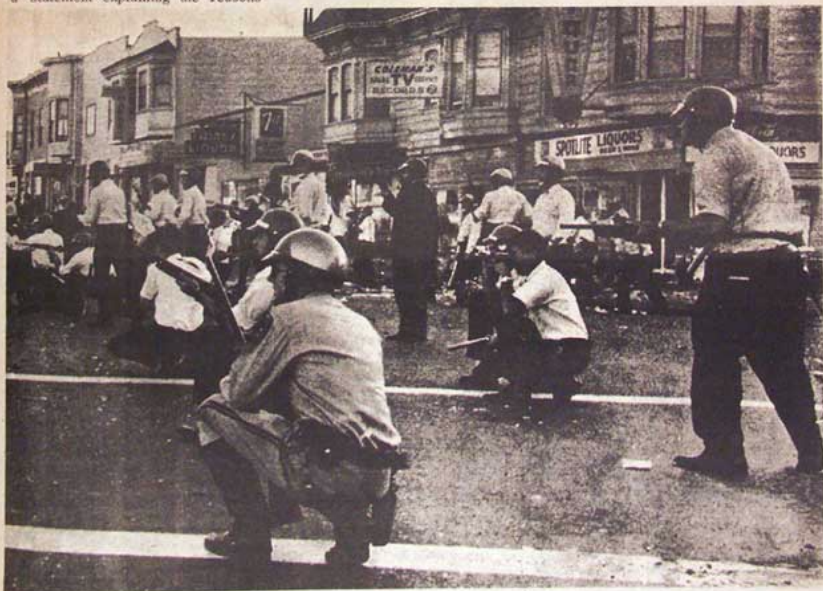
In California, as in most other states, police are still armed by law and still have the right by law to shoot to kill.