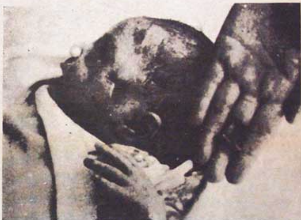
Is the death penalty imposed upon innocent Vietnamese people in the U.S. war of aggression against Vietnam legal under the U.S. Constitution? Where is the decision on that death penalty?

Thirdly, Chairman Bobby Seale showed that the Court's decision might have stayed execution for 600 people in U.S. prisons, but what of the death penalty being daily imposed upon the entire Vietnamese people, thousands and thousands of innocent Vietnamese people having already paid the price. THE U.S. DEATH PENALTY ON THE INNOCENT VIETNAMESE PEOPLE MUST BE OUTLAWED. Nixon bombs