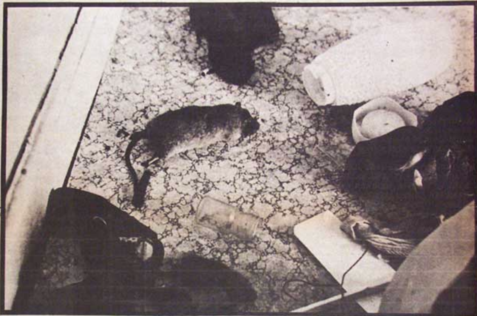
The Boston Housing Authority tells only PEOPLE there's no place to live.

SIX BOSTON FAMILIES BARELY SURVIVE HOUSING AUTHORITY WAITING LIST.