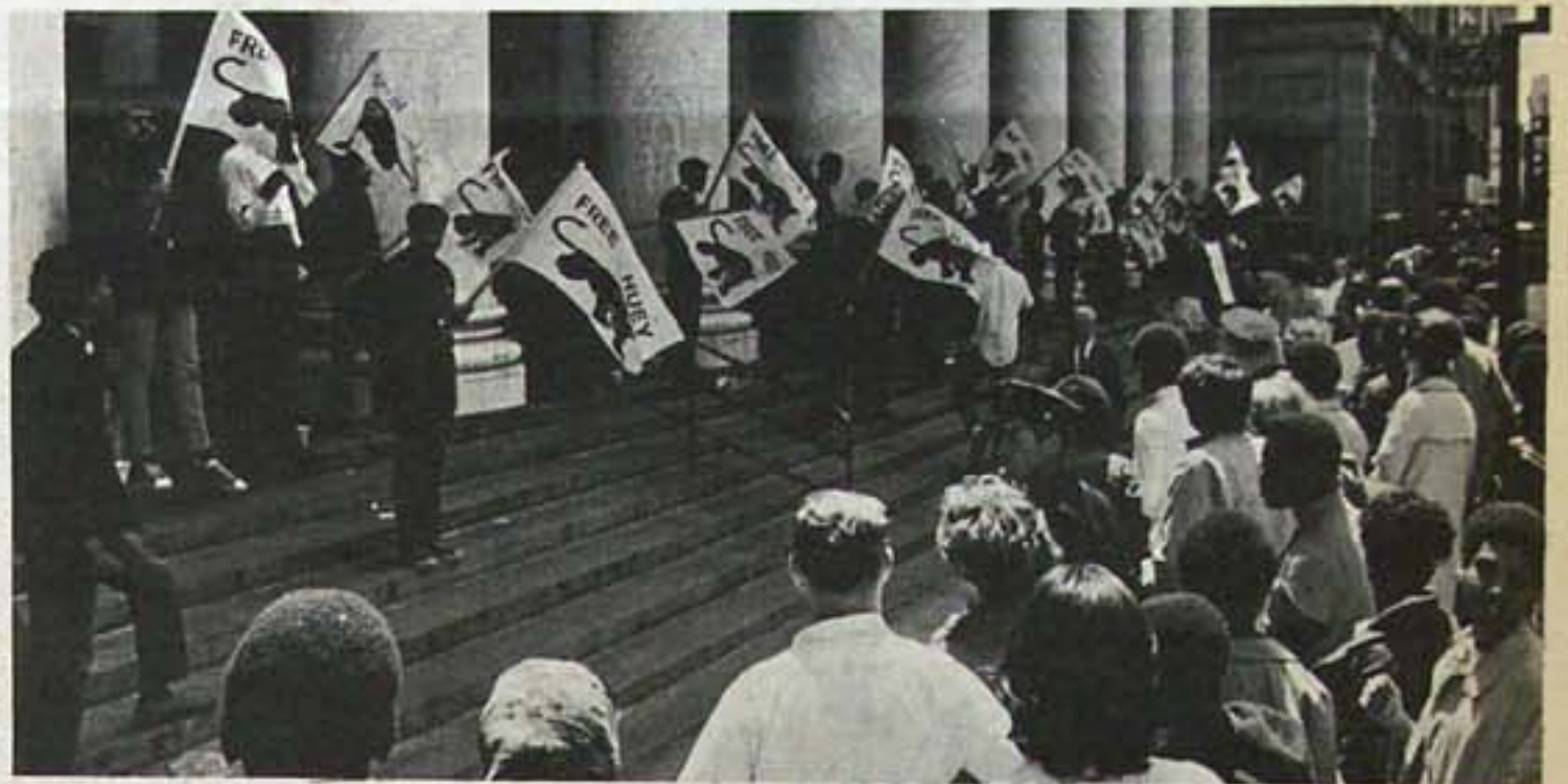
NEW HAVEN PANTHER RALLY, MAY 1, 1969

We want to make clear our deep concern that the Panthers not be denied equal process under law because they are both radical and Black. We therefore pledge our full support to all efforts to insure that they go into the court room without the verdict and sentencing