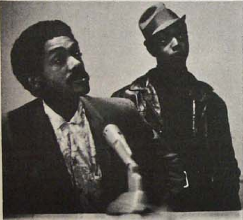
BOBBY SEALE AND L'L BOBBY HUTTON

POWER TO THE PEOPLE Chairman, Bobby Seale Black Panther Party