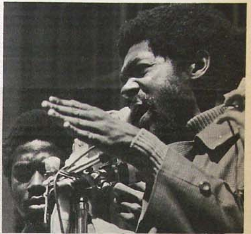
CHARLES BURSEY AND BOBBY SEALE

Because of the basic Ten Point Platform and Program that was put together that deals with the need for full employment for our people, that spells it out; that deals with a need for decent housing, fit for shelter of human beings; that deals with a decent education that teaches us our history and our place in the world and in society; that deals with the need to have fair trials by our peer groups or people from our Black communities or the districts where we live--because of a program that talks about land, bread, housing, education, clothing, justice, and peace; because of