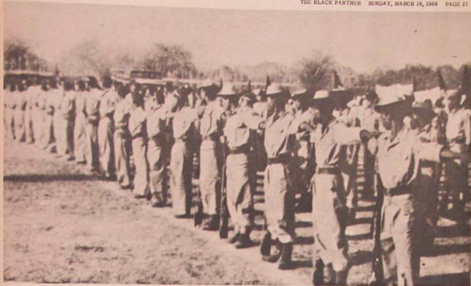
BURMA'S WELL-TRAINED PEOPLE'S ARMED FORCES ARE READY AT ALL TIMES TO WIPE OUT THE ENEMY