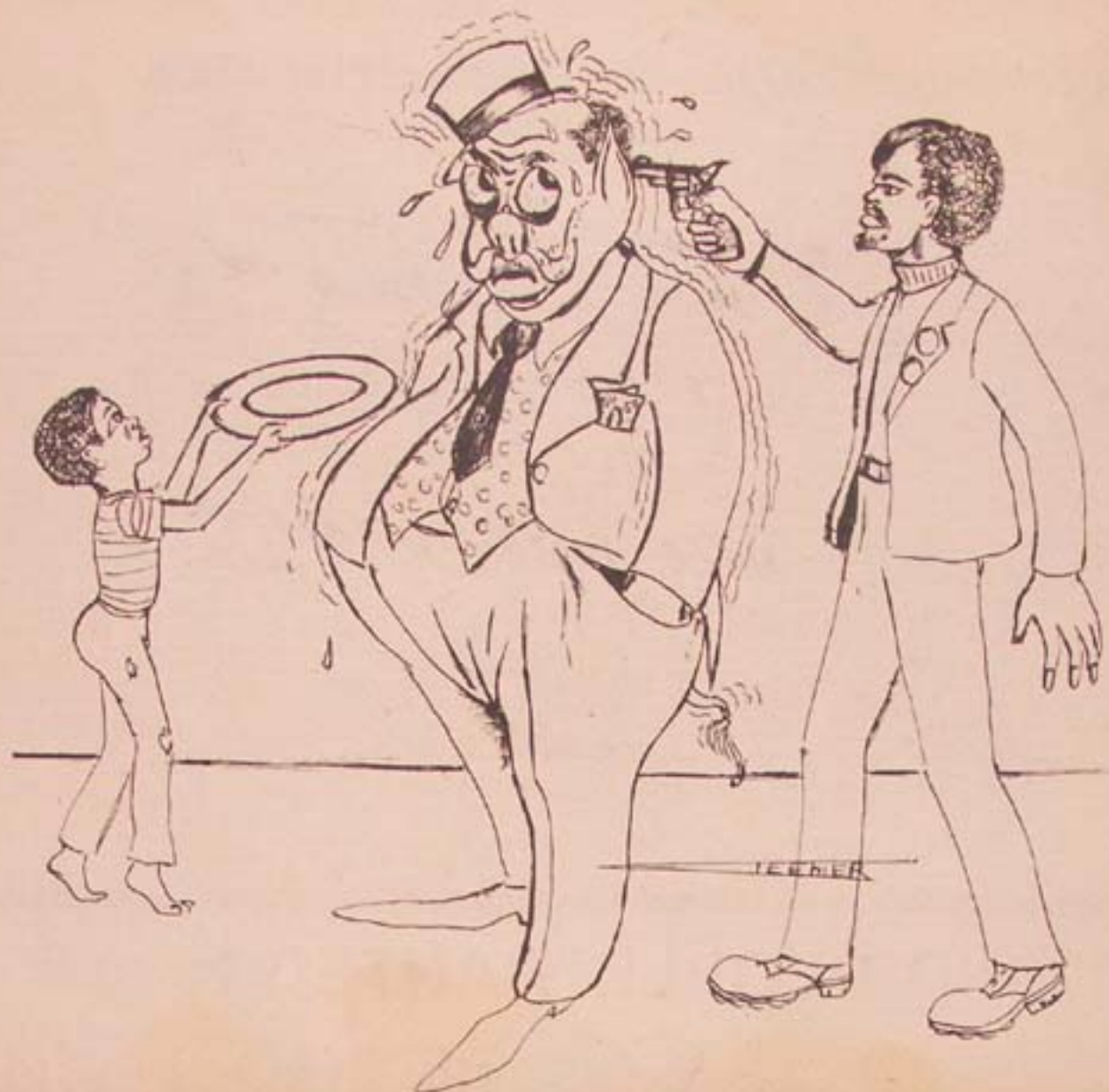
The Avaricious Businessmen Must Return their Looted Profits to the People, Breakfast for Children Is One Of the Means.