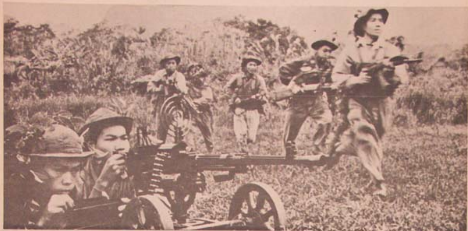
South Vietnamese Liberation Fighters Launch An Attack On the Enemy.