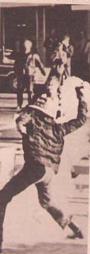
All Power to the People

The sugar quota suspension is the most serious threat the United States has at its disposal, short