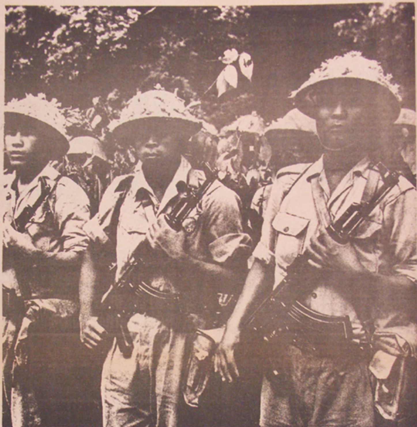
The People's Liberation Army of Vietnam