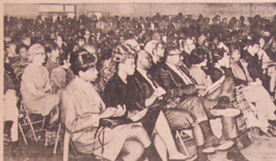
(THIS ARTICLE IS A REPRINT FROM A KANSAS CITY NEWSPAPER)