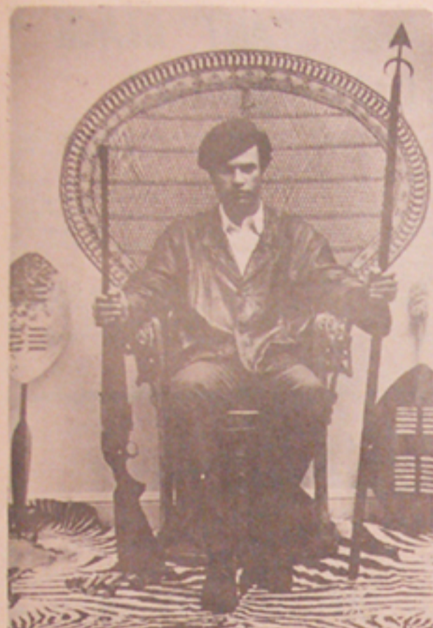
HUEY NEWTON MINISTER OF DEFENSE BLACK PANTHER PARTY