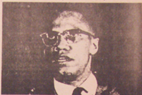
Assassinated, Feb. 21, 1965