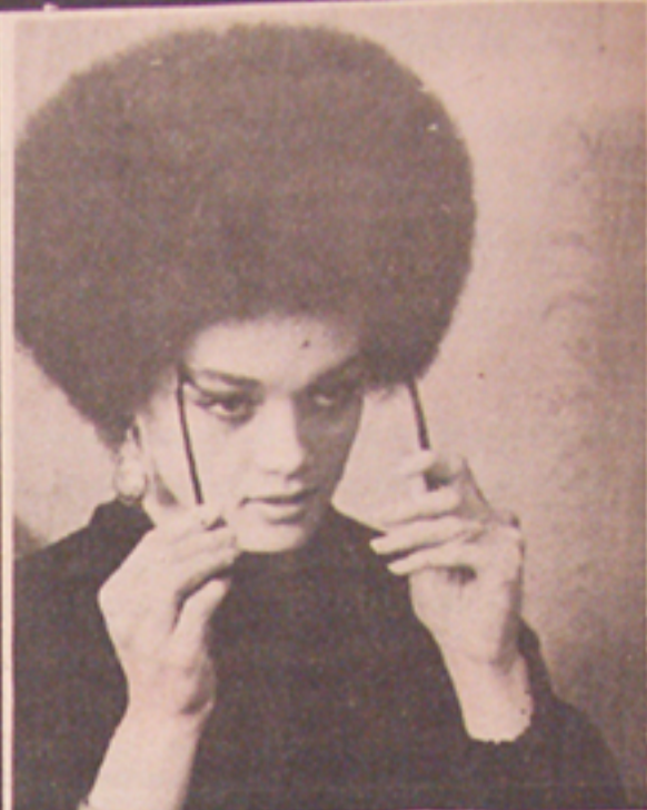
KATHLEEN CLEAVER COMMUNICATION SECRETARY BLACK PANTHER PARTY