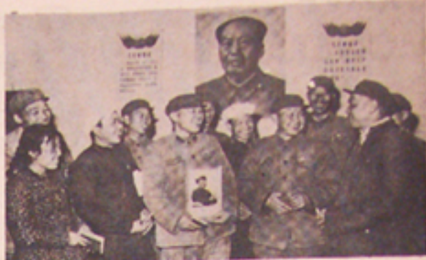
The people in Yenan, cradle of the Chinese revolution, who have stood on the side of Chairman Mao's revolutionary line and waged a heroic struggle against the class enemy are talking about their gains in studying and applying Chairman Mao's writings creatively in struggle.

Armagh is a city some 80 kilometers from Belfast, capital of Northern Ireland.