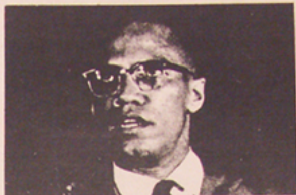
Assassinated, Feb. 21, 1965

REMEMBER BROTHER MALCOM Born, May 19, 1925