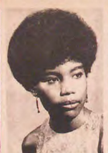
BLACK AND BEAUTIFUL