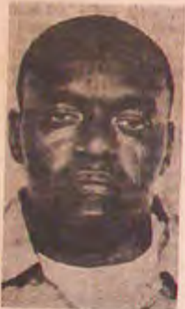
THIS BROTHER, TRYING TO SURVIVE IN RACIST AMERICA, WAS SHOT DEAD, THROUGH THE HEAD, WITH A .357-MAGNUM PISTOL BY A RACIST DOG COP, IN RACIST DOG BERKELEY.

We have a tendency to walk in a fog when it comes to this question. While we stumble along, spouting rhetoric, the racists are slowly and systematically maneuvering us into a bag. Like death creeping over the Jews in Germany without their even suspecting that it was on its way, black people to-