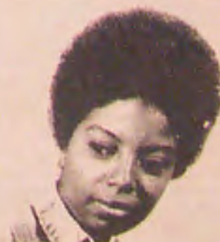
BLACK AND BEAUTIFUL