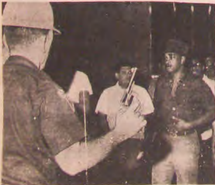
AN EYE FOR AN EYE, TOOTH FOR A TOOTH.