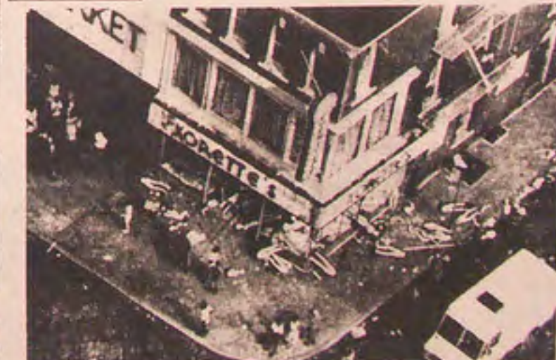
WHITES MOTHER GUILTY STONE IN THE HEART OF BLACK GLORY FINALLY BRIBED TO GET JUST REWARD, AFTER EXPLOITING BLACK ORIGINAL COURAGE FOR YEARS.