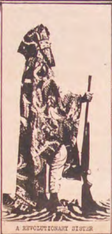
A REVOLUTIONARY SISTER