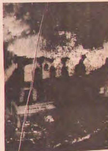
EAST COG, EAST GO.