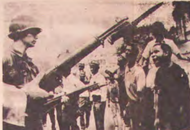
THE VISCIOUS ACTIONS OF THE RENAISSANCE BATTALIONS OF THE OCCUPYING ARMY HAS HEIGHTENED THE CONSCIOUSNESS OF BLACK PEOPLE ALL ACROSS RACIST AMERICA