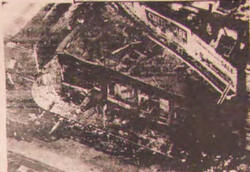
400 YEARS OF SLAVERY, SUFFERING AND DEATH IN BOUTER AMERICA EXPLODED. THE STORED UP WEALTH OF BLACK PEOPLE, WHEN IT EXPLODES ALL THE WAY WILL BRING ALL OF RACIST WHITE AMERICA'S NIGHTMARES INTO REALITY.