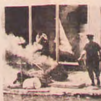
LONG WHITE COON