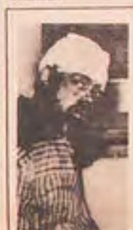
ANOTHER LEROI JONES AFTER BEING BRIBED BY RACIST COPS. ANOTHER LEROI SEEMS TO BE REMEMBERING BROTHER MALCOLM'S LAST WORDS TO HIM: "LEROI, IF YOU LOOK AT THE SITUATION OBJECTIVELY, THEN YOU WILL KNOW WHAT TO DO."

"AND WHILE WE ARE SURVIVING EVERYDAY IN OUR STRUGGLE, REMEMBER WHEN YOU RIP SOMETHING OFF, STEAL FROM THE WHITE MAN, SHAT UP WHATEVER YOU CAN, YOU ARE DEALING WITH REAL POLITICS."