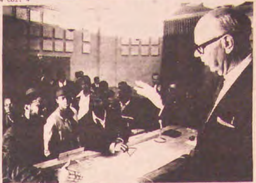
MAYOR SHELLEY LIKE TO GOT HIS HEAD WHIPPED WHEN HE TRIED TO JIVE BLACK BROTHERS FROM HUNTERS POINT WHO WANTED ACTION NOW. THE BLACK PANTHER PARTY RAN DOWN THE NEW ACTION TO BE TAKEN, WITH GUNS

jive anymore, that we intend to change the adverse conditions that we are subjected to.