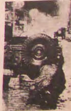
VICTIMS, NO, SAYING, RACIST DOG, BRIBED AT UNARMED BLACK PEOPLE AS THOUGH AT A TOWNHALL MEETING.