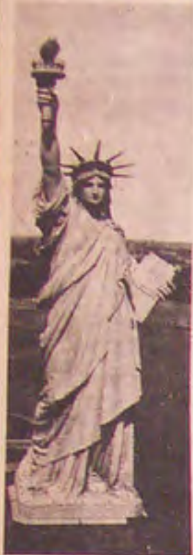
Her back faces to Harlem.