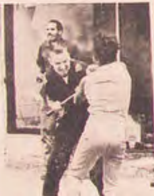
POLICE DOG ATTACKING SLAVE WOMEN