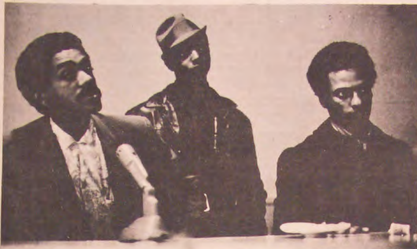
INTERVIEW WITH BLACK PANTHERS -- HUEY P. NEWTON, MINISTER OF DEFENSE, AND BOBBY SEALE, CHAIRMAN

When we got downtown, the mayor said "My intelligence reports (meaning cops) had reported that there were angry crowds milling around the Bayview Community Center area and for us to get down there quick and tell them that the jobs were found." Earlier the mayor had lied and said "There were no more jobs." We didn't move anywhere. Instead we made a couple of phone calls to tell the brothers to watch and see if the man was lying. The press (San Francisco Examiner and Chronicle) stated that we got 122 more jobs. That was a lie. The brothers got only 20 more jobs. Supposedly each other target area in the program (Western Addition, Fillmore, China Town, the Mission-Potrero Hill Area) was supposed to get 20 jobs each. The mayor reneged on these jobs and today (July 12, 1967) brothers from the Fillmore, Western Addition Area, confronted the honkey's power structure on the threat to fire poverty workers in the area. However the mayor refused to speak with the people and instead sent in his flunkies.