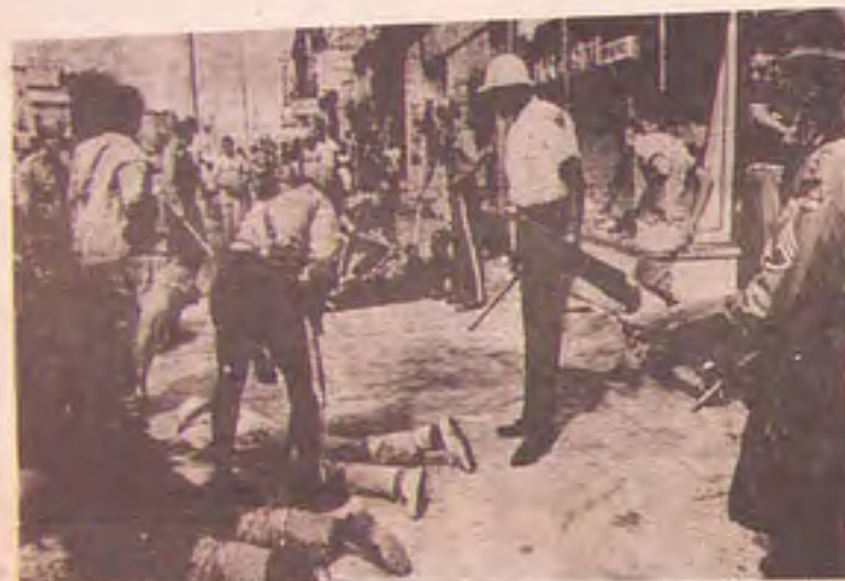
WHITES MOTHER GUILTY PIG COPS, AIDED BY A BLACK SACRIFY AGENT OF THE RACIST DOG POLICE HUMILIATE THE BLACK REVOLUTIONARIES IN THE 'MALL'