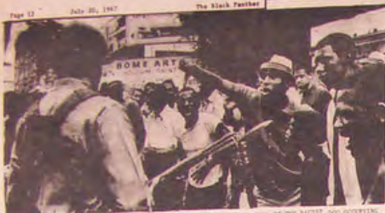
AMERICA'S LEAST HONORABLE SUBJECTS FROM LUNACY AND A TOTAL LACK OF CARE OF THE RACIST DOG RECEIVING DUES