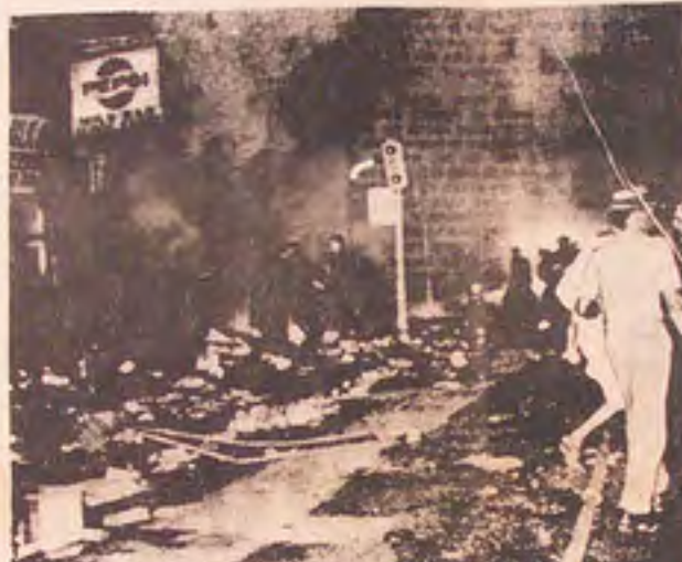
RACISTS CALL IT "REBELLION", NOT ACTUALLY ITS A POLITICAL CONSEQUENCE ON THE PART OF BLACK PEOPLE WHO HAVE BEEN DENIED FREEDOM, JUSTICE AND EQUALITY.

"AND WHILE WE ARE SURVIVING EVERYDAY IN OUR STRUGGLE, REMEMBER WHEN YOU RIP SOMETHING OFF, STEAL FROM THE WHITE MAN, SHAT UP WHATEVER YOU CAN, YOU ARE DEALING WITH REAL POLITICS."