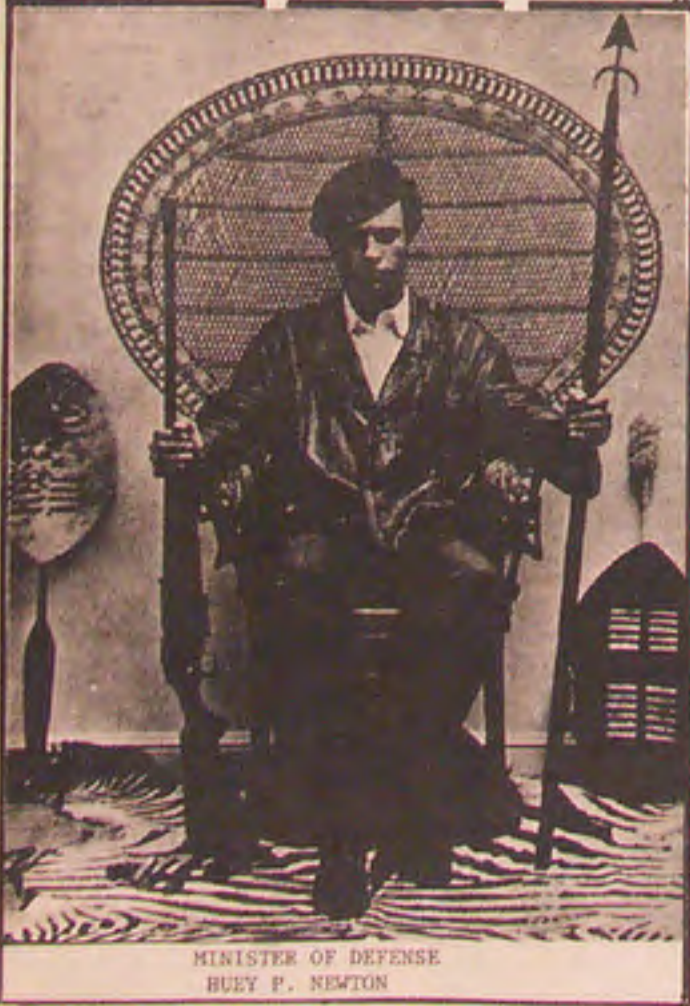
MINISTER OF DEFENSE HUEY P. NEWTON

BUTTONS 50¢ ea 6 for $1.00 ORDER BY NUMBER