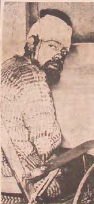
BROTHER LEROI JONES BLACK REVOLUTIONARY ARTIST BRUTALIZED BY RACIST DOG COPS IN NEWARK, NEW JERSEY IN RACIST AMERICA.

This riot like all other major riots that occur, was caused by the White Racist dog cops. This time they were observed as they misused a brother. The brother that observed the dogs, stated on nation wide T.V. that he saw these racist cops pick up items of value and throw them in the car where they were holding the brother they had arrested.