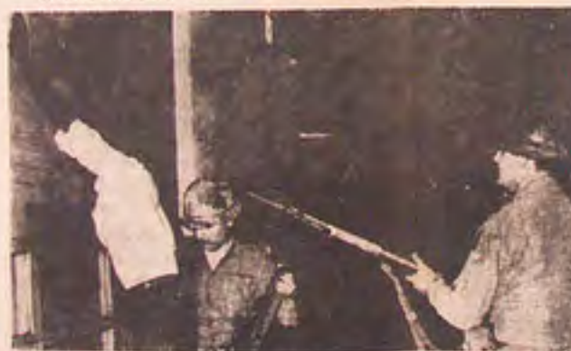
ARMED WHITE RACISTS TERRACIDE UNARMED BLACK BROTHERS. WHY IS HE CHAINED?

EVERY BRIBARAL IS REVEAL... AS UNARMED IN PREVIOUS OPPRESSION THROUGHOUT THE OPPRESSED BLACK COMMUNITIES IN RACIST AND AMERICA, REMIND THE BUREAU ADVISORS, BRIBING THOSE WHO LEFT OFFICERS AND ARMY LEADY TAKING AND HOLD MILLION PIPES. THIS IS OPPRESSIONALISM. WE MUST AGENT REMEMBER TO CONTROL OUR TACTICS AND THE OPPRESSOR LEAVING NO ROOMING TO A BETTER TACTIC IN SUCH A WAY AS TO BRIBED FROM CHARACTER IN THE PEOPLE THAN BY REVERSE MESSAGES.