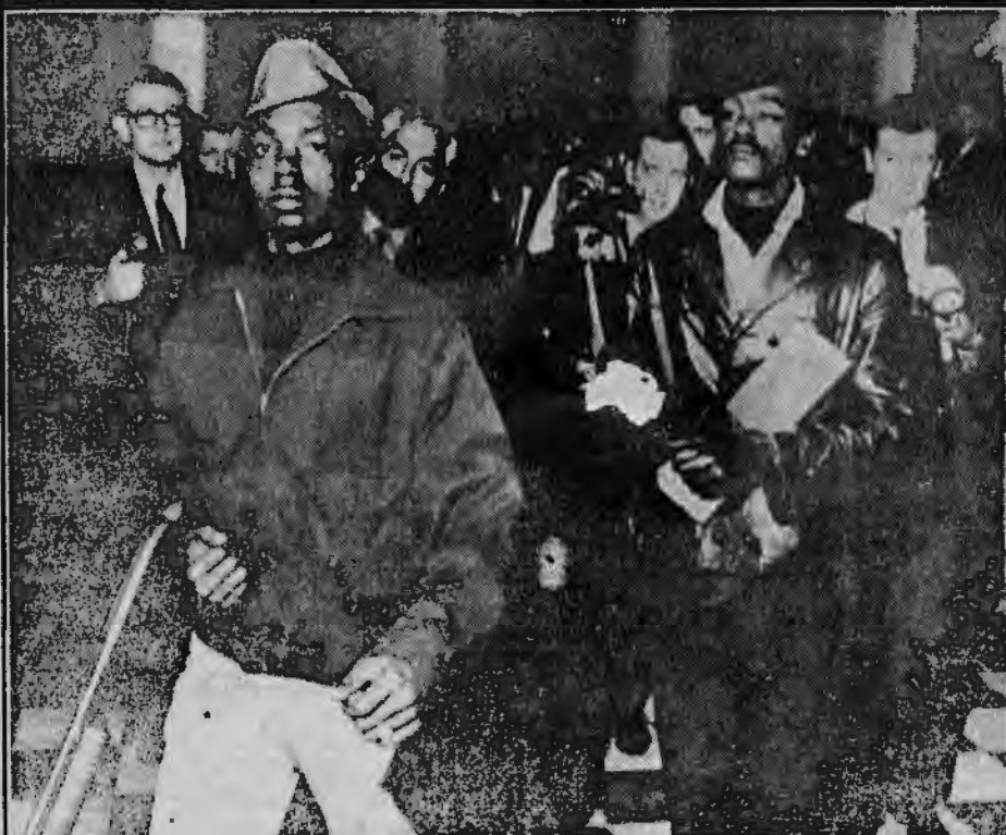
FRONT, TREASURER AND CHAIRMAN BOBBY SEALE OF B.P.P.S.D.