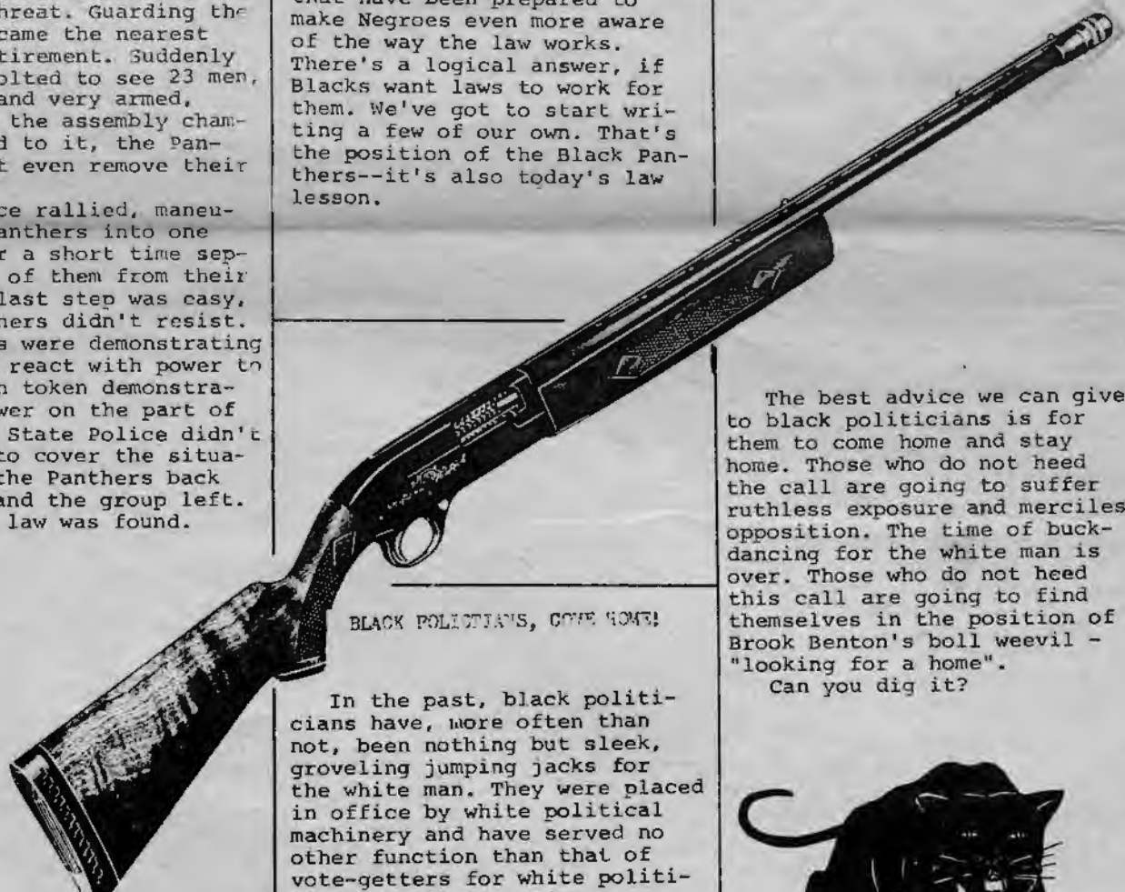
BLACK POLITICIANS, COME HOME!

The Black experience with the law is that it is often used to the disadvantage of the race. The lessons of history, the possible threat of racial annihilation and the very real concentration camps that have been prepared to make Negroes even more aware of the way the law works. There's a logical answer, if Blacks want laws to work for them. We've got to start writing a few of our own. That's the position of the Black Panthers--it's also today's law lesson.