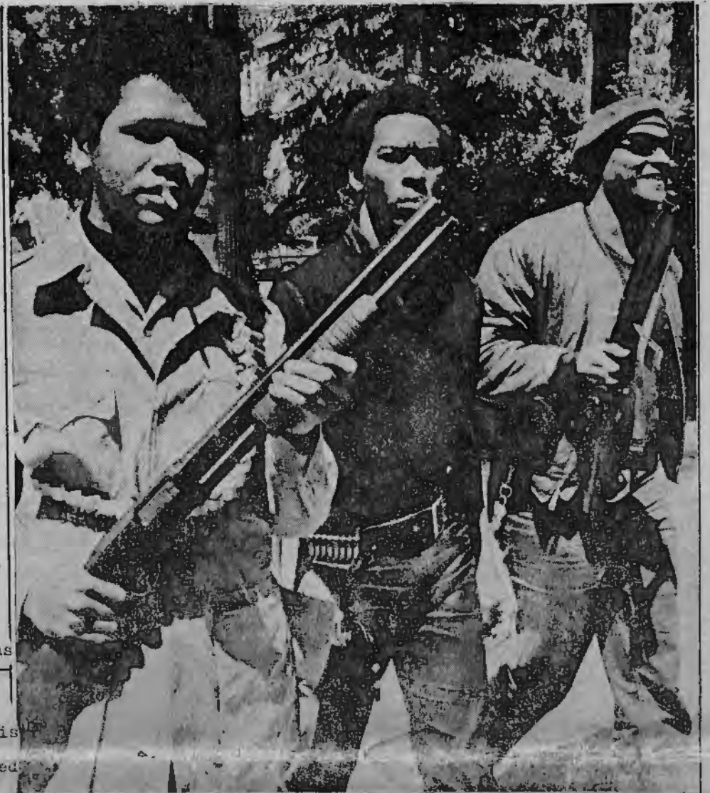
THESE ARE THREE OF THE TWENTY-THREE COURAGEOUS BROTHERS AT THE CAPITOL. THEY ARE REPRESENTATIVES OF THE SPIRIT OF 67. "BE RIGHTEOUSLY ARMED AND READY FOR ACTION."