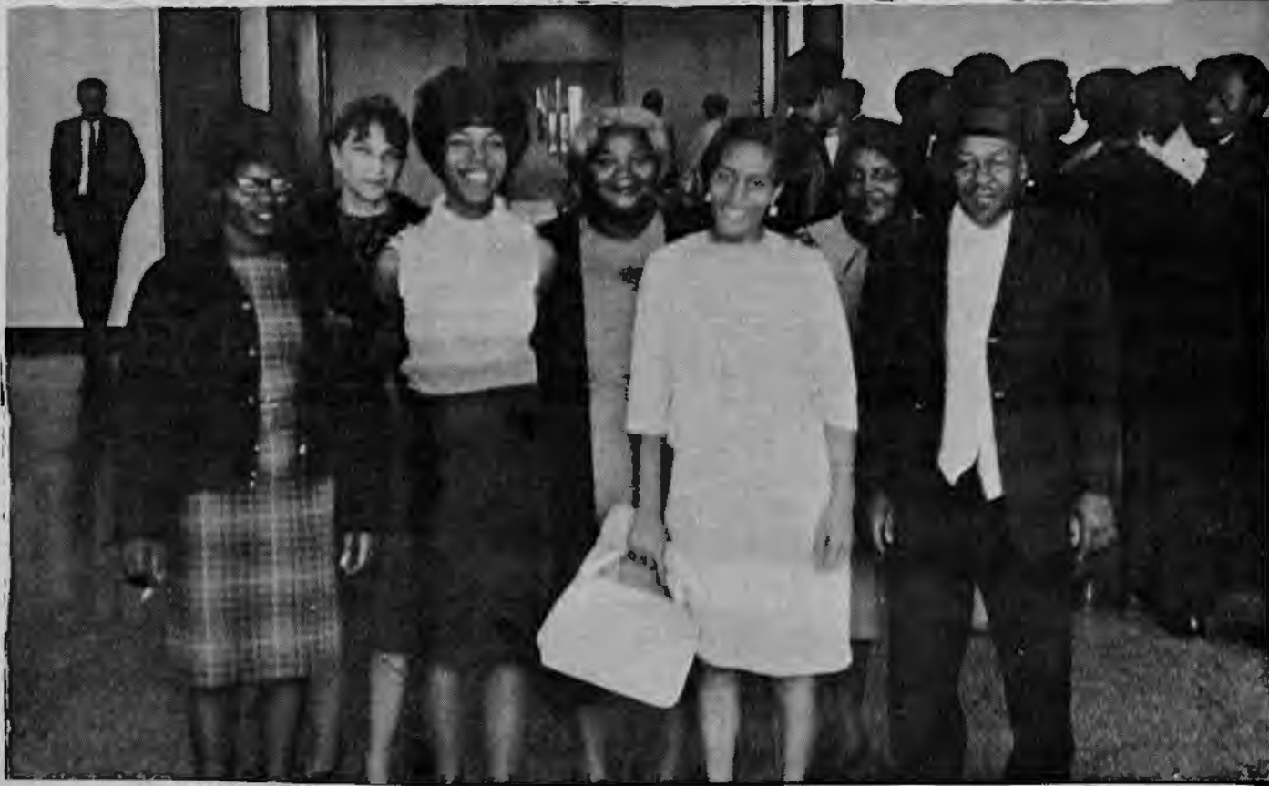
UNDAUNTED RELATIVES OF THE VICTIMS OF SACRAMENTO POLICE PERSECUTION

the action taken or contemplated. These conscienceless black tools did not care about the suffering of the black masses. All they were concerned with was their own standard of living - which was very high compared to that of other blacks. While the black masses wasted away in the slums and ghettos, dying from lack of adequate clothing, shelter, and proper medical attention, living worthless lives because of the lack of proper educational facilities, black politicians ate good food, wore the best of clothes, lived in fine homes and sent their children to the best schools.