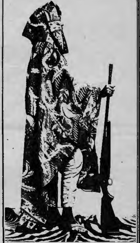
A REVOLUTIONARY SISTER

But no matter what lying scheme these racists come up with, the Black Panther Party for Self Defense is going to grow in numbers, influence and power and there is nothing that a gang of racist dogs can do about it.