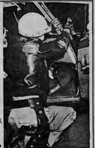
THE BLACK COMMUNITY

TO RACIST SHERIFF YOUNGER DENZIL DOWELL IS JUST ANOTHER DEAD NIGGER.