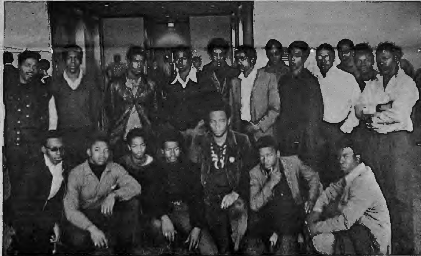
18 BLACK PANTHERS AFTER ARRAIGNMENT IN SACRAMENTO MUNICIPAL COURT BUILDING