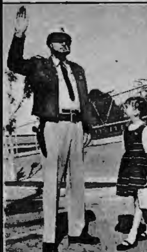
THE WHITE COMMUNITY

Below is the statement prepared by Huey P. Newton, Minister of Defense, and delivered by Bobby Seale, Chairman, of the Black Panther Party for Self-Defense, May 2, 1967, at the state capitol in Sacramento, California. When this statement is read carefully, it becomes obvious that all that is here is TRUTH. Knowing full well they were legally exercising their constitutional rights, the Panthers made fools of the cops who tried to take the guns away from them, and suffered the humiliation of having to give them right back. The dumb Capitol cops didn't even know their own gun laws. Continued on page 2