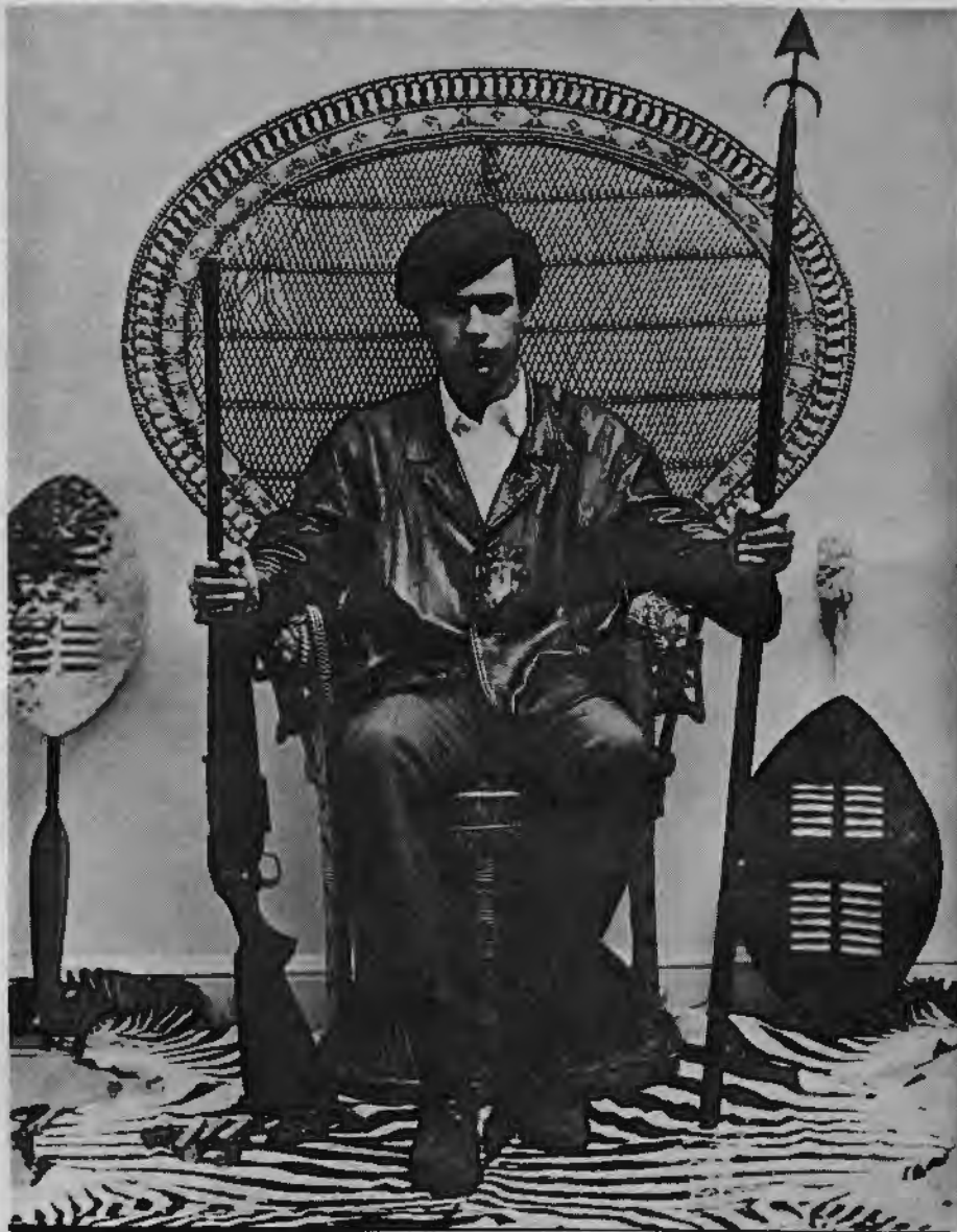
HUEY P. NEWTON