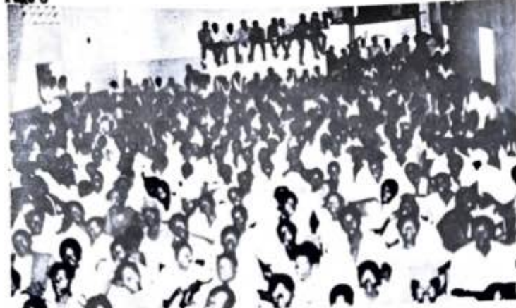
ONE OF MAJOR EFFORTS OF AFRICAN LIBERATION SUPPORT COMMITTEE REPRESENTATIVES IN AFRICA, HAS BEEN TO SHOW THE ALD FILMS TO THOUSANDS OF AFRICANS.