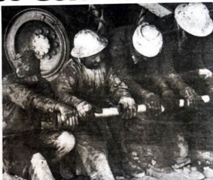
THE U.S. OIL CRISIS DID NOT BEGIN WHEN ARAB COUNTRIES SHUT OFF THE OIL FLOW. The deepening crisis will hit hard at inner city dwellers, as well as the poor everywhere.