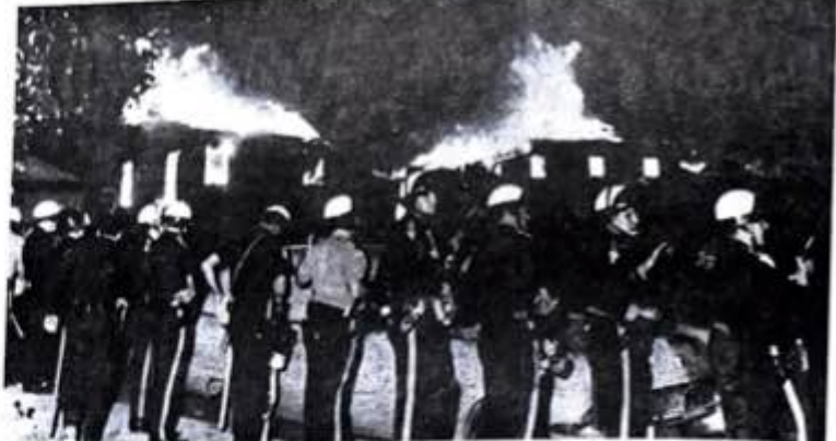
UNDER GUISE OF DEVELOPMENTAL AID, THE U.S. HAS BEEN SECRETLY TRAINING special policemen from oppressive Third World regimes the latest firebombing techniques.

On the armed struggle in Rhodesia, the Tanzania delegate said, "The people of Zimbabwe have lost confidence in the British Government, which has throughout history, claimed to have fought for justice and which has crushed rebellions elsewhere, except in Rhodesia by the use of force." He said Zimbabwe people have therefore, no alternative except to organize themselves and fight for their rights by the use of force.