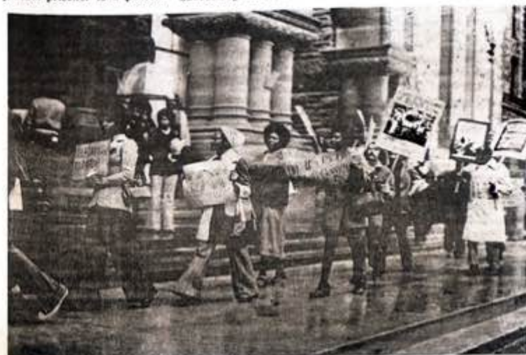
STORY IN THE NEWS. RECENTLY BLACK PEOPLE IN CANADA, TOOK TO THE STREETS TO protest the Canadian government's decision to send an economic trade mission to South Africa. Shown is one of several such demonstrations - this one on the grounds of the Canadian Parliament.

The struggle against racism and white chauvinism anywhere is a struggle against Imperialism everywhere.