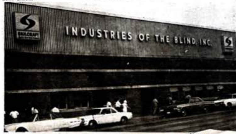
LAST INDUSTRIES OF THE BLIND HAS BEEN THE