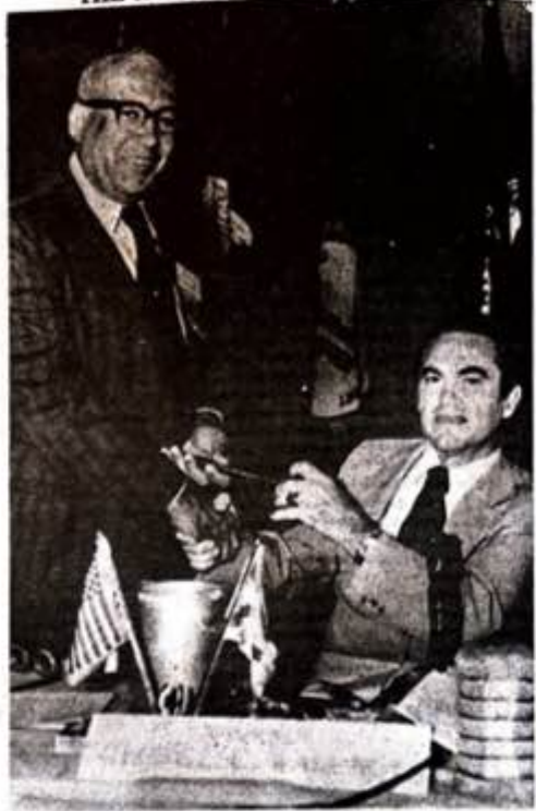
GOV. GEORGE WALLACE IS SEEN MORE AND MORE frequently with Black people. Here he greets the Black governor of the Virgin Islands.

Before delivering the sentence, the judge heard several witnesses appeal on Carlos's behalf. Three-Jacinto Rivera Perez, President of the nationalist Party of Puerto