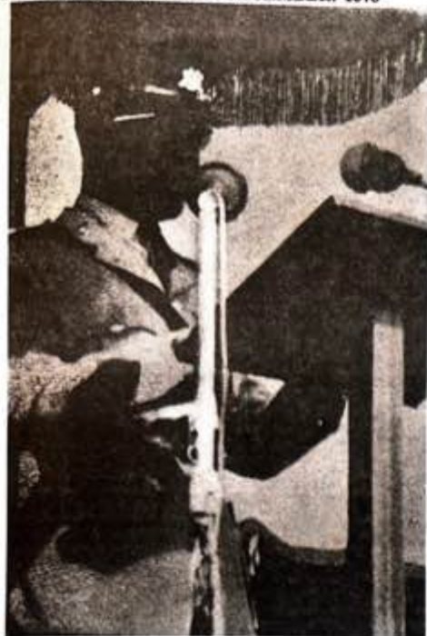
COL. I. K. ACHEAMPONG, LEADER OF THE GHANA military government.