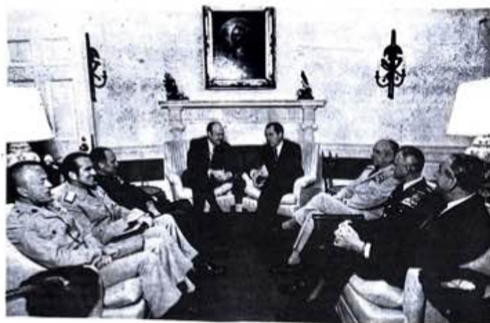
NIXON HAS GATHERED AROUND HIMSELF A LARGE GROUP OF MEN WITH LONG military backgrounds. The power he has at his disposal is tremendous.