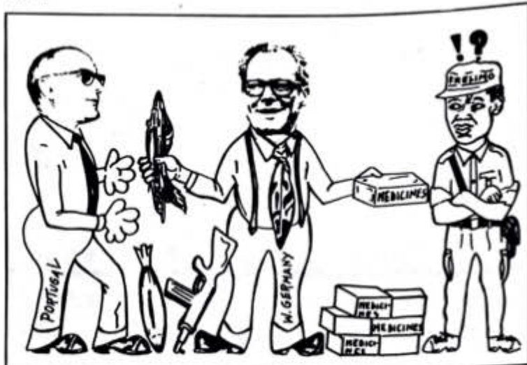
FRELIMO REJECTS SMALL SCALE "HUMANITARIAN" AID FROM A WEST GERMANY administration which provides greater support for Portugal.