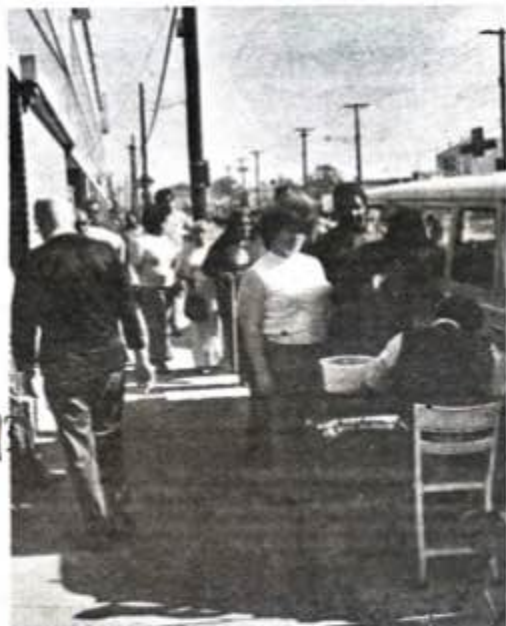
DURING BREAKS AND ON THEIR LUNCH HOUR BLIND workers lined the streets outside the building to cast their vote to build an independent union.

The Blind workers, mostly Black, are now faced with the difficult task of getting management to recognize the newly formed independent union.