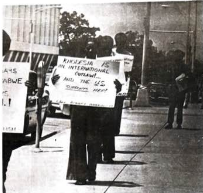
ILLEGAL CHROME SHIPMENTS FROM RHODESIA CONTINUE TO ARRIVE IN THE U.S. Each time, the shipments are met with protest demonstrations and Black workers refusing to unload the ships.

Whether or not this projected ten year project will prove successful with the work being supervised by agents of imperialism remains to be seen. There is little doubt that it is in the interest of Western nations to keep these West African states weak.