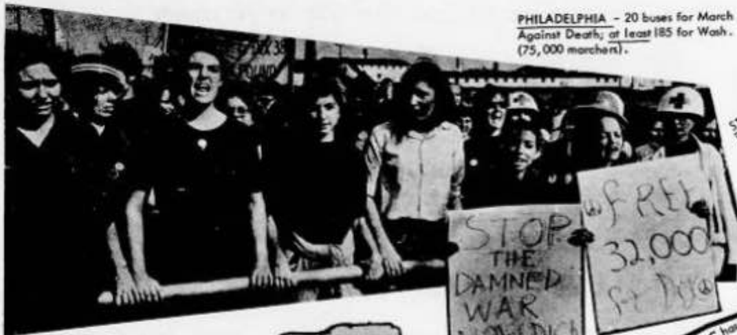
PHILADELPHIA - 20 buses for March Against Death; at least 185 for Wash. (75,000 marchers).

ST. LOUIS - expects 400 to come to Washington after booming Moratorium - the rest of Missouri surging too!