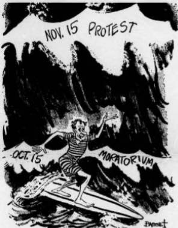
NOVEMBER ACTION SCHEDULE