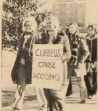
- - RIGHT ON - -

red tops that it is merely a protest. For example, several members of last summer's court told me that they were forced to explain a student whom they felt did not deserve such action. The administration, however, informed them that as a student court they represented Radford College and must enforce the rules outlined by the college. In other words, they were not to treat cases individually, but according to set, inflexible standards.