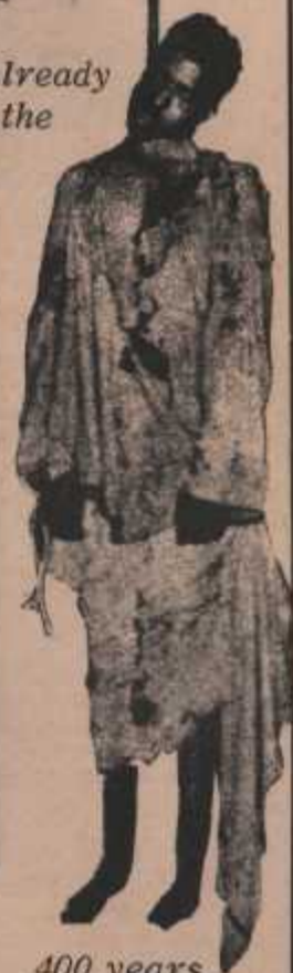
400 years of oppression