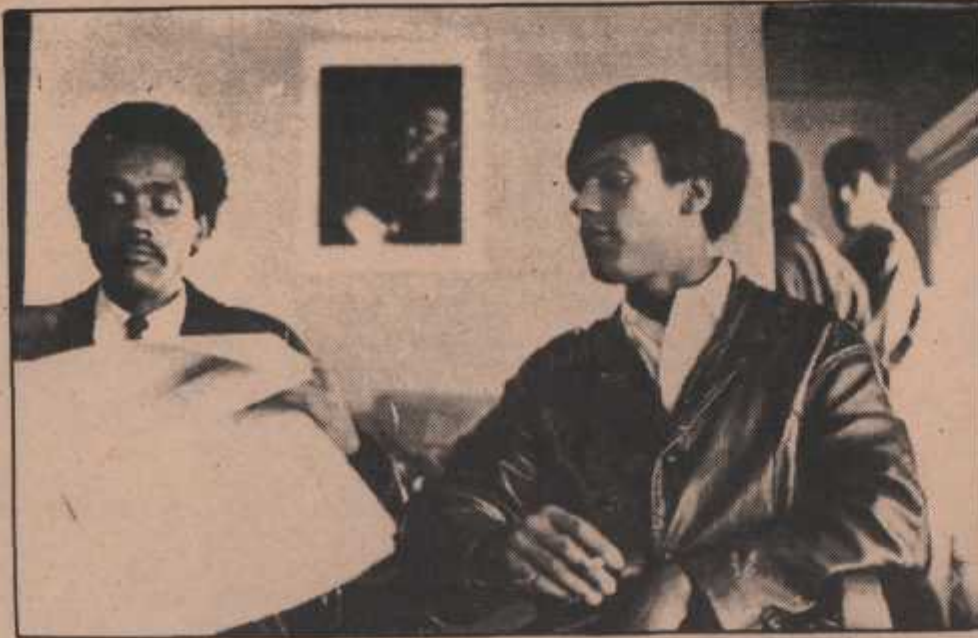
Chairman Bobby Seale, and Minister of Defense Huey P. Newton.