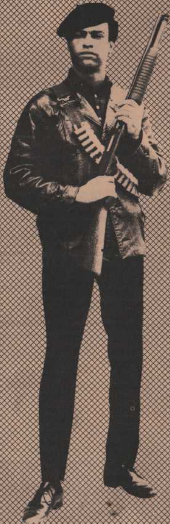
Huey P. Newton Minister of Defense Black Panther Party