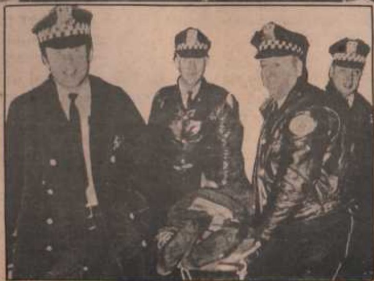
Smiling pigs carry Fred Hampton's body