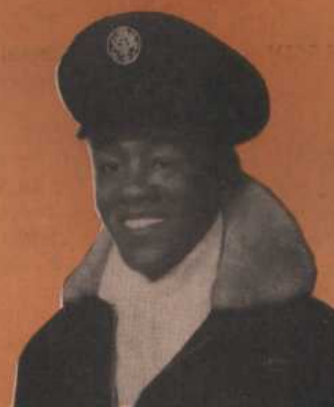
Bobby Seale, Chairman, BPP Political Prisoner