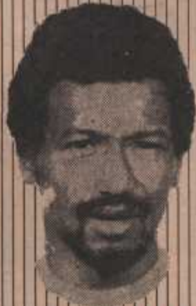
Arrested: Friday, April 17, 1970 Frame-up charges: