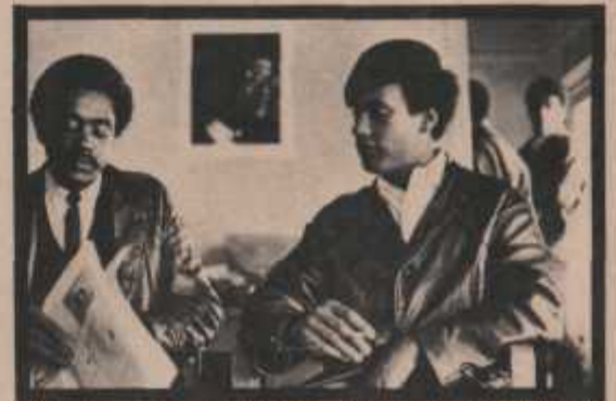
July 1967--Minister of Defense, Huey P. Newton (right) and Chairman, Bobby Seale (left), resulting an early edition of B.P.P. Newspaper at the home of Edridge Cleaver, Minister of Information B.P.P.

The Black Panther Party Black Community News Service is the alternative to the 'government ap-