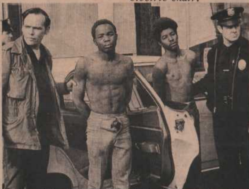
300 gestapo pigs attacked 11 Panthers at the office in Los Angeles, California.