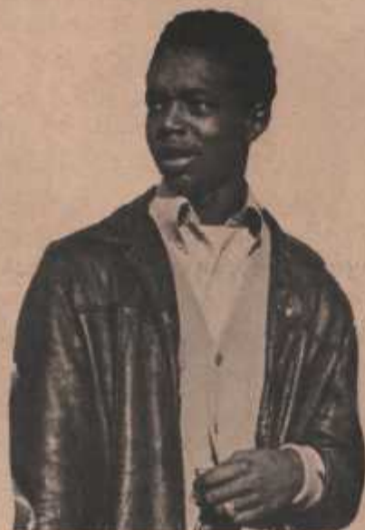
Lil' Bobby Hutton He was the beginning Murdered by Oakland Pigs April 6, 1968