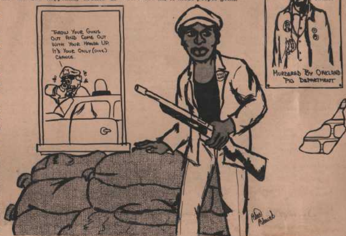
THE CHOICE IS UP TO US AND WE WILL HAVE TO DECIDE QUICKLY.

in your mind if you wanna be' or go through some other changes, but playing the drums, or dancing the 'funky chicken' or laying up in bed with every man or woman that comes along or running around yelling, "Black Power" and "Off the Pig" is not going to kill or even injure a pig. We can go to the ovens and the gas chambers voluntarily and let the pigs sock it to us, or we can sock it to them instead - only by socking it to the pigs are we going to survive America. The means of resistance are by whatever means necessary and the only thing that will slow down or stop the fascists in their attempts to eliminate Black people is revolutionary action which should be moved on at once. We must begin to put our theories into practice, so "Free