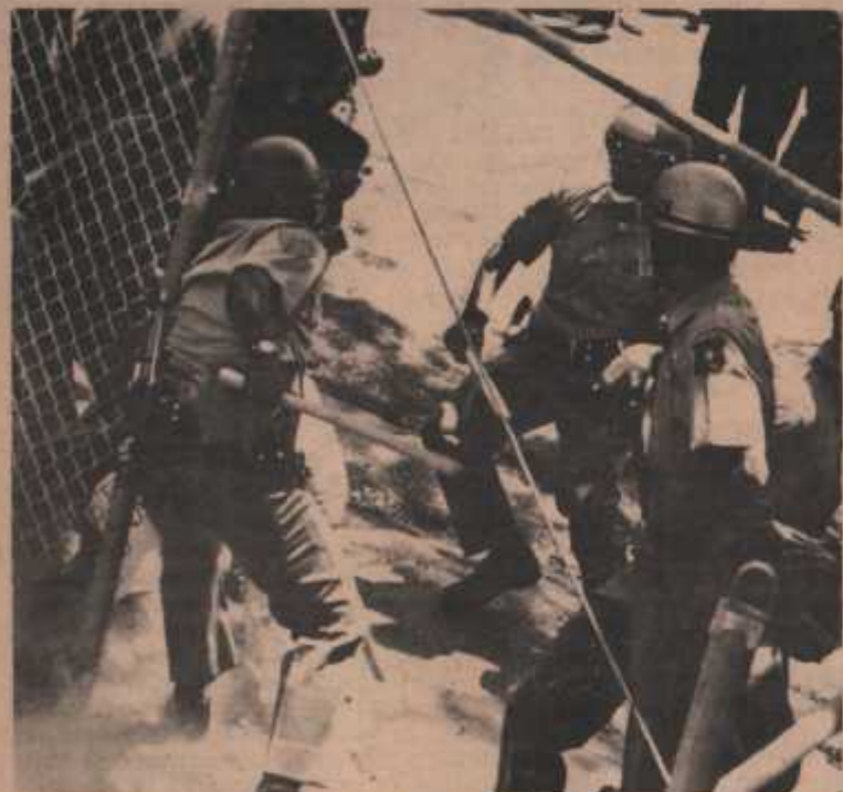
WE MUST PREVENT A FASCIST STATE IN AMERICA

against the oppressed and the base upon which capitalism builds the fascist state, the pig mercenary police force.